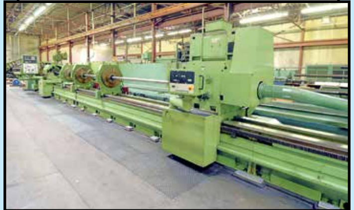
WOHLENBERG PB2-1000 X 10M COUNTER ROTATING DEEP HOLE BORING MACHINE