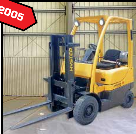
HYSTER 3,600-LB. CAP LP FORKLIFT