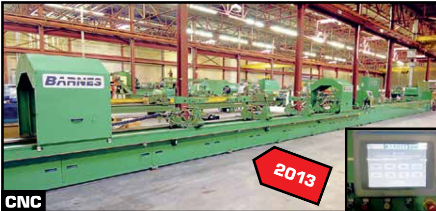
BARNES MDL. HH-12 30' HORIZONTAL HONING MACHINE

(2) BARNES MDL. 6D , 25' stroke, mechanical chain drive, 25 HP, 18"W. x 30"L. fixture tbl., 4-point steady rest, open style steady rest, Barnes paper filter honing oil system, ( offered separately ), S/N 8780, S/N 9207.