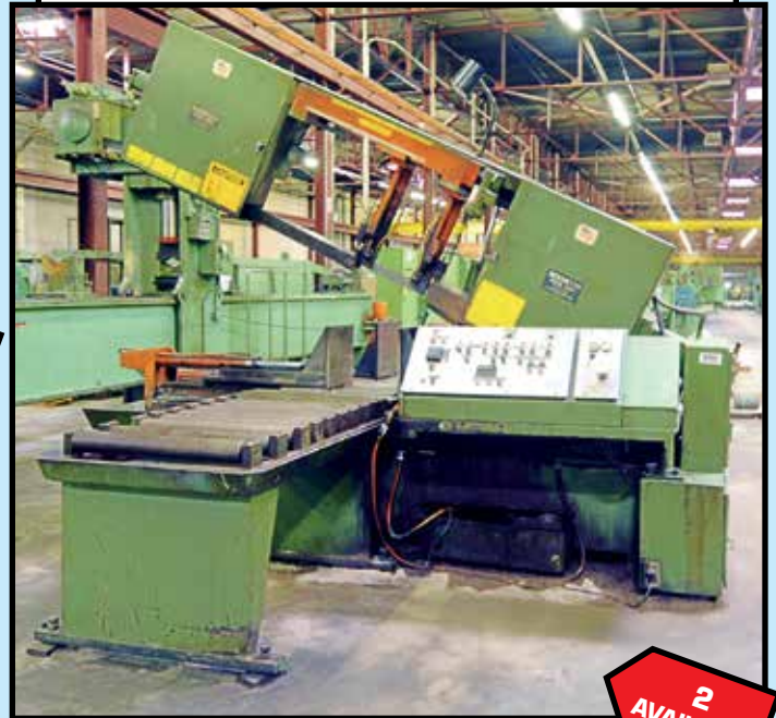
HEM MDL. H160A AUTOMATIC HORIZONTAL BANDSAW

HEM MDL. H105A , 16"W. x 14"H. cap., 1.25" blade width, 7.5 HP, auto. feed, (2) 10' heavy-duty infeed roller conveyors, output tbl., S/N 366292.