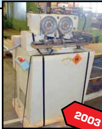
TBT GUN DRILL GRINDER