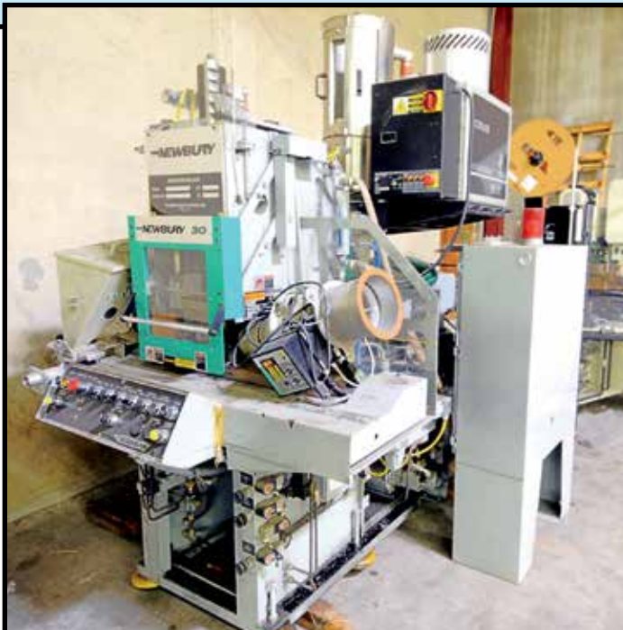
NEWBURY VERTICAL INJECTION MOLDER

Conserve Your Cash & Increase Your Bidding Power AuctionLea$e Provides M&E Financing With Approvals from $5,000 to $999,000 • (800) 438-1470 Apply Online: www.AuctionLease.com