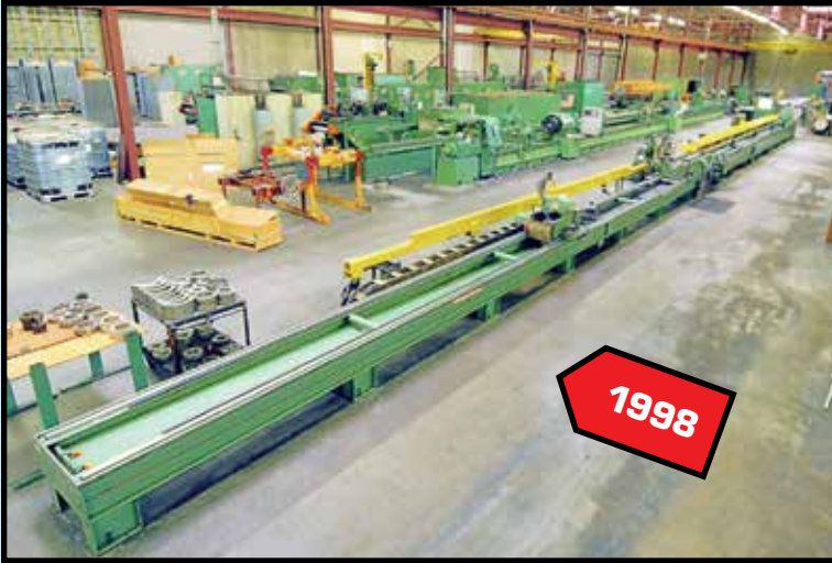
GENERAL HONE MDL. GH210, 41' HORIZONTAL HONING MACHINE