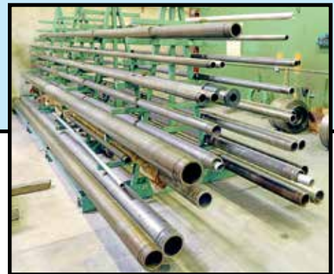
PARTIAL VIEW OF BORING BARS

DOZENS OF BORING BARS FOR THE ABOVE MACHINES FROM BAR #11 TO #29, IN LENGTHS FROM 19.5' TO 48' W/RELATED BAR STORAGE RACKS AND LIFTING BEAMS.