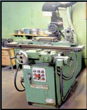
CINCINNATI NO. 2 TOOL AND CUTTER GRINDER