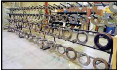
VIEW OF PRESSURE HEAD FLANGES