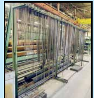
VIEW OF GUN DRILLS