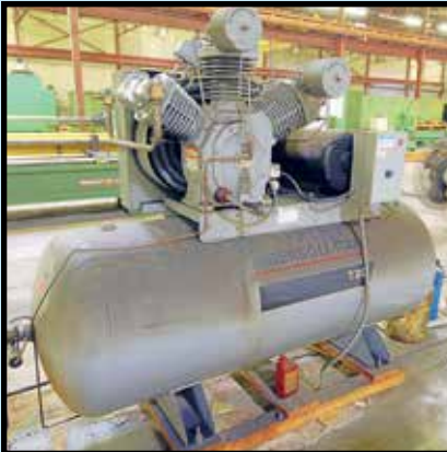
INGERSOLL RAND 25 HP AIR COMPRESSOR

FORKLIFT STYLE BARREL HANDLER W/CHAIN TILT. ASSORTED STACKING MATERIAL RACKS.