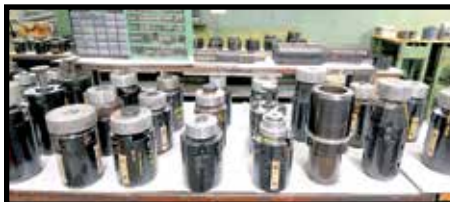
PILOTED COUNTERBORING TOOLS