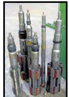
PARTIAL VIEW OF HONING HEADS