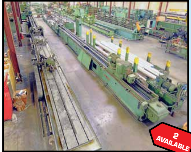
VIEW OF BARNES MDL. 15-HH, 40' HORIZONTAL HONING MACHINES