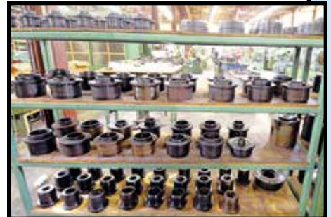
PARTIAL VIEW OF STUFFING BOXES