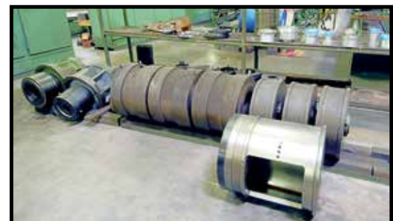
VIEW OF DAMPERS, PRESSURE HEADS AND LANTERN CHUCK