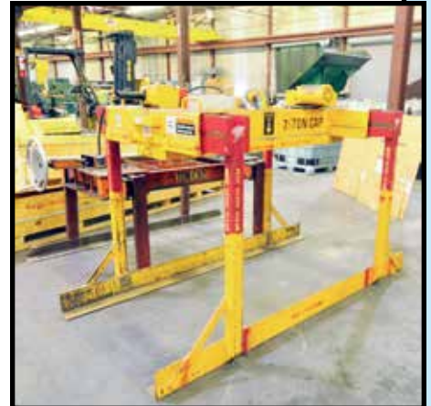
KADY AND BUSHMAN SHEET LIFTERS