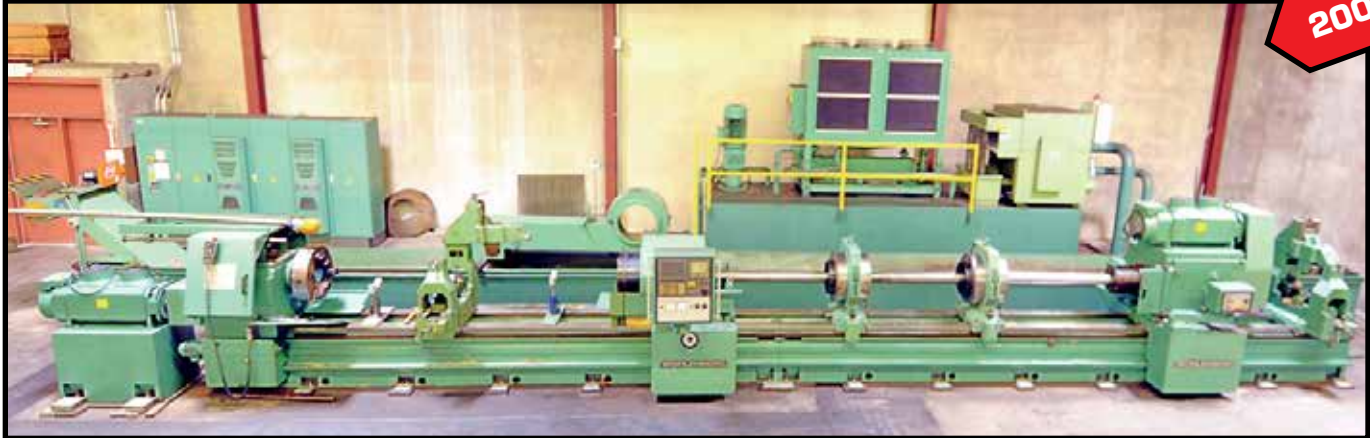
WOHLENBERG PB2-1000 X 4M COUNTER ROTATING DEEP HOLE BORING MACHINE

(2) WOHLENBERG MDL. PB2-1000 X 4M , new 2006, 39.37" sw. over bed, 157" (4 M) max. boring depth, 7.87" solid boring cap., 17,600-lb. max. workpiece weight, 13.93" counterboring cap., 1.19-196 IPM boring spds., 2.9-1,120 RPM main spndl. spds., 4.09" spndl. bore, 24-1/2" 3-jaw universal chuck, 100 HP main spndl. drive, 100 HP boring spndl. drive, double rack drive carriage, Fanuc 21iTB CNC, (2) damper rests w/med. dampers, med. size pressure head, chip conveyor, (2) H.D. steady rests, Koolant Koolers Mdl. AFD25000P-ST coolant chiller system, fabricated coolant tank, (2) 50 HP coolant pumps, Polo Mdl. SAFI-T1.7 pressure filter unit w/paper filter, S/N D4583, S/N D4582.