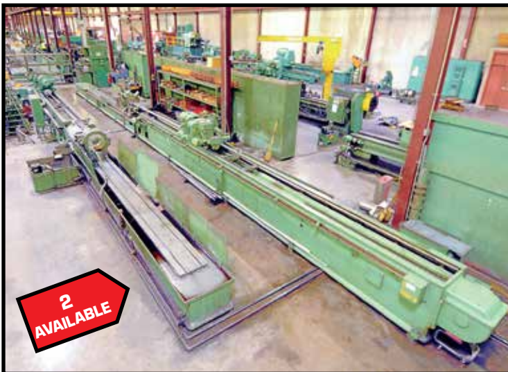
VIEW OF BARNES MDL. 6D, 25' HORIZONTAL HONING MACHINES

Formerly Assets of TRIDENT METALS 405 N. PLANO ROAD BUILDING #3 RICHARDSON, TX 75081