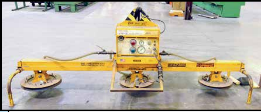
ANVER VACUUM SHEET LIFTER