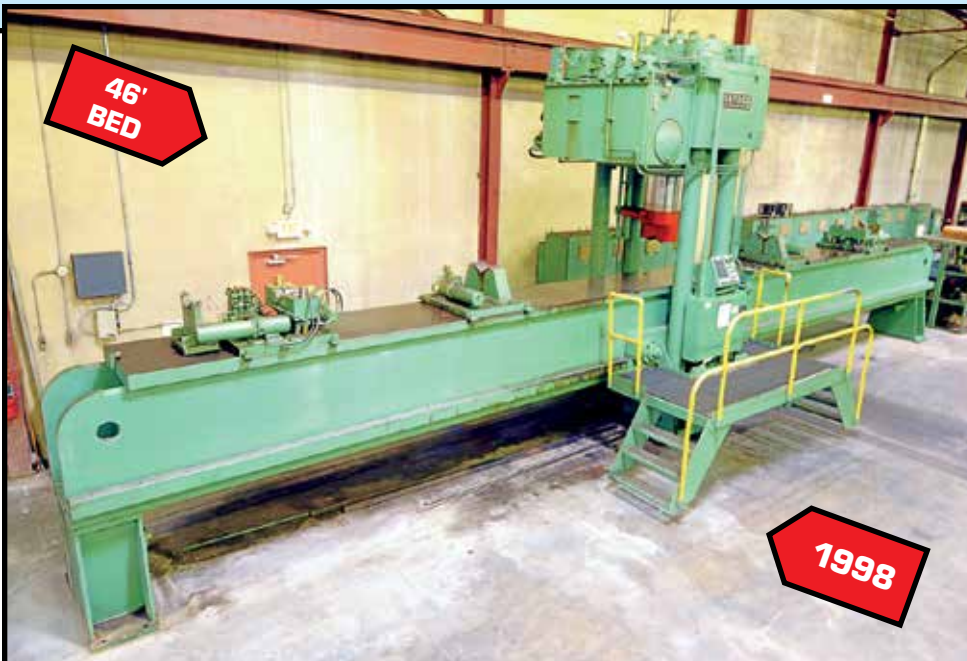
SAVAGE 1,000 T. TRAVELING COLUMN STRAIGHTENING PRESS