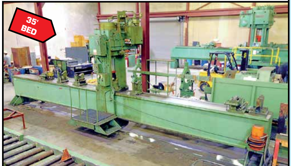
SAVAGE 350 T. TRAVELING COLUMN STRAIGHTENING PRESS

If you cannot attend this sale or bid online, we will bid on your behalf. Contact Houston office at (713) 691-4401 for instructions, or go to our website at www.pmi-auction.com .