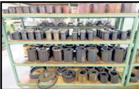
SPLIT CLAMPS AND STUFFING BOXES

SMALL AND LARGE PRESSURE HEADS; STUFFING BOXES; FLANGE RINGS; SMALL AND LARGE SIZE DAMPER SETS; HUGE ASSORTMENT OF PHENOLIC DAMPER BUSHINGS; BORING BAR ADAPTERS; SPARE STEADY RESTS; LANTERN CHUCKS AND CHIP SHROUDS; 35.5" 4-JAW CHUCKS; HYD. SKIVING RESTS; FIXTURE TABLES.