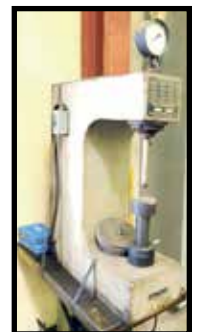
BRINELL HARDNESS TESTER