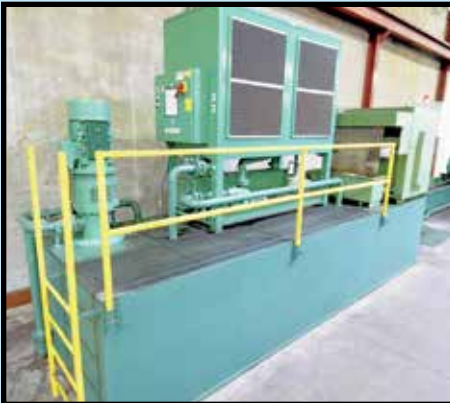
EXAMPLE OF BORING MACHINE COOLANT SYSTEMS