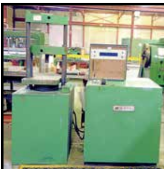
SATEC TENSILE TESTING MACHINE

MICROMETER SETS IN 1"-12" CASES, DEEP THROAT MICROMETERS; BORE GAGES UP TO 6" CAP.; 80" HELIOS DIGITAL CALIPER; ASSORTED HAND MEASURING TOOLS.