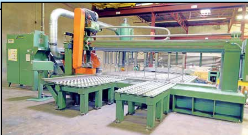
SAVAGE TRAVELING HEAD PLATE SAW

MSC INDUSTRIAL MDL. 09514654 , 24" throat depth, blade welder, grinder, variable spd., tilt tbl., S/N 0144.