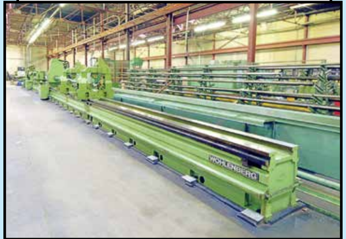
WOHLENBERG PB2-1000 X 10M COUNTER ROTATING DEEP HOLE BORING MACHINE

(4) WOHLENBERG MDL. PB2-1000 X 11M , new 1983–1998, 39.37" sw. over bed, 433" (11 M) max. boring depth, 7.87" solid boring cap., 22,000-lb. max. workpiece weight, 13.93" counterboring cap., 1.19–196 IPM boring spds., 2.9–1,120 RPM main spndl. spds., 4.09" spndl. bore, 100 HP main spndl. drive, 100 HP boring spndl. drive, double rack drive carriage, Fanuc Powermate or 0-T PLC, (3) damper rests w/med. dampers, med. size pressure head, 20" 3-jaw universal chuck, (3) H.D. steady rests, chip conveyor, 50 HP vert. coolant pump, coolant chiller unit, Polo Mdl. SAFI-T1.7 pressure filter unit w/paper filter or American Heller cartridge filter, S/N 4538 (1998), S/N D4516 (1995), S/N 4436 (1988), S/N 4293 (1983).