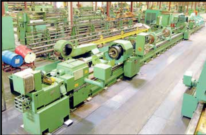
WOHLENBERG PB2-1000 X 11M COUNTER ROTATING DEEP HOLE BORING MACHINE

WOHLENBERG MDL. PB2-1000 X 10M , new 1991, 39.37" sw. over bed, 393" (10 M) max. boring depth, 7.87" solid boring cap., 22,000-lb. max. workpiece weight, 13.93" counterboring cap., 1.19–196 IPM boring spds., 2.9–1,120 RPM main spndl. spds., 4.09" spndl. bore, 24-1/2" 3-jaw universal chuck, 100 HP main spndl. drive, 100 HP boring spndl. drive, double rack drive carriage, Fanuc Powermate PLC, (3) damper rests w/med. dampers, med. size pressure head, chip conveyor, (3) H.D. steady rests, Koolant Koolers Mdl. AFD25000P-ST coolant chiller system, fabricated coolant tank, (2) 50 HP coolant pumps, Polo Mdl. SAFI-T1.7 pressure filter unit w/paper filter, S/N 4466.