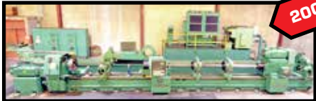
WOHLBERG PB2-1000 X 4M COUNTER ROTATING DEEP HOLE BORING MACHINE