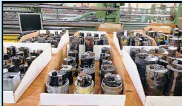
BTA CUTTER HEADS