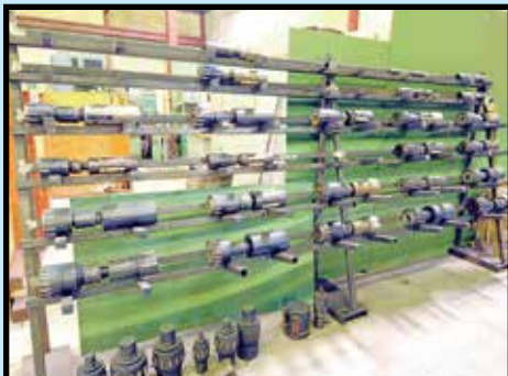
ROLLER BURNISHING TOOLS