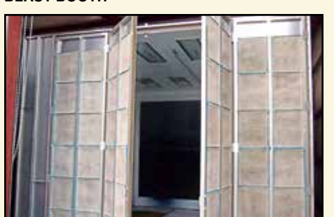
KAYCO PAINT BOOTH