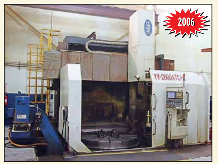
YOU JI YV-2000ATC VERTICAL BORING MILL