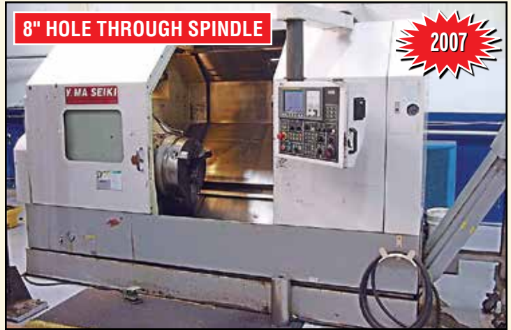
YAMA SEIKI GS-460 CNC LATHE

2006 YOU JI YV-1200ATC Vertical Boring Mill, Fanuc Oi-TC, 49" dia. face plate type chuck w/4-jaws, 63" swing, 47" max. turning height, vertical ram head w/12-position auto. tool changer, travels: max. cross travel (X-axis): -3.94"; +34.5", cross rail vertical travel: 31.5", vertical travel of ram (Z-axis): 35.94", table speeds (2 ranges): 1–350 RPM, table weight capacity: 11,000-lbs., cutting feed rate: .01–197 IPM, rapid feed rates: X-axis 472 IPM, Z-axis 394 IPM, chip conveyor, 60 HP table motor, S/N: 06VI2T1480.