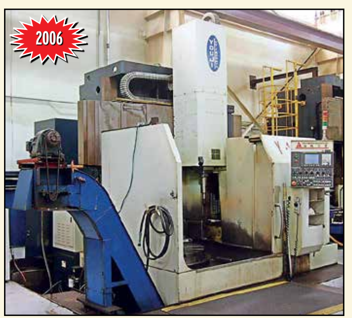
YOU JI YV-1200ATC VERTICAL BORING MILL