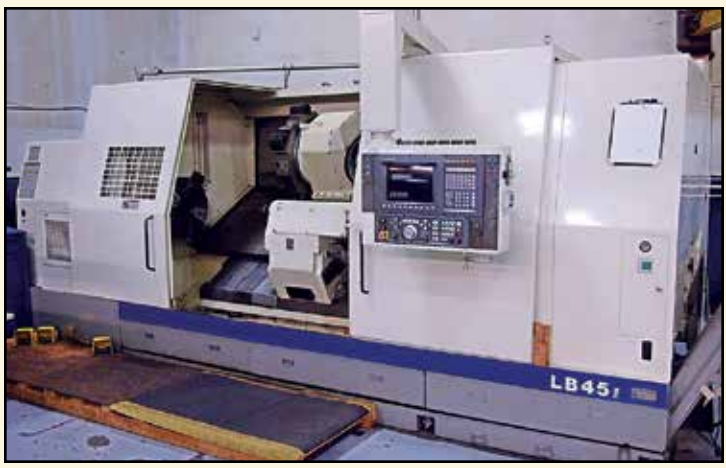
OKUMA LB 45II CNC LATHE