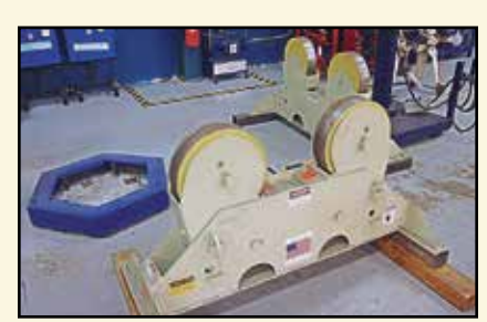
PANDJIRIS TURNING ROLL