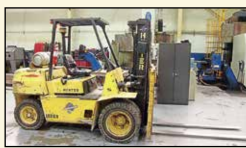
HYSTER H80XL FORKLIFT