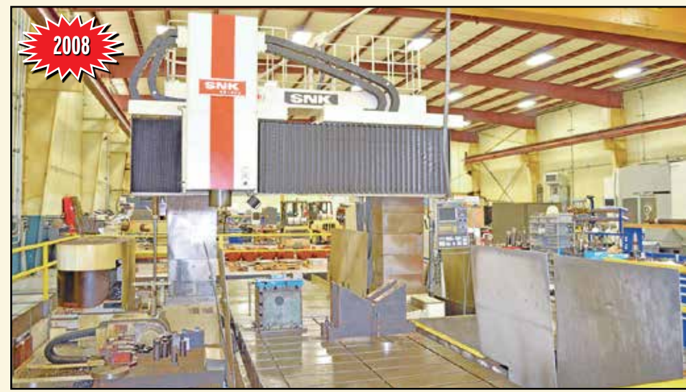
SNK RB4-VM CNC VERTICAL MACHINING CENTER