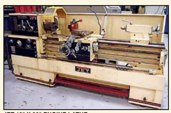
JET 16" X 60" ENGINE LATHE