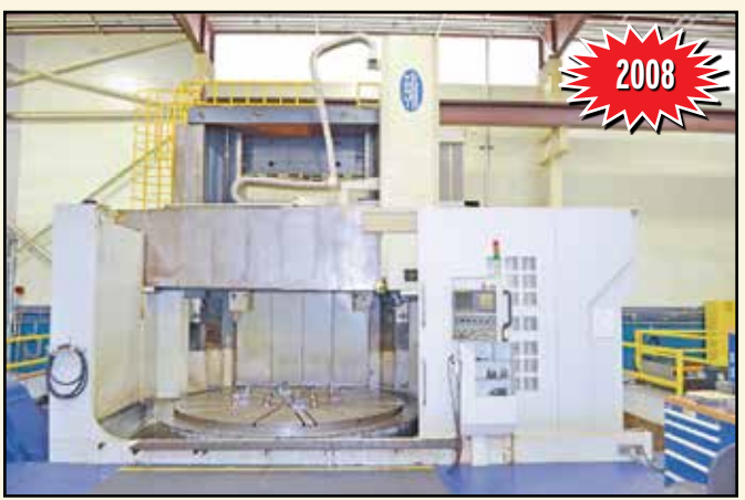
YOU JI YV-3000ATC+C VERTICAL BORING MILL