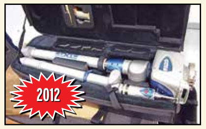
FARO LG-10 COORDINATE MEASURING MACHINE

8420 N. Sam Houston Parkway West Houston, Texas 77064