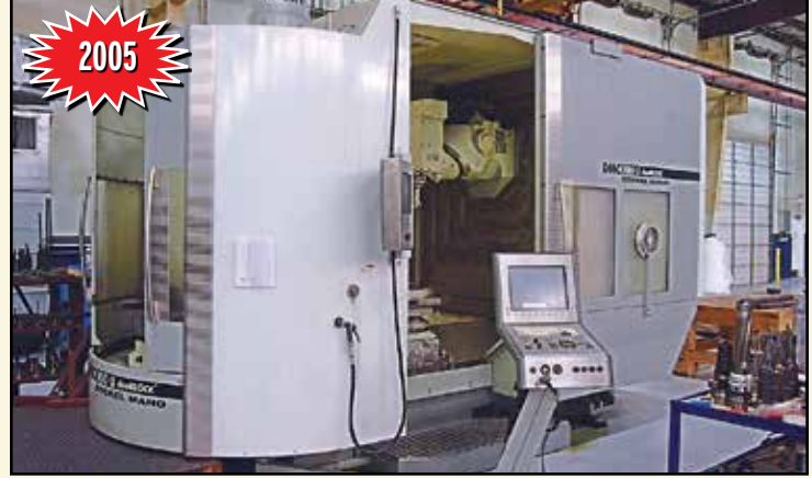
DMG DMC-100U CNC MACHINING CENTER