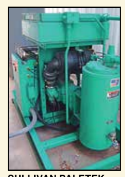
SULLIVAN PALETEK 50 HP AIR COMPRESSOR