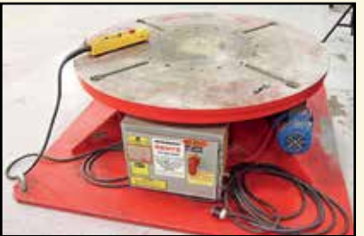
KOIKE ARONSON WELDING TABLE