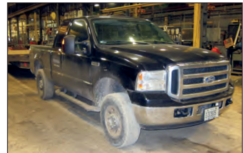
Ford Extended Cab 4x4 Pickup Truck, F250 Super Duty