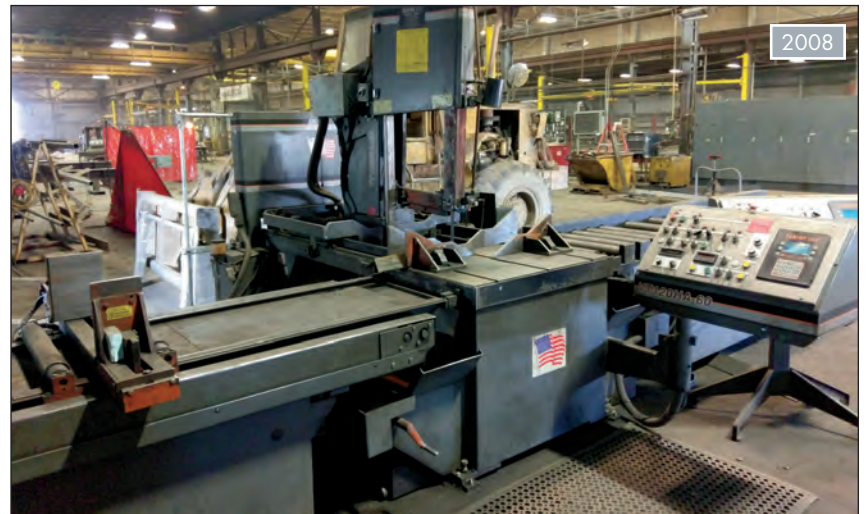
HEM VT120HA-60 Vertical Band Saw w/ 50' Infeed Conveyor