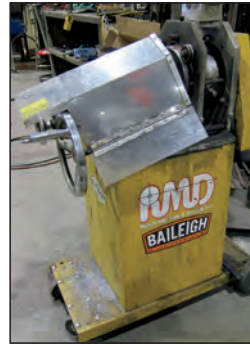
RMD Chamfer Machine