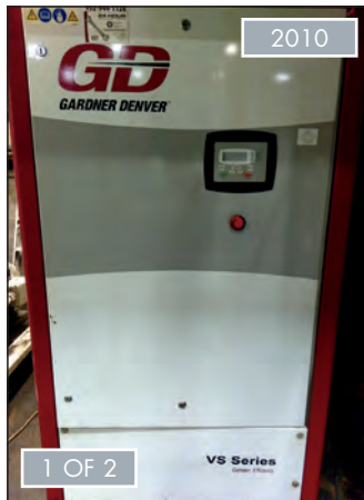
Gardner Denver 100 HP Air Compressors