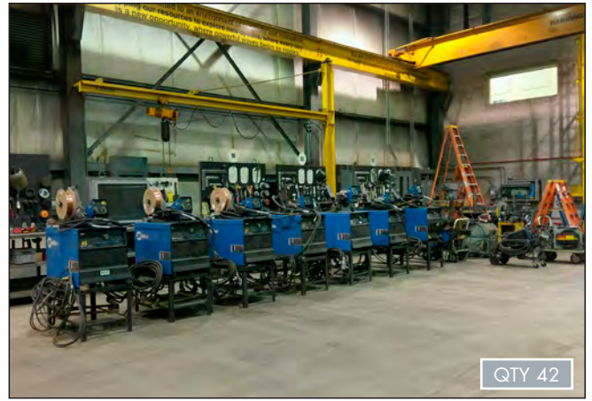
Miller Deltaweld 452 Mig Welders/ Wire Feeder