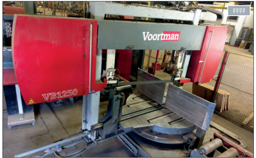
Voortman V630-1250 CNC Beam Saw/Drilling Line, 50" Cap worker, Saw