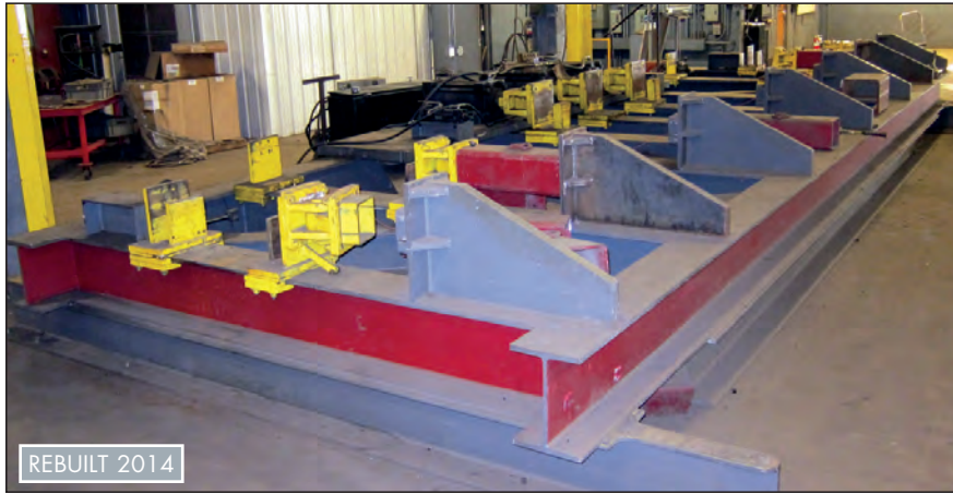
Beam Cambering Table W44 Max Beam Capacity