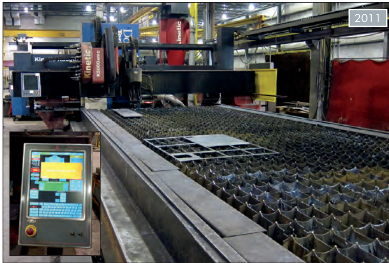
Kinetic K5000 Combination Drilling & Cutting Machine, 10' x 42'