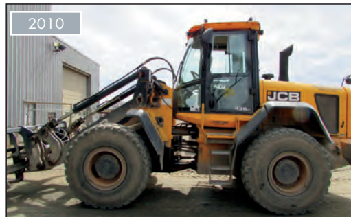
JCB Articulated Wheel Loader, Model 436 EHT