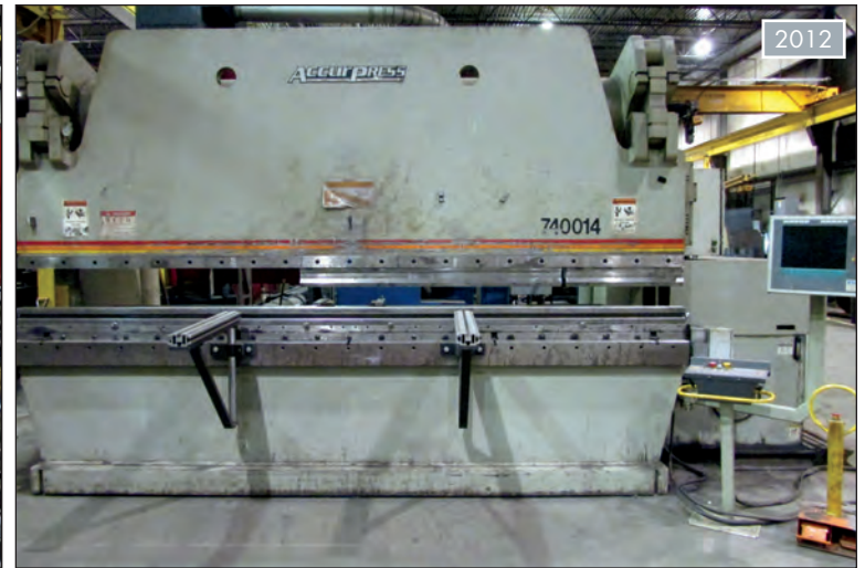
Accurpress 400 Ton x 14', ETS 3000 3-Axis & CNC Crowning