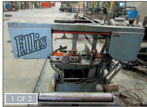
Ellis Horizontal Band Saw