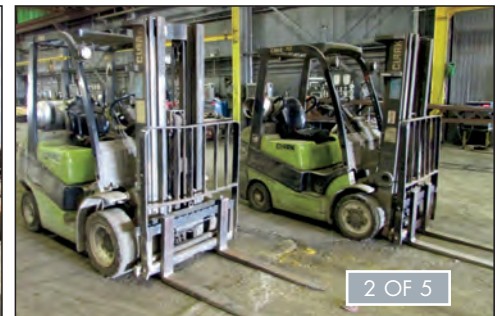
Clark LP Forklift Trucks, 5000lb Cap