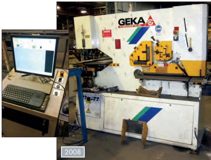
GEKA Hydracrop 110SD Hydraulic CNC Ironworker