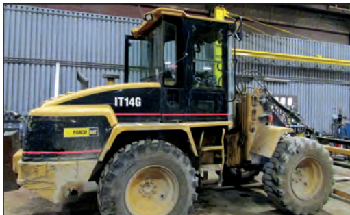
Caterpillar Integrated Tool Carrier/Wheel Loader, Model IT14-G