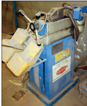
Ercolina Tube/Pipe Bender