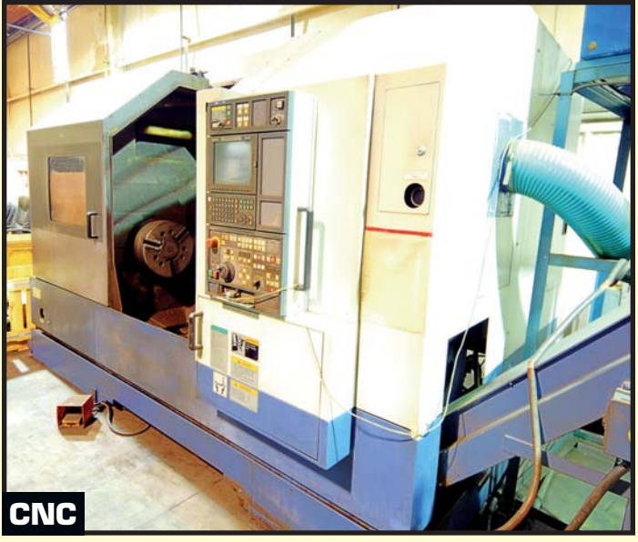
MORI SEIKI SL-403B/800 CNC LATHE