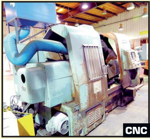
MORI SEIKI SL-5 CNC LATHE