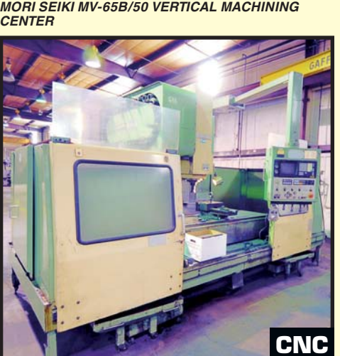
MORI SEIKI MV-65 VERTICAL MACHINING CENTER