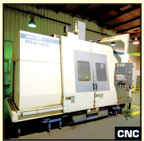
MORI SEIKI MV-65B/50 VERTICAL MACHINING