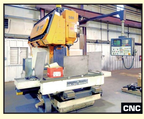
LEBLOND MAKINO VERTICAL MACHINING CENTER