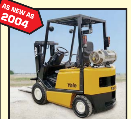
YALE 3.000-LB, CAP, MDL, GLP030