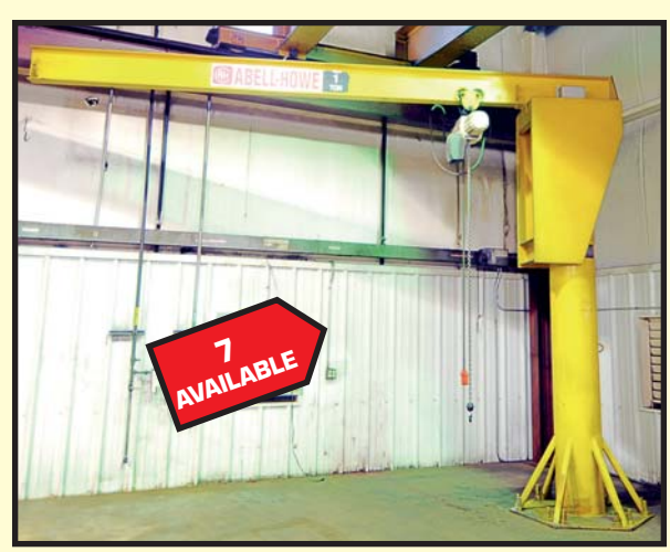
ABELL-HOWE 1 T. FREE STANDING PEDESTAL JIB CRANE