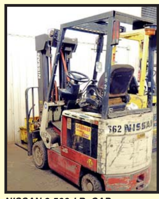
NISSAN 2,500-LB. CAP. ELECTRIC FORKLIFT