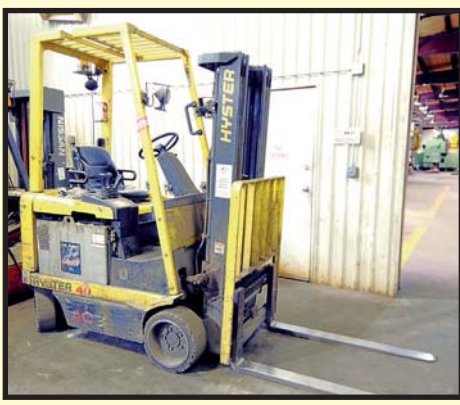
HYSTER 4,000-LB. CAP. ELECTRIC FORKLIFT