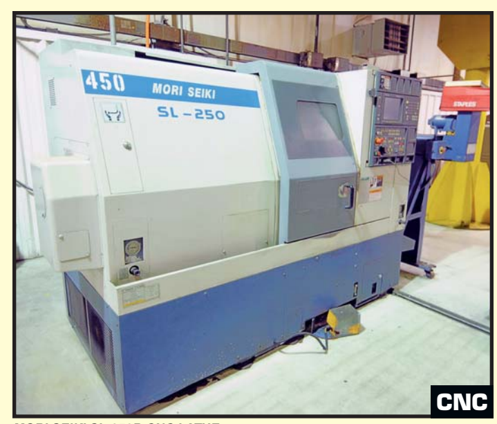
MORI SEIKI SL-250B CNC LATHE