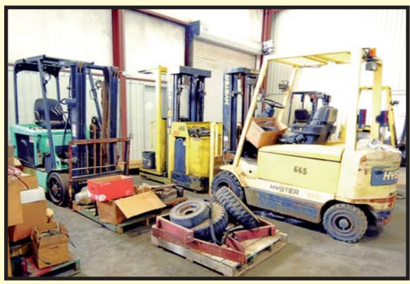
PARTIAL VIEW OF ELECTRIC FORKLIFTS AND PARTS

HYSTER 3,000-LB. CAP. ELECTRIC MDL. R30F.