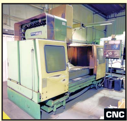
MORI SEIKI MV-55/50 VERTICAL MACHINING CENTER