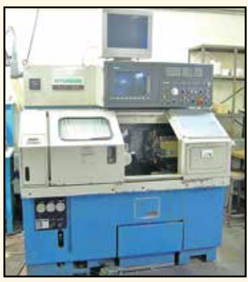
Hyundai Hit 8S CNC Lathe