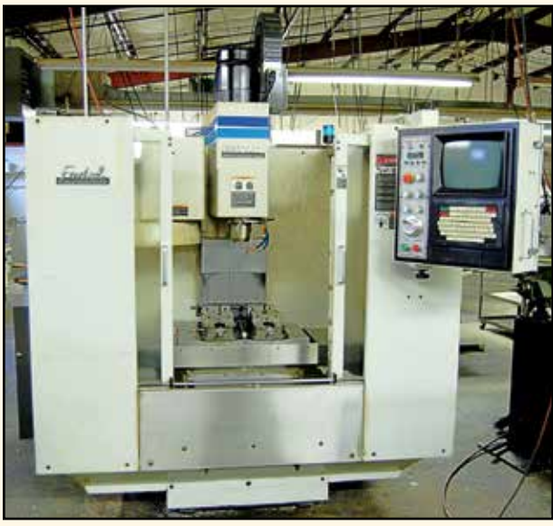
Fadal VMC 2016L Vertical Machining Center

Visit Our Website For Full Terms & Conditions, Additional Information at www.kosterindustries.com