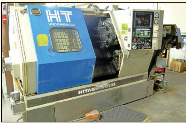
Mori-Seiki "Hitec Turn 25S" CNC Lathe

Featuring: (7) Hurco & Fadal Vertical Machining Centers • CNC Knee-Type Mills • CNC Lathes • Bridgeport Mills • Toolroom Lathes • Grinders • Inspection Items • Shop & Crib Items