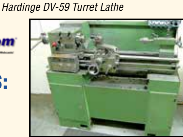
11" x 28" Emco "Maximat Super II" Lathe

ONLINE BIDDING ENDS: Wednesday January 13th, 2016 at 2:00 p.m.