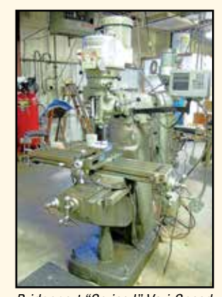
Bridgeport "Series I" Vari-Speed Vertical Mill

Bridgeport 1-1/2HP Vari-Speed Vertical Mill, 9" x 48" power feed table, 60-4,200 RPM, R8 spindle, Acu-Rite II digital readout, S/N: 12BR-56049; S/N: 12BR-113868