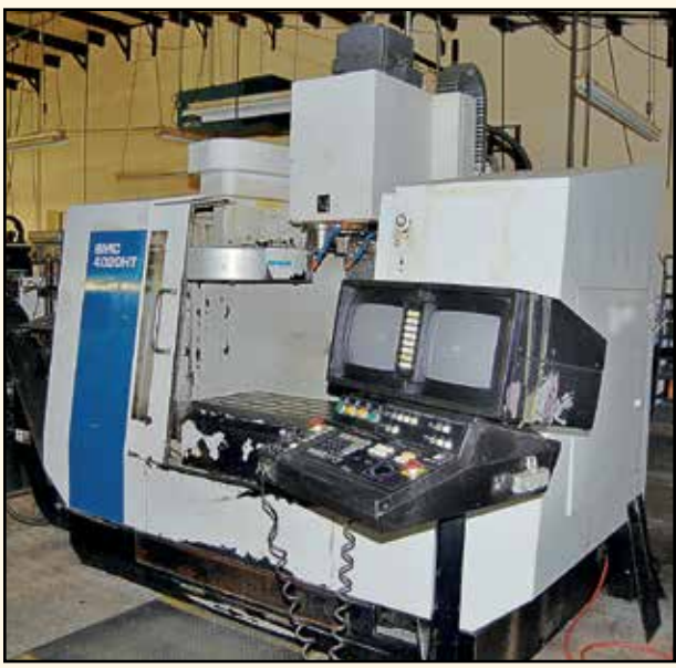
(1 of 2) Hurco BMC-4020 HT/M Vertical Machining Center