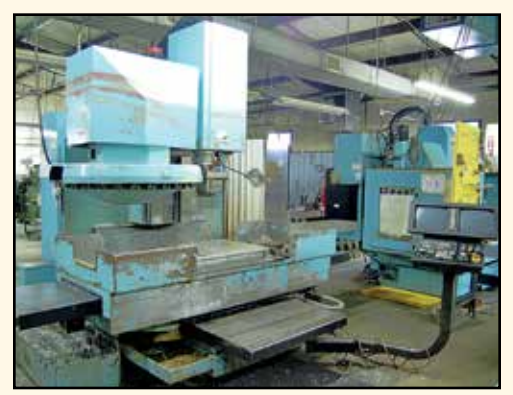
(1 of 2) Hurco BMC-40 Vertical Machining Centers