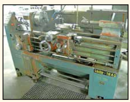
16" x 40" Victor "1640" Gap Bed Lathe