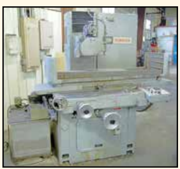
12" x 20" Blohm "Simplex 5" Hydraulic Surface Grinder