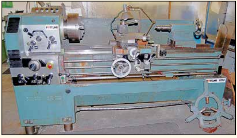
20" x 60" Fortune Mdl. S2060 Gap Bed Lathe