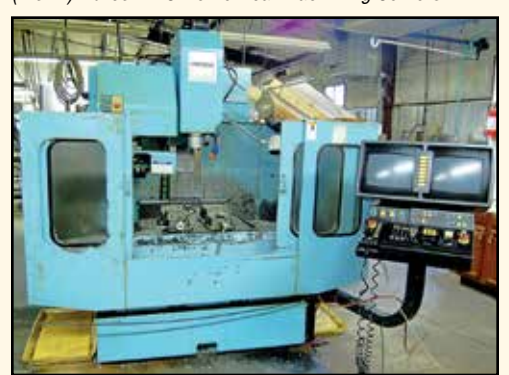
(1 of 2) Hurco BMC-20 Vertical Machining Centers