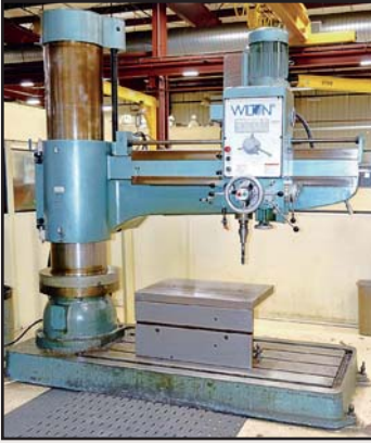
Wilton 5216001 Radial Arm Drill