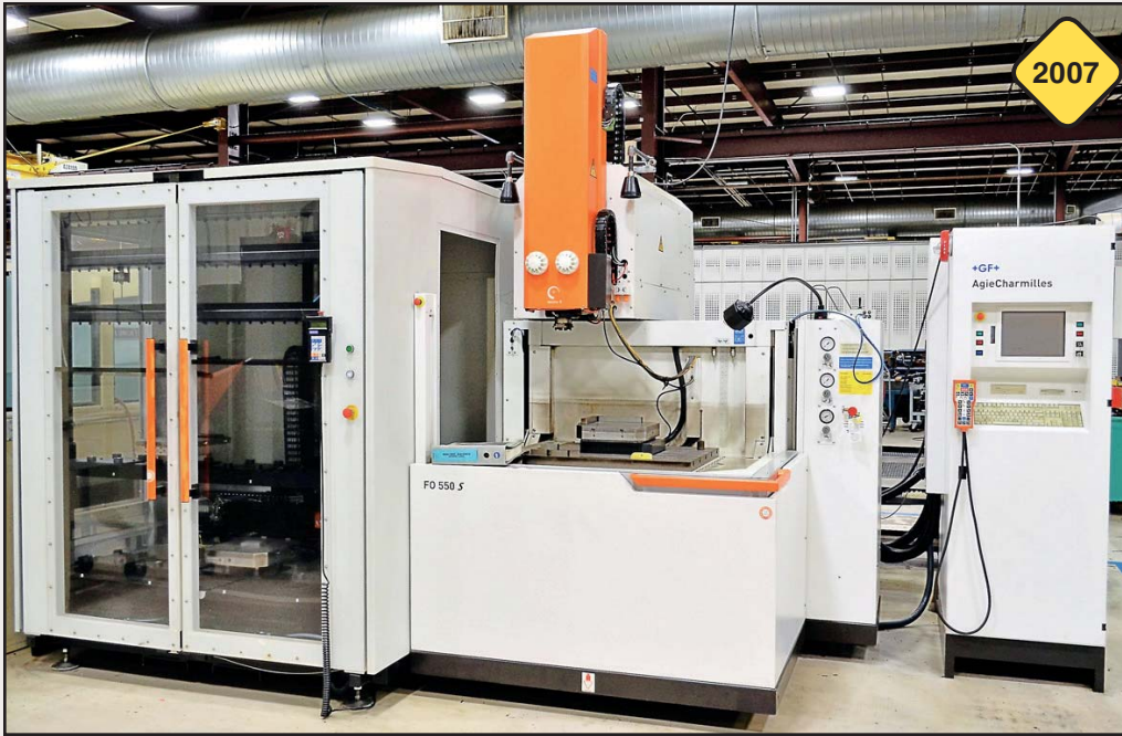
Charmilles Type FO-550-S CNC EDM