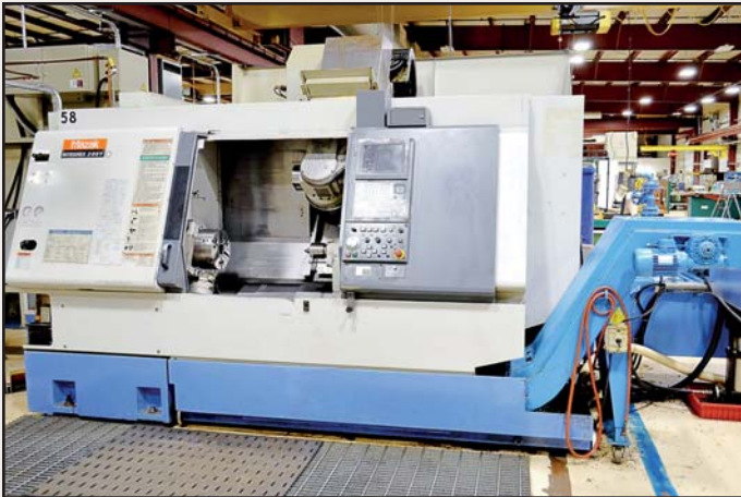
Mazak Integrex 200Y CNC Lathe