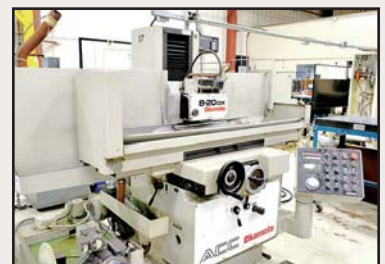
8" x 20" Okamoto 8.20DX Type ACC8-20DX Programmable Surface Grinder