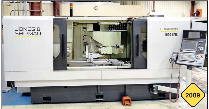
Jones & Shipman 1000 CNC Ultragrind ID/OD Grinder