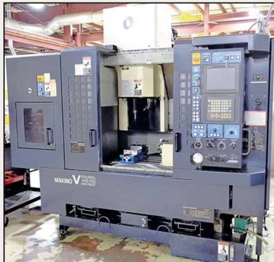
Makino V33 CNC Vertical Machining Center