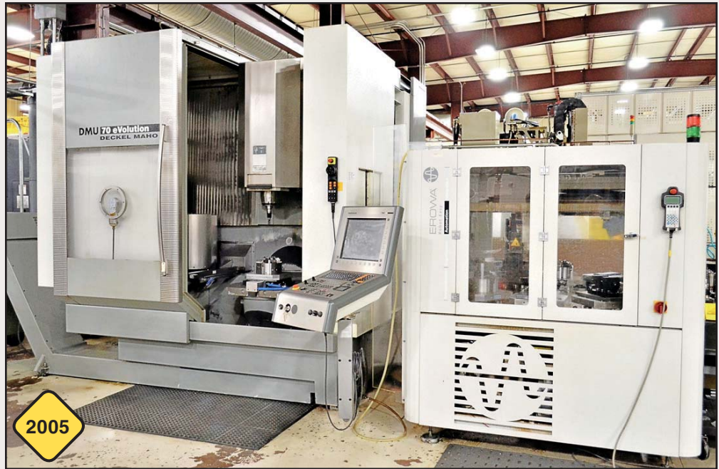
Deckel Maho DMG DMU-70 eVolution CNC Vertical Machining Center, with Erowa Pallet Changer

AUCTION DATE: Tuesday, May 23rd, 2017 at 10:00 a.m. EDT