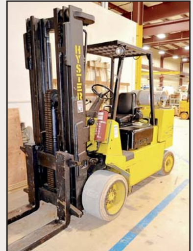
11,750-Lb. Hyster S120XL2S Propane Forklift Truck