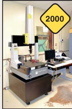
2000 Brown & Sharpe MicroXcel PFX4-5-4 Coordinate Measuring Machine