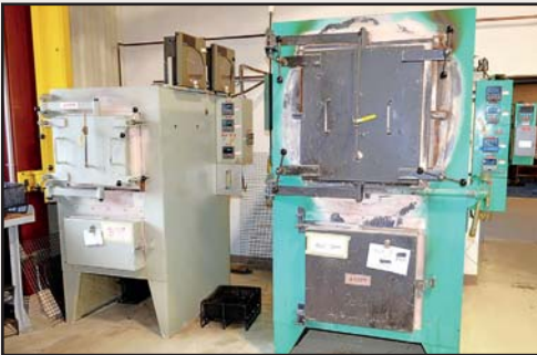
View of Lucifer Furnaces