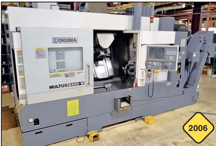
Okuma Multus B300-W Multi-Axis CNC Lathe