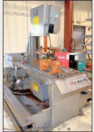
18" Hem V-100LM-2 Vertical Bandsaw

To Register For This Auction, Please Visit www.kosterindustries.com