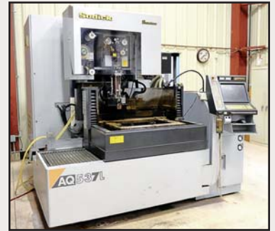
Sodick "Premium" AQ537L CNC Wire EDM