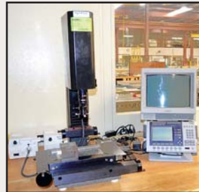
Optiflex Video System