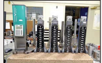
View of Height Gages