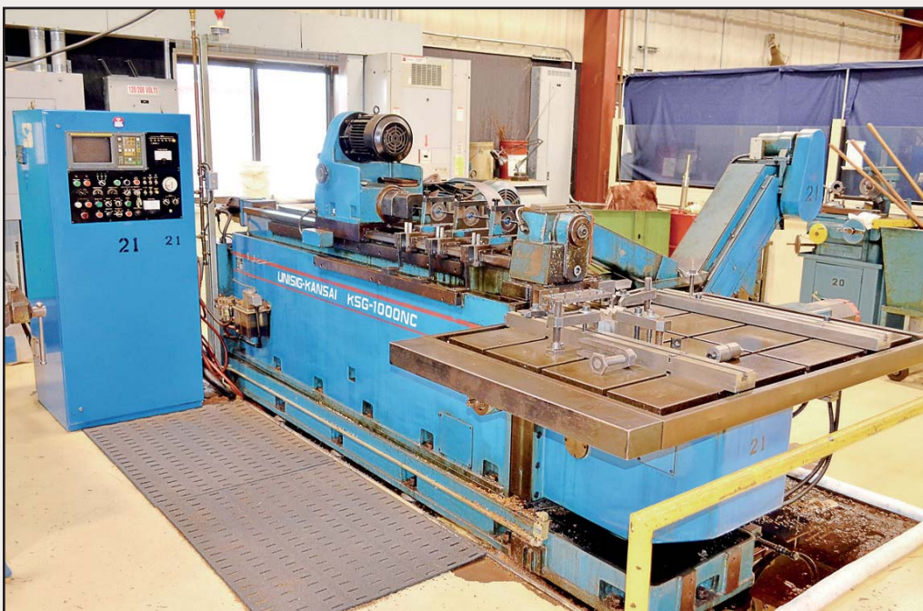
Unisig-Kansai KSG 1000NC CNC Gun Drill

Unisig-Kansai KSG-1000NC CNC Knee-Type Gun Drill , with Fanuc 0M CNC control, 1" hole dia. x 40" stroke, 59" x 39" table, 28" X-axis table travel, 11.8" Y-axis vertical travel, 6,000 max. RPM, S/N 4244