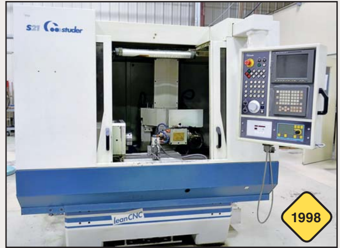
Studer S21 Lean CNC ID/OD Grinder