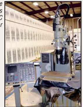
Moore G18 Series 1000 CNC Jig Grinder