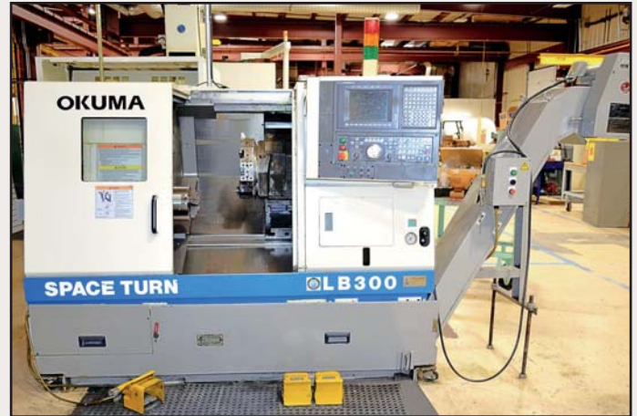
Okuma LB300 Space Turn CNC Lathe