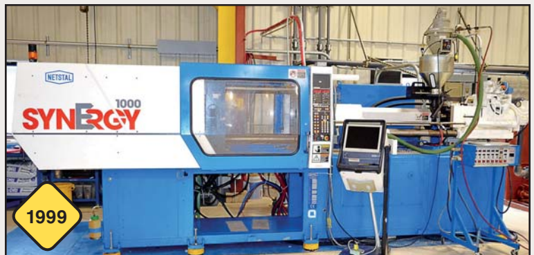
100-Ton Netstal 1000 Synergy Type S-1000-460 CNC Plastic Injection Molder