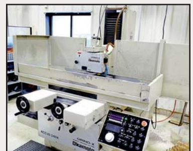
20" x 24" Okamoto ACC20-24DX Grind-X Programmable Surface Grinder