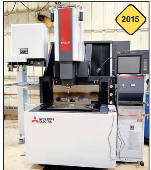
Mitsubishi EA12V CNC Ram Type EDM

Can't attend this auction? Bid online at BidSpotter.com