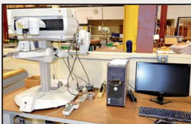
Gravograph 1S400 Programmable Engraver