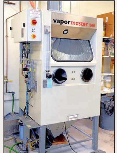
Vapor Master 1010 Reach-In Sand Blast Cabinet