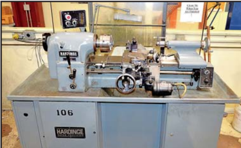
Hardinge HLV-H/TFB Precision Toolroom Turning, Facing and Boring Lathe

Westhoff High-Speed Bench Drill , with 8-1/2" x 8-1/2" working surface table, S/N: 77-683