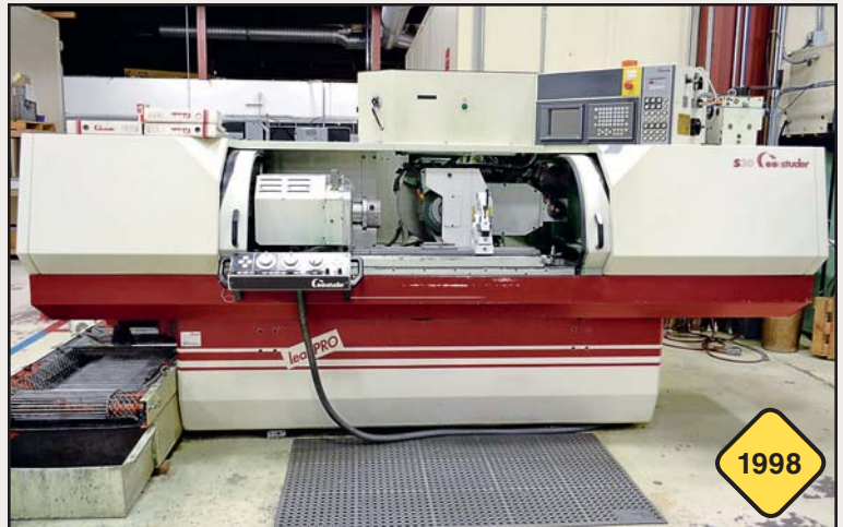
Studer S30 Lean Pro CNC ID/OD Grinder