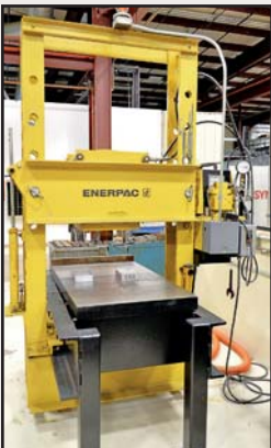
Enerpac H-Frame Hydraulic Straightening Press