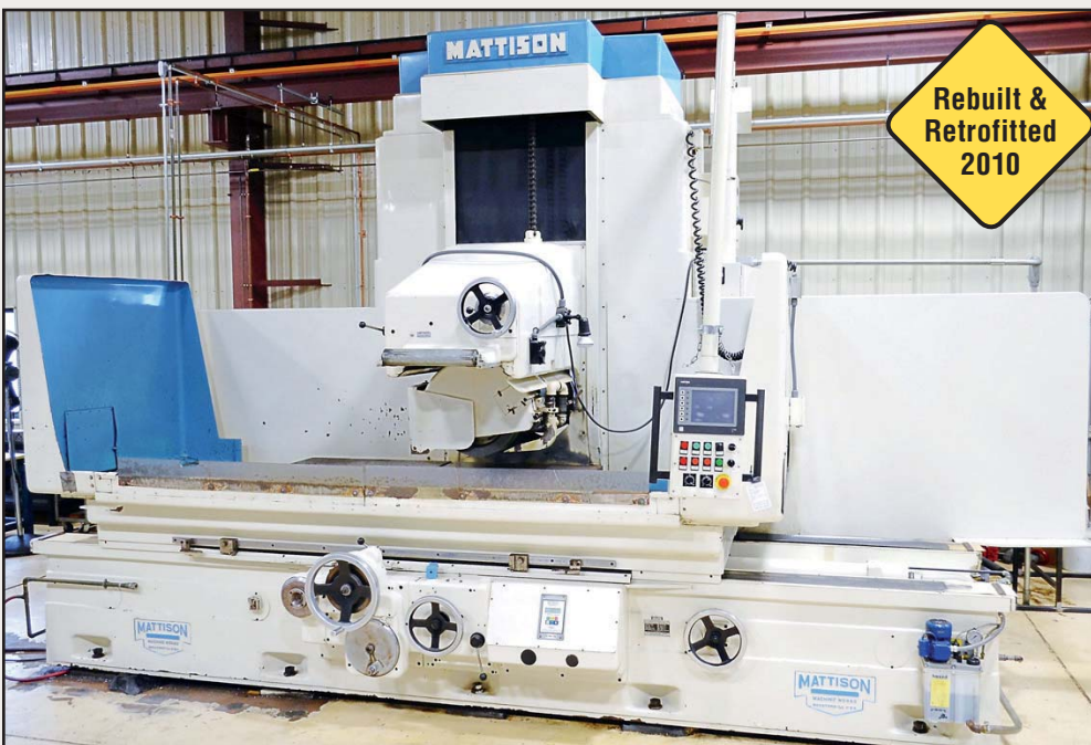
42" x 80" Mattison Programmable Surface Grinder

BidSpotter.com Live Interactive Webcast Auctions