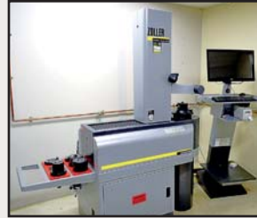
Zoller Venturion 600 Tool Pre-Setter

6,000-Lb. Raymond 111TM-F80L Walk-Along Type Hydraulic Pallet Truck , battery operated, S/N: 111-94-11787