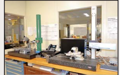
View of Height Gages