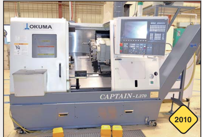
Okuma Captain L370 CNC Lathe

Okuma Captain L370 CNC Lathe , with OSP-P200L CNC controls, 16.54" swing, 14.56" max. turning dia., 20.47" max. turning length, 10" 3-jaw chuck, hydraulic tailstock, 12-position turret, 4,500 max. RPM spindle speeds, 20HP motor, parts catcher, Hennig chip conveyor, S/N: 526295 (2010); with Type RF-5469 high pressure coolant pump, Absolent ODF1000C Dust Collector (2010)