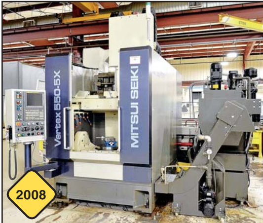
Mitsui Seiki Vertex 550-5X 5-Axis CNC Vertical Machining Center