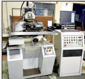
Tru-Tech Systems Centerless Grinder