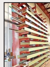
View of Raw Material