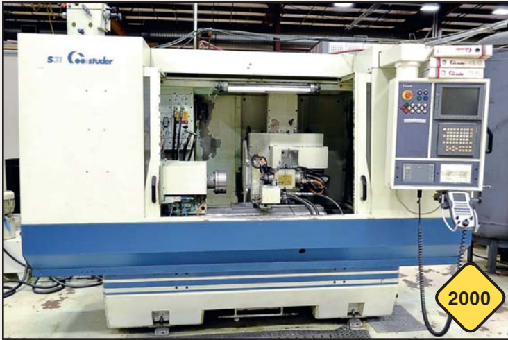
Studer S31 CNC ID/OD Grinder