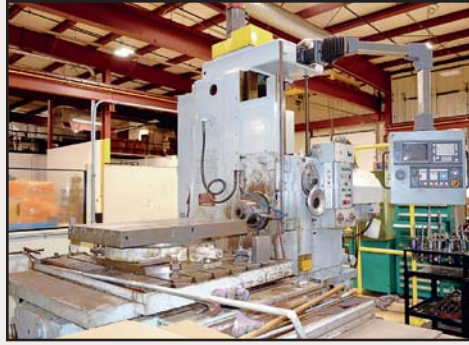
DeVlieg 43K-48 CNC Jig Mill

Approximately 20-Ton Capacity Enerpac Garage Type Hydraulic Press, with 27" between uprights