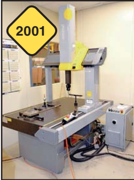
2001 Brown & Sharpe Mistral 07-10-05 Coordinate Measuring Machine