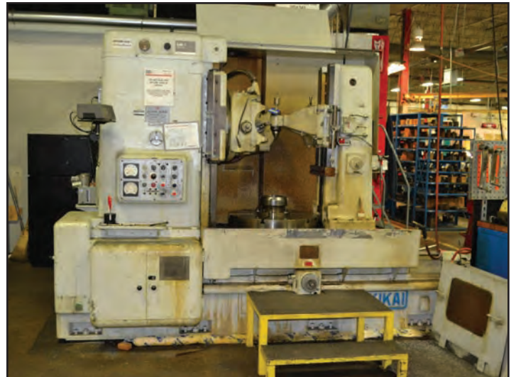
NIHON KIKAI NDH-1200 UNIVERSAL GEAR HOBBER