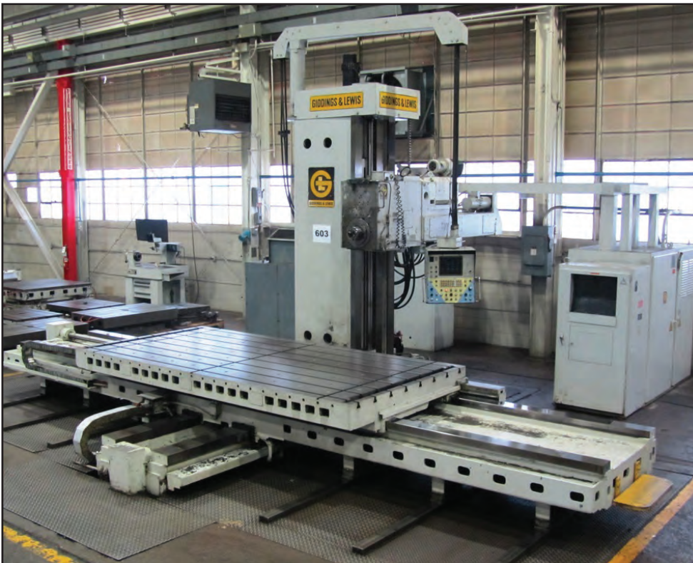
GIDDINGS & LEWIS G60T 6" CNC TABLE TYPE HORIZONTAL BORING MILL