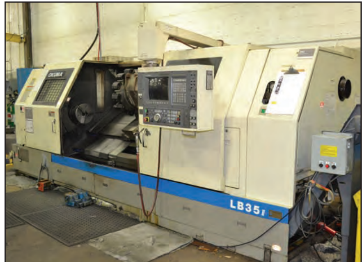
OKUMA LB-35II 1SC-2000 CNC TURNING CENTER