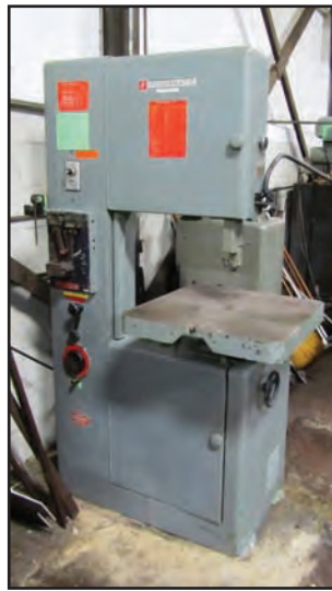
POWERMATIC 20" VERTICAL BANDSAW