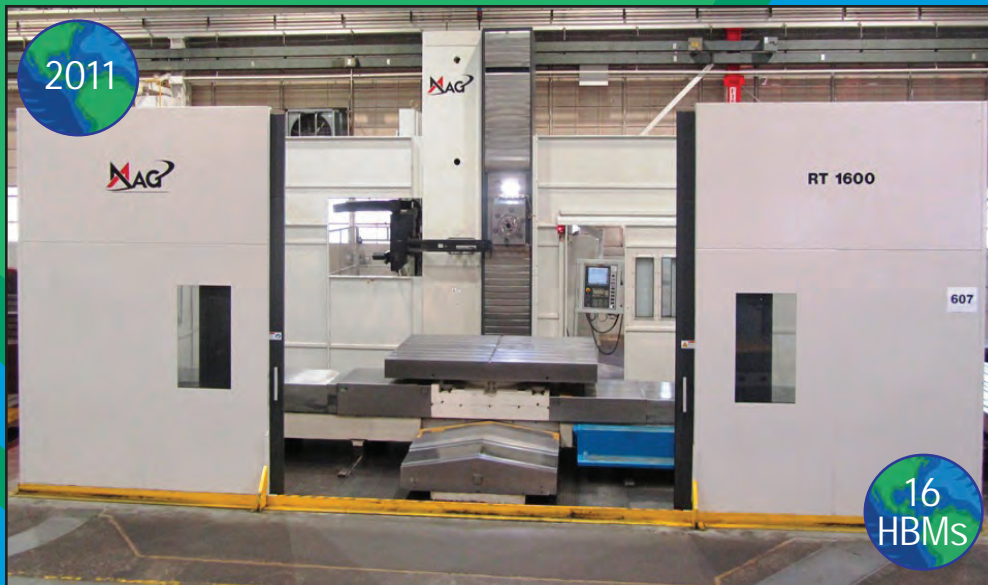
GIDDINGS & LEWIS RT 1600 6.1" CNC TABLE TYPE HORIZONTAL BORING MILL

HUGE OFFERING OF LATE MODEL LARGE CAPACITY CNC HORIZONTAL BORING MILLS, MACHINING CENTERS, TURNING CENTERS, GEAR MACHINERY & TOOLING 5170 W. 130TH STREET BROOK PARK, OH 44142