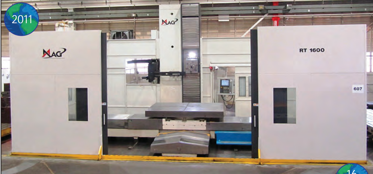
GIDDINGS & LEWIS RT 1600 6.1" CNC TABLE TYPE HORIZONTAL BORING MILL