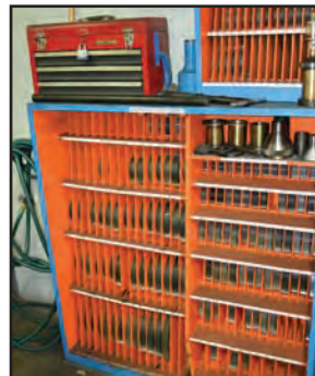
NIHON KIKAI CHANGE GEARS