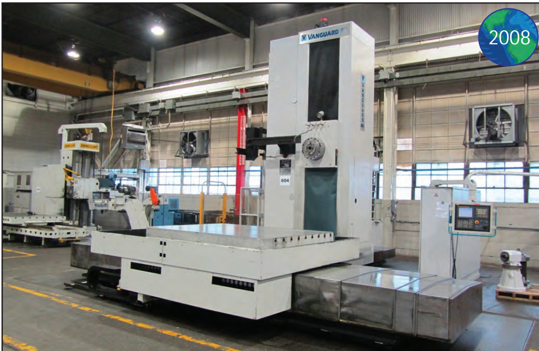
VANGUARD 6.3" CNC TABLE TYPE HORIZONTAL BORING MILL