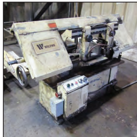
WILTON HORIZONTAL BANDSAW