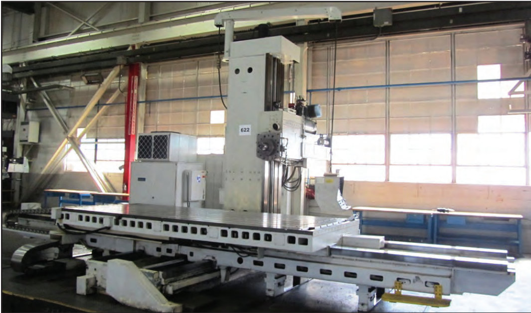
GIDDINGS & LEWIS 70-H6-T 6" CNC TABLE TYPE HORIZONTAL BORING MILL