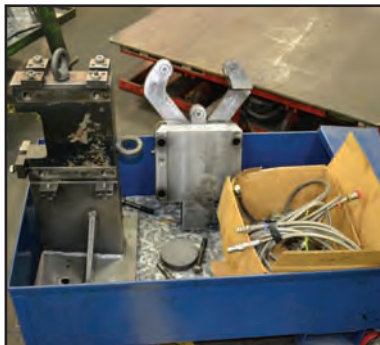
OKUMA STEADY REST