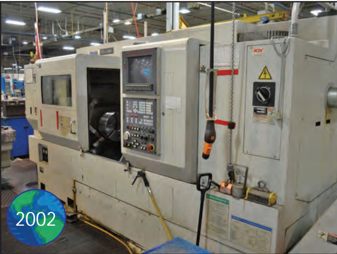
MAZAK QUICK TURN 30M CNC TURNING CENTER WITH MILLING

Want to Sell Your Shop or Know Someone Who Does? Call Us Toll Free at (888) 800-4442! We Pay Great Finder's Fees!