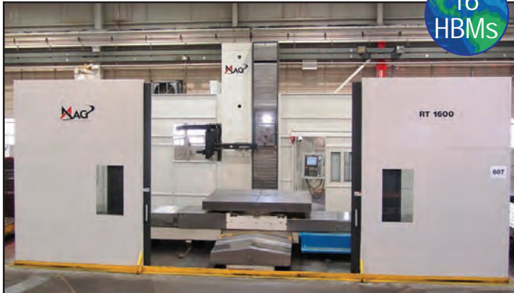
GIDDINGS & LEWIS CNC TABLE TYPE HORIZONTAL BORING MILLS