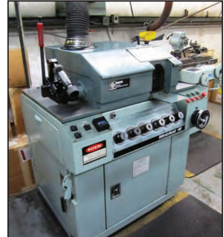
G&L ELECTRONICS DAVIS AMCA INTERNATIONAL WINSLOMATIC HR DRILL GRINDER