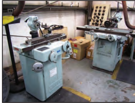
CINCINNATI & K.O. LEE TOOL & CUTTER GRINDERS