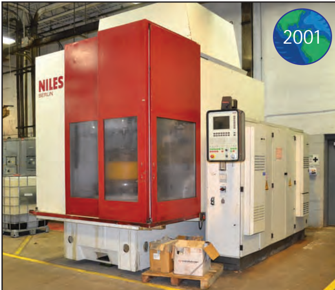
NILES ZP-12 CNC GEAR PROFILE GRINDING MACHINE