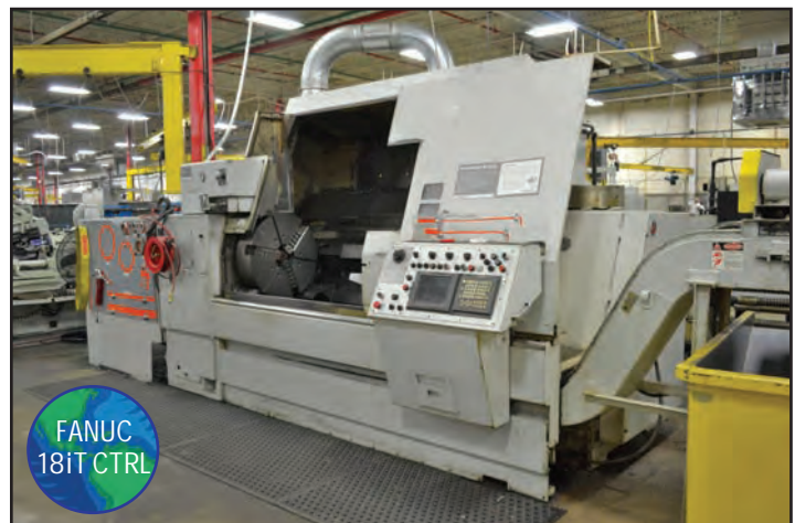
WARNER & SWASEY SC-28 CNC TURNING CENTER