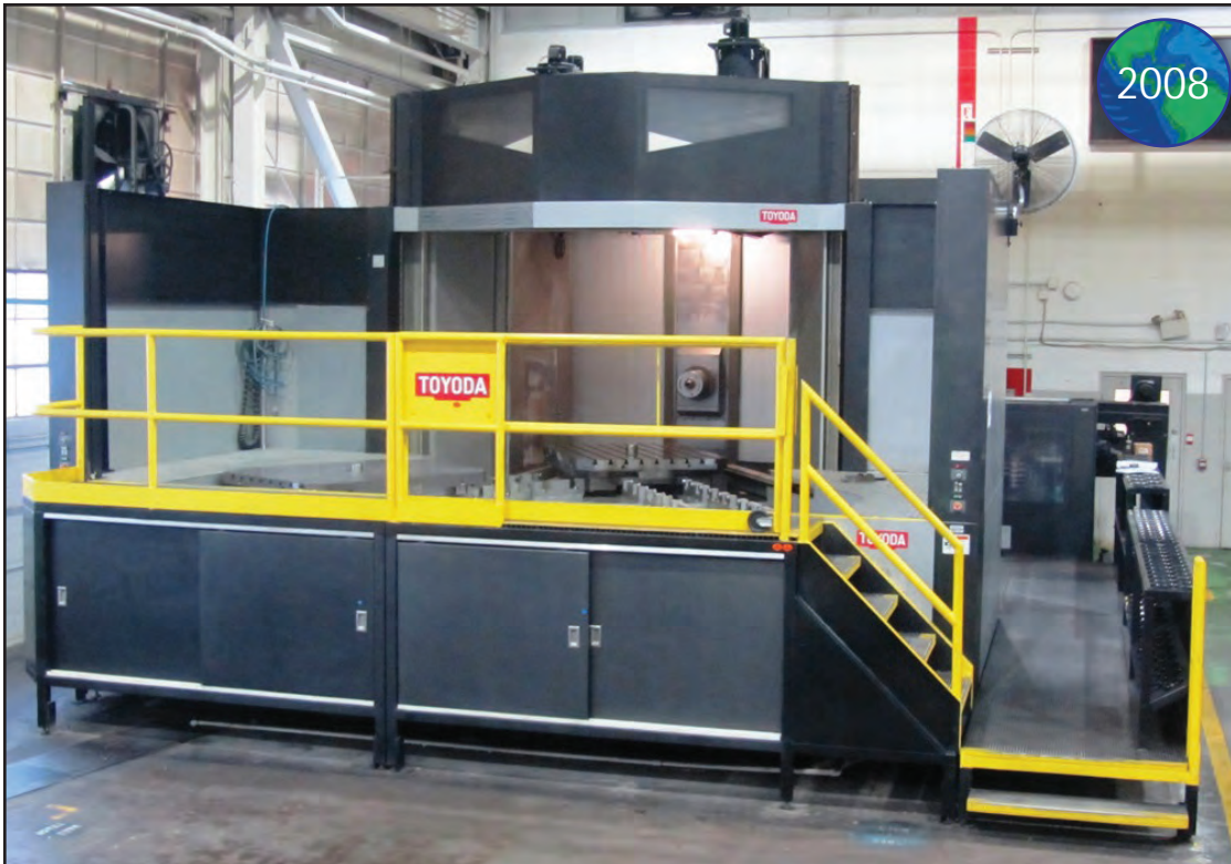
TOYODA FH1250SX CNC HORIZONTAL MACHINING CENTER

2 DAY AUCTION - DAY 1: WEDNESDAY, MAY 11TH @ 9:00 A.M. EDT LARGE MACHINERY DAY 2: THURSDAY, MAY 12TH @ 9:00 A.M. EDT TOOLING