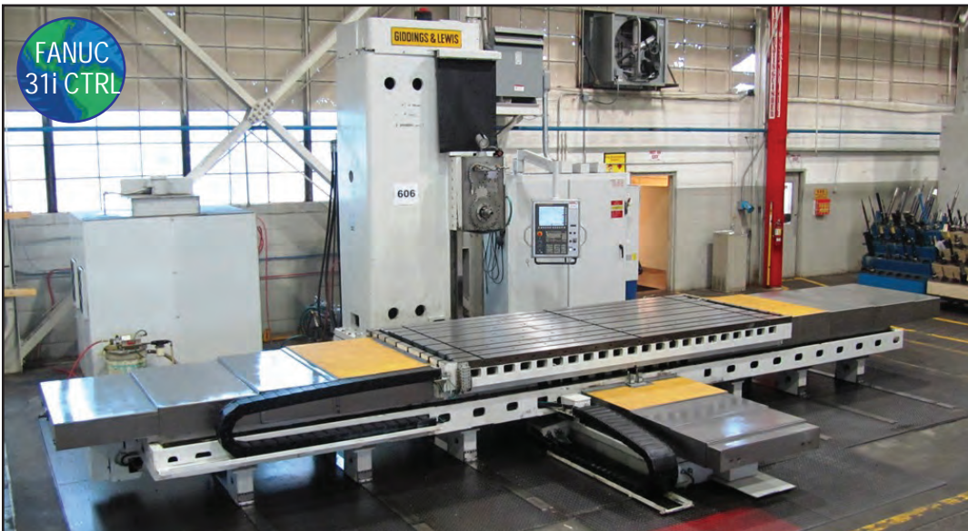
GIDDINGS & LEWIS PC-50 5" CNC TABLE TYPE HORIZONTAL BORING MILL

Large Assortment of GIDDINGS & LEWIS Hydrostatic Index Tables up to 60" x 96", Right Angle Heads, Facing Heads, Spindle Supports, Angle Plates, Tooling Systems, VIDMAR Cabinets, DEVLIEG & PARSET Tool Setters, WINSLOWMATIC & CINCINNATI Tool Grinders, Angle Plates, HENRY Coolant System, Fork Trucks, MAS VR-84A Radial Drill, Welders & More