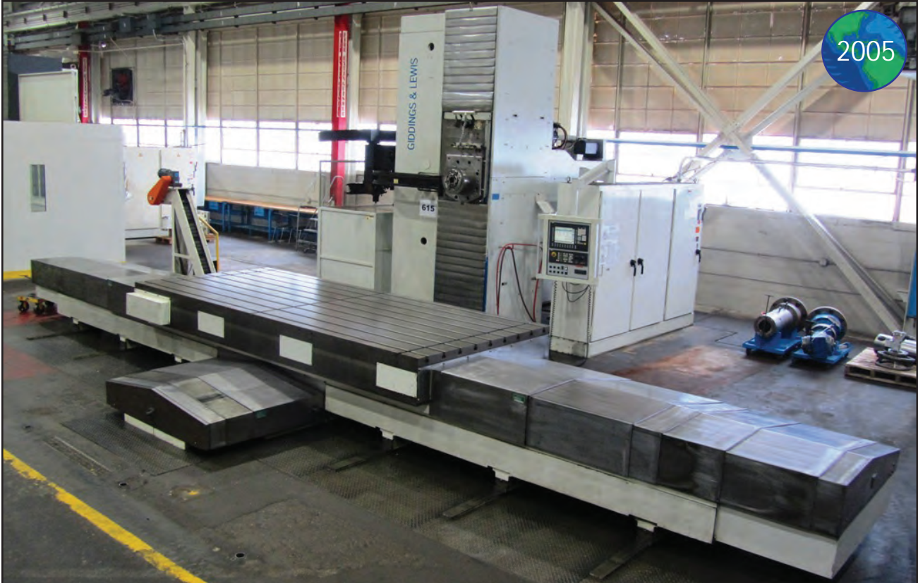
GIDDINGS & LEWIS PT 1800 6.1" CNC TABLE TYPE HORIZONTAL BORING MILL