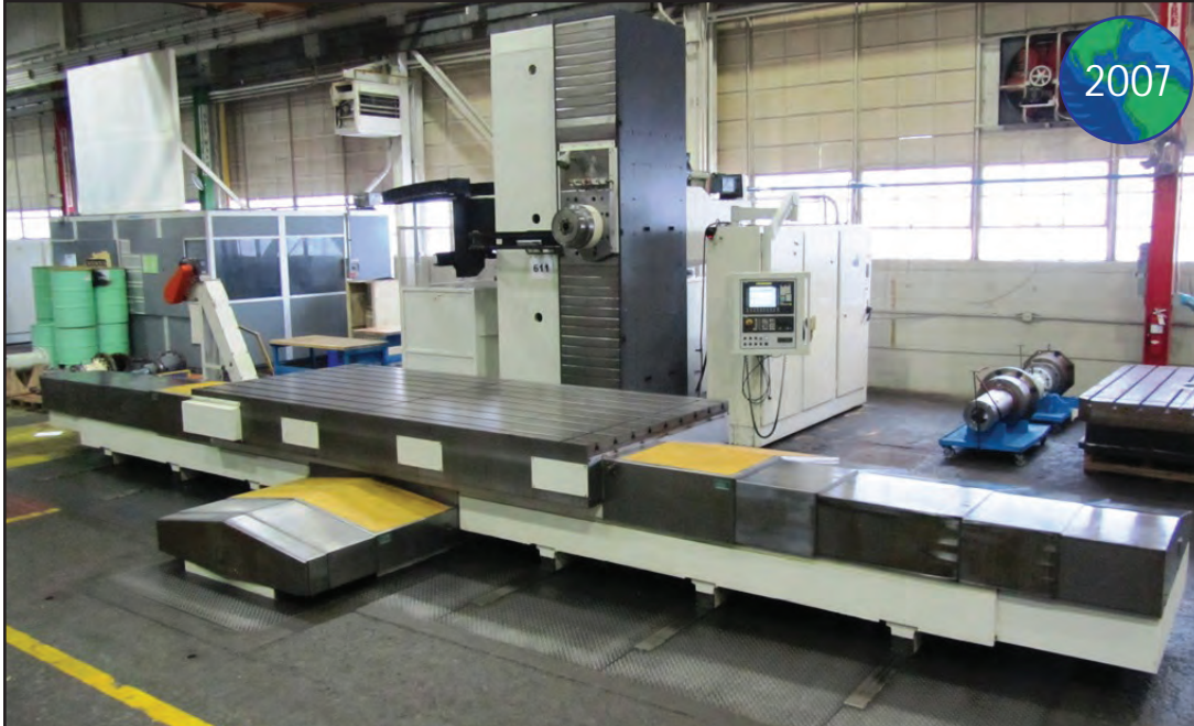
GIDDINGS & LEWIS PT 1800 6.1" CNC TABLE TYPE HORIZONTAL BORING MILL