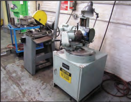
RUSH DRILL GRINDER