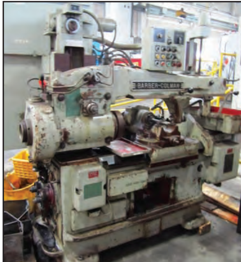
BARBER COLMAN AHM 16-16 MANUAL HOBGING MACHINE