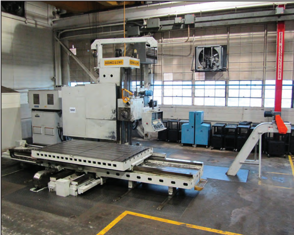
GIDDINGS & LEWIS G60TX 6" CNC TABLE TYPE HORIZONTAL BORING MILL