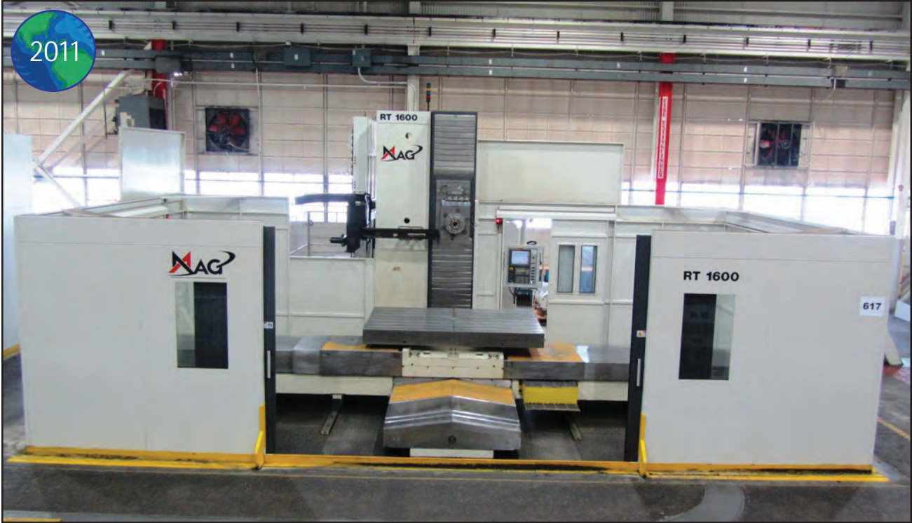
GIDDINGS & LEWIS RT 1600 6.1" CNC TABLE TYPE HORIZONTAL BORING MILL