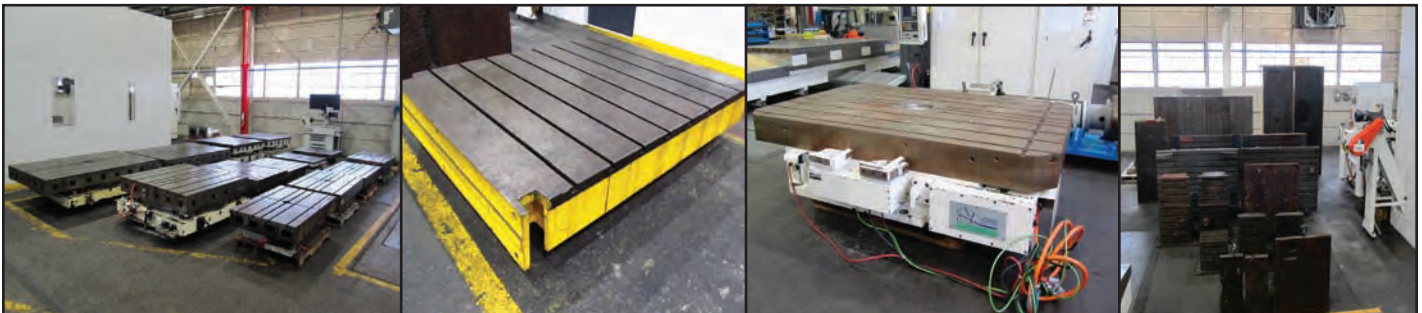
ASSORTED ROTARY TABLES & ANGLE PLATES