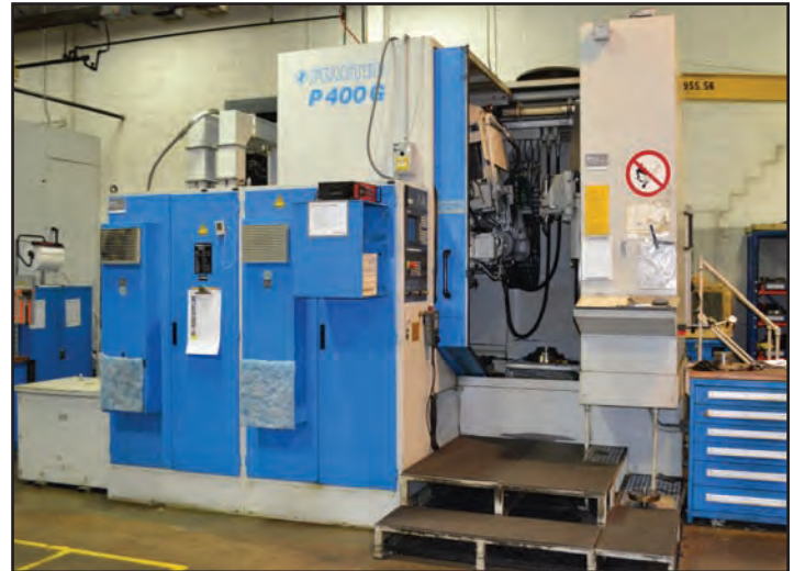
PFAUTER P400G CNC GEAR PROFILE GRINDING MACHINE