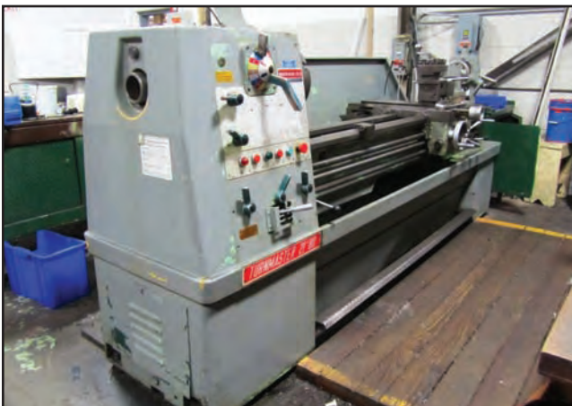
TURNMASTER 21" X 80" GAP BED ENGINE LATHE