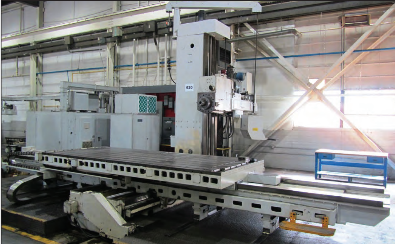
GIDDINGS & LEWIS 70-H6-T 6" CNC TABLE TYPE HORIZONTAL BORING MILL