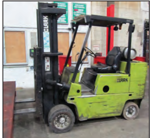
CLARK 9900LB PROPANE FORKLIFT