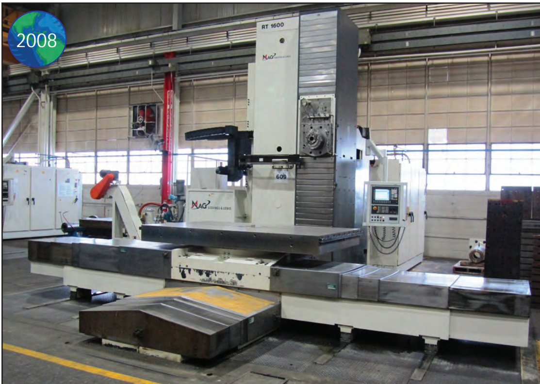
GIDDINGS & LEWIS RT 1600 6.1" CNC TABLE TYPE HORIZONTAL BORING MILL