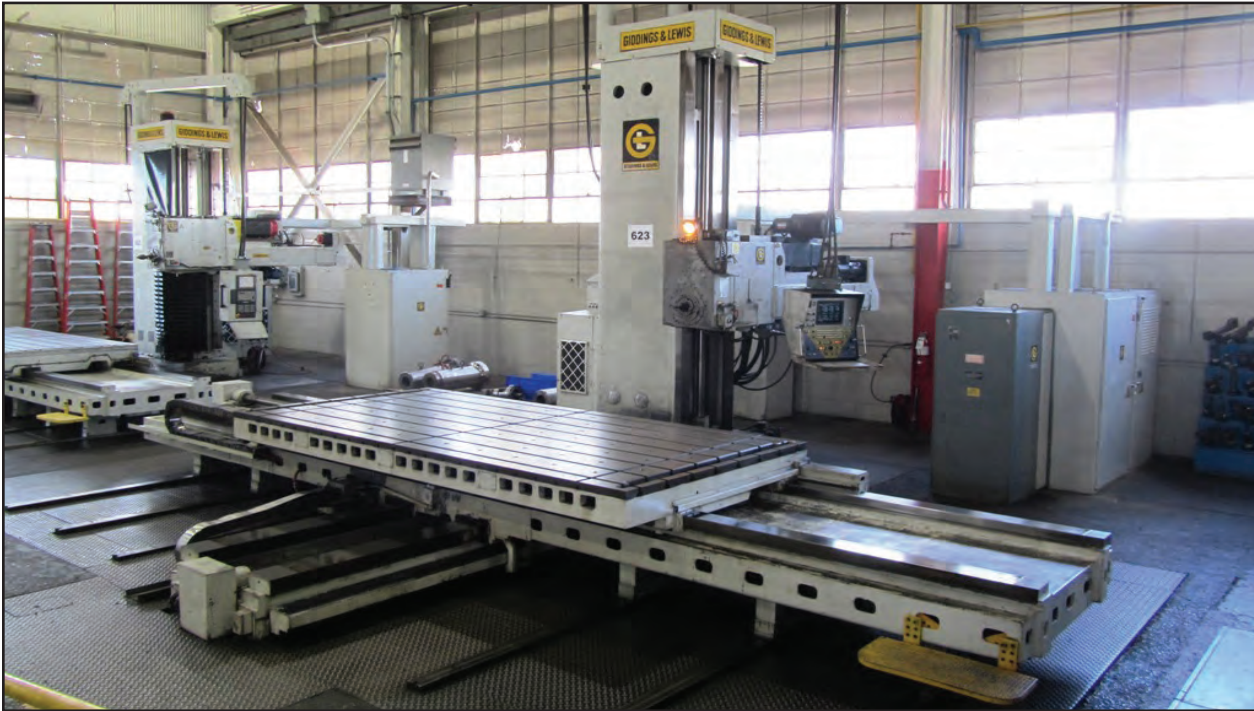
GIDDINGS & LEWIS G60T 6" CNC TABLE TYPE HORIZONTAL BORING MILL