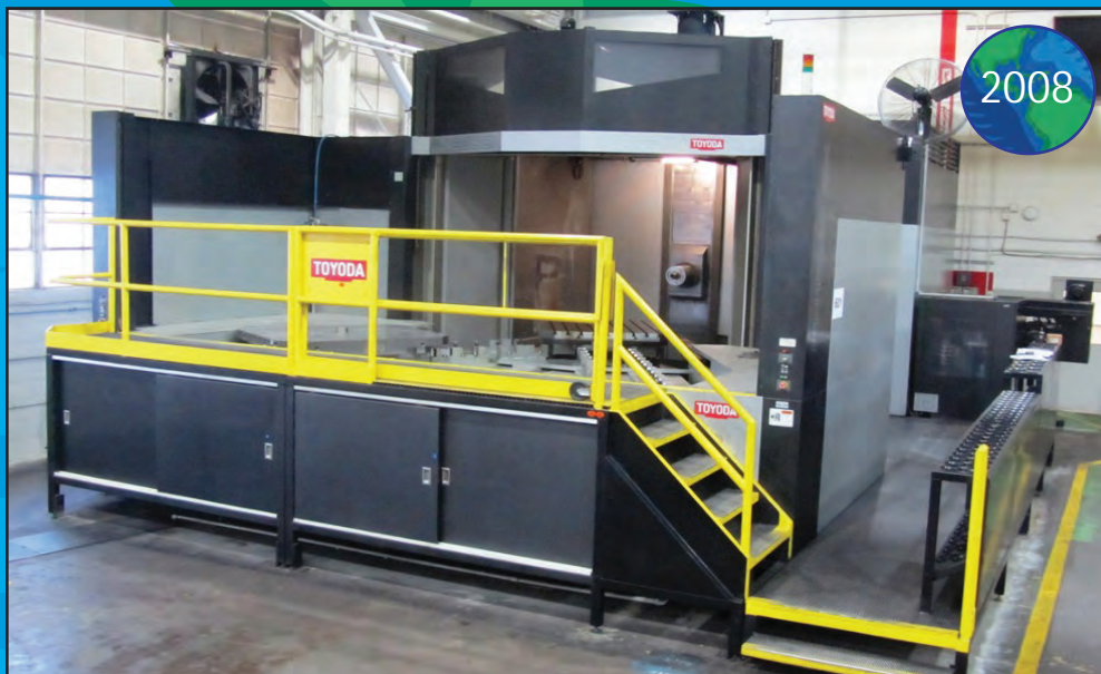
TOYODA FH1250SX CNC HORIZONTAL MACHINING CENTER

HUGE OFFERING OF LATE MODEL LARGE CAPACITY CNC HORIZONTAL BORING MILLS, MACHINING CENTERS, TURNING CENTERS, GEAR MACHINERY & TOOLING 5170 W. 130TH STREET BROOK PARK, OH 44142