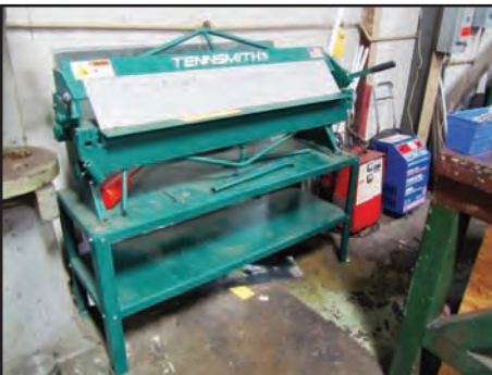
TENNSMITH 4' HAND BRAKE