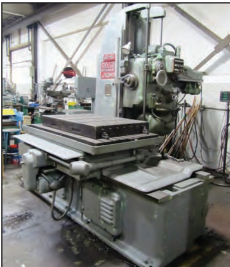
DEVLIEG SPIRAMATIC JIG MILL