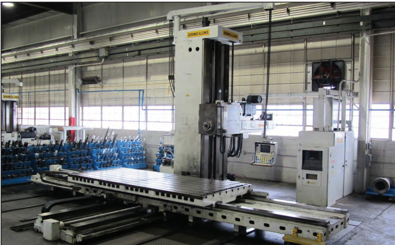
GIDDINGS & LEWIS H70-T 7" CNC TABLE TYPE HORIZONTAL BORING MILL