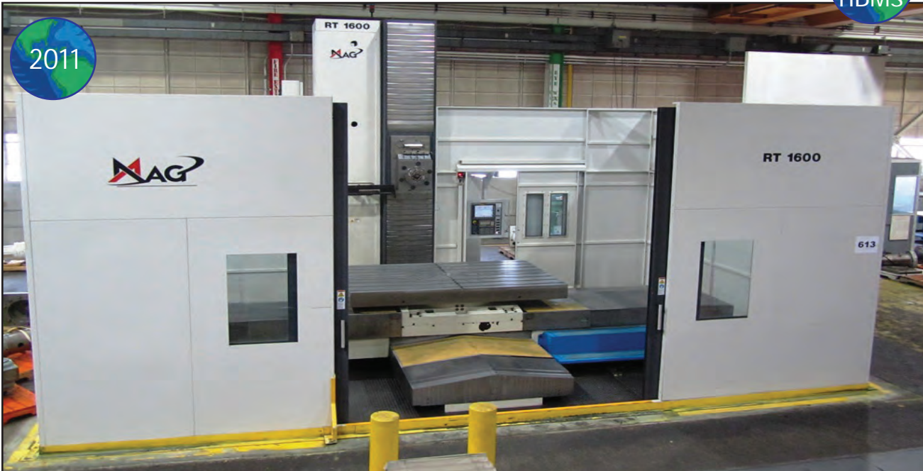
GIDDINGS & LEWIS RT 1600 6.1" CNC TABLE TYPE HORIZONTAL BORING MILL