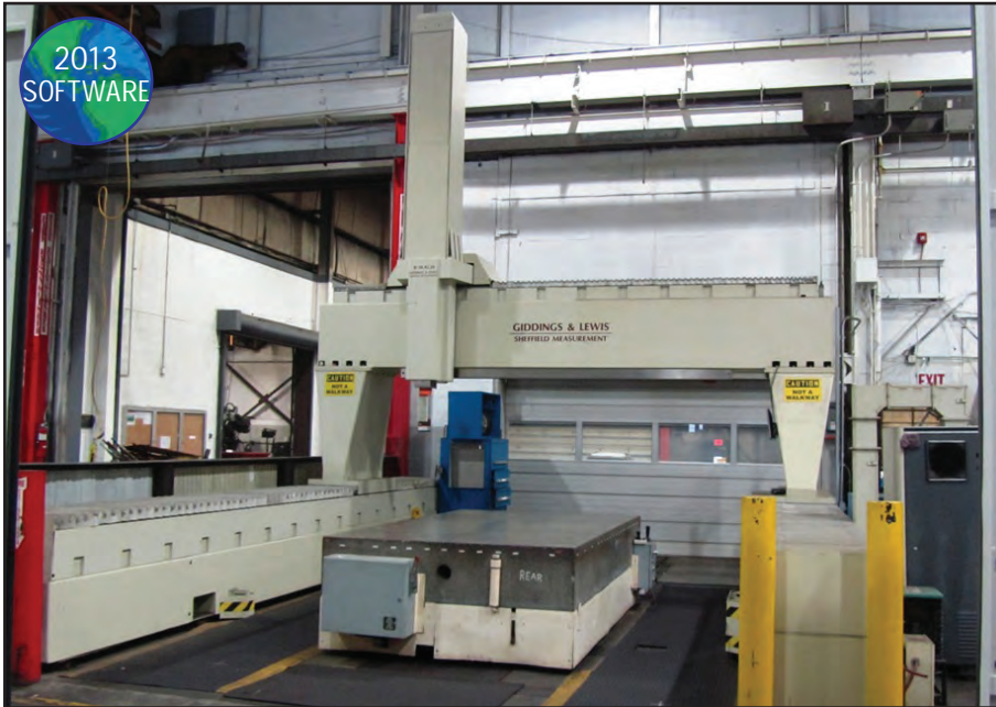
GIDDINGS & LEWIS SHEFFIELD BS.30.45.20 GANTRY STYLE CMM