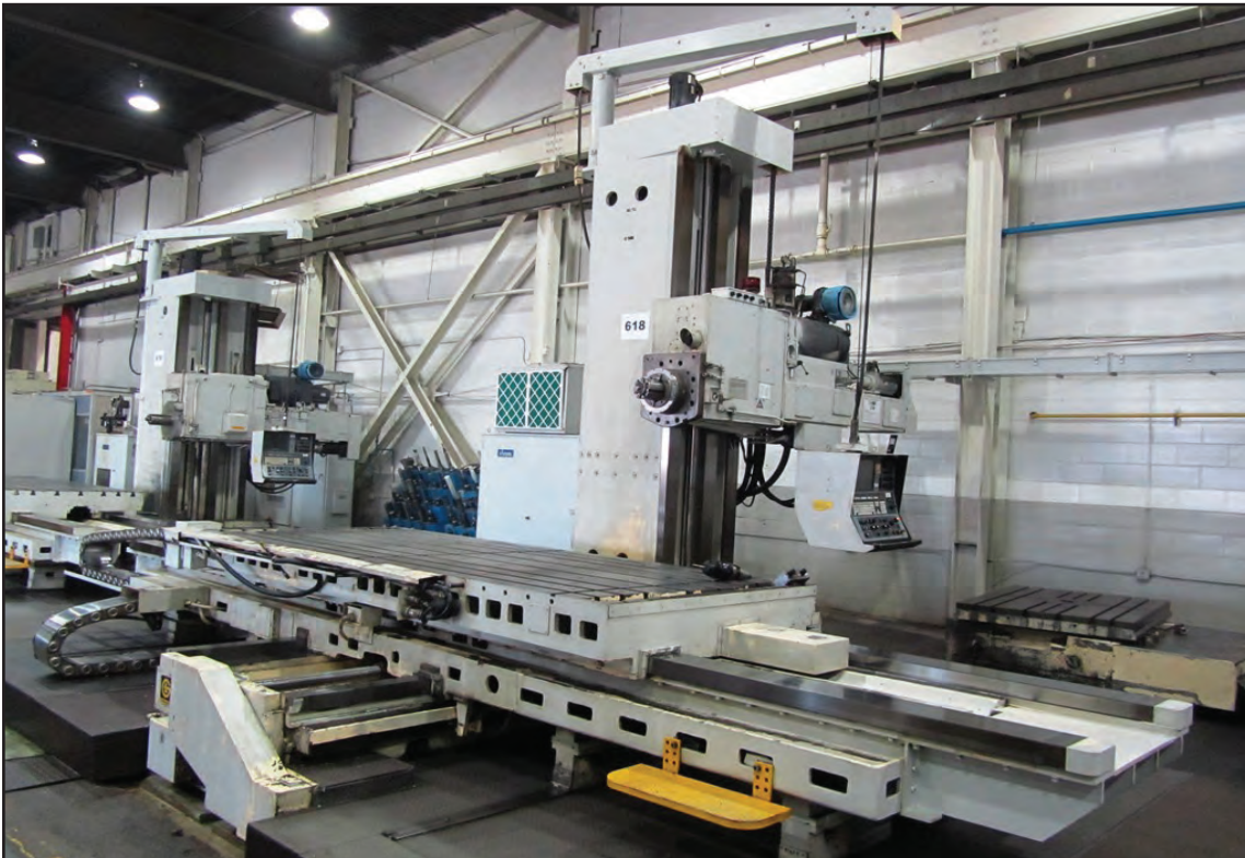
GIDDINGS & LEWIS 70-H6-T 6" CNC TABLE TYPE HORIZONTAL BORING MILL