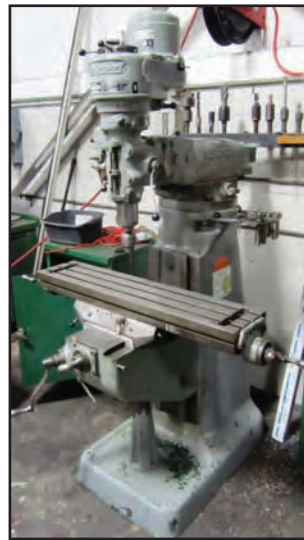
BRIDGEPORT VERTICAL MILLING MACHINE