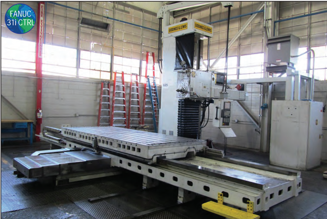
GIDDINGS & LEWIS G60T 6" CNC TABLE TYPE HORIZONTAL BORING MILL