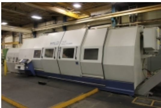
WFL M65 Millturn/4500mm CNC Turning & Milling Center