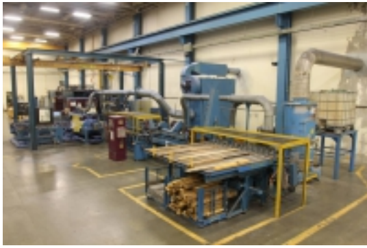
Nylon Coating Line