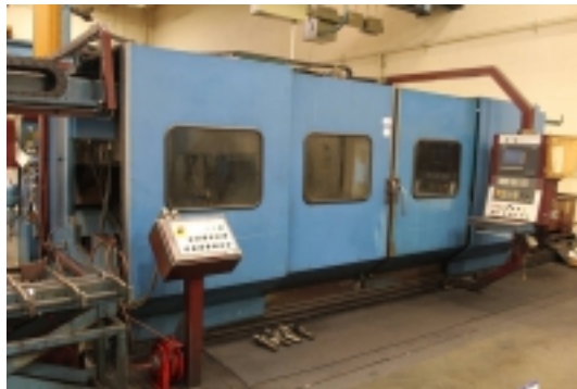
Neue Magdeburger 604MV Twin Spindle CNC Turning Center