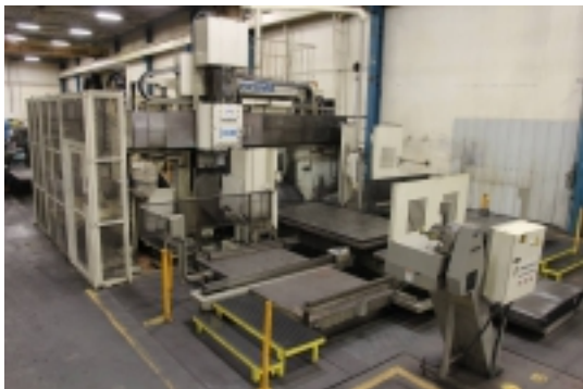
Okuma MCR20A Double Column Gantry 5-Face CNC Vertical Machining Center