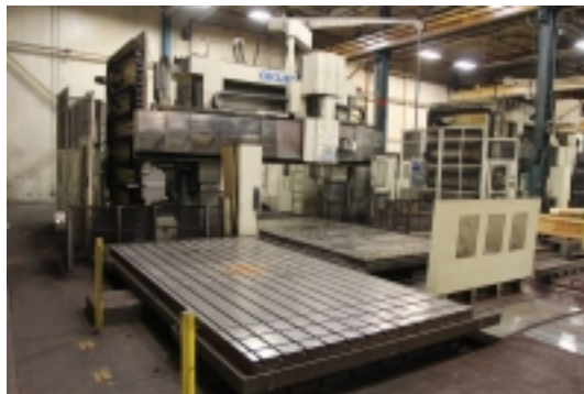
Okuma MCR30BII Double Column Gantry 5-Face CNC Vertical Machining Center