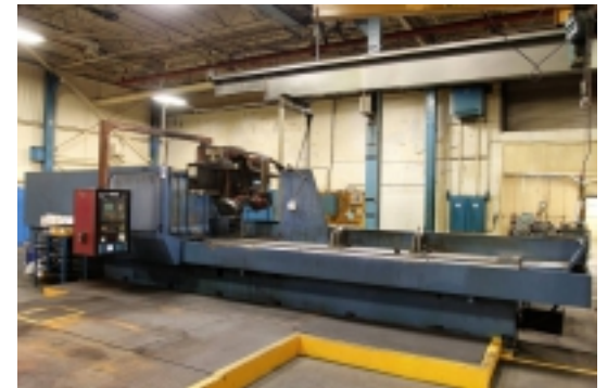
Favretto MC/U 400 Angle Head CNC Grinder