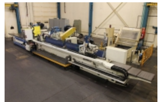
Naxos-Union 63/3250CNC-S CNC Cylindrical Grinder