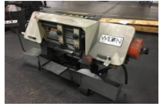
Wilton 7020 Horizontal Band Saw