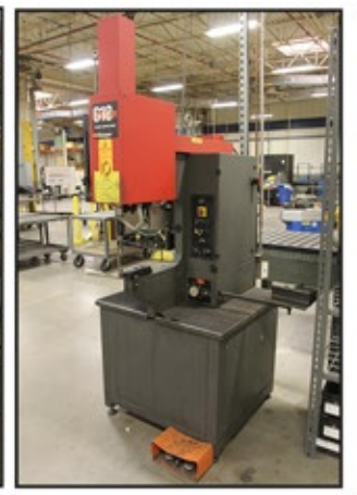
ERCOLINA TB60 "TOP BENDER" TUBE & PIPE BENDER