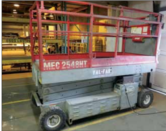
MEC Mdl. 2548HT Scissor Lift