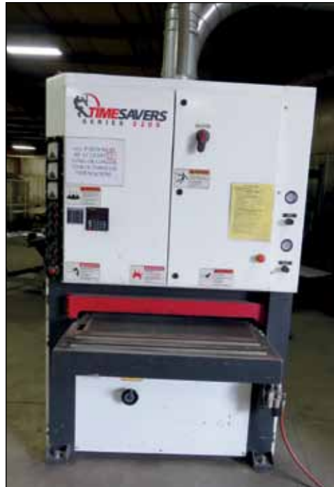
Time Save Series 2200, 36" Belt Sander