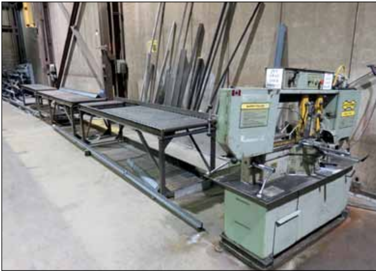
Hyd-Mech Mdl. S-20 Horizontal Band Saw