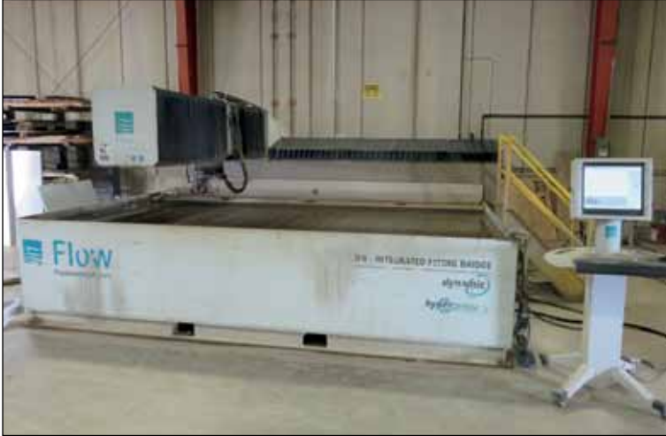
Integrated Flying Bridge Flow Water Jet Cutting System