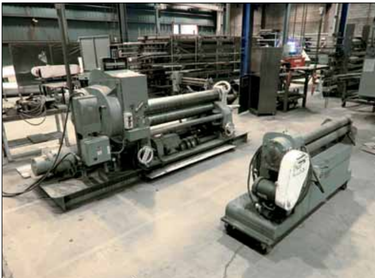
Reed Mdl. 450 & Lown Mdl. G-800, 3-roll Plate Benders