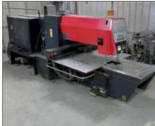
Amada Mdl. 644-II, Lasmag CNC Laser Cutter