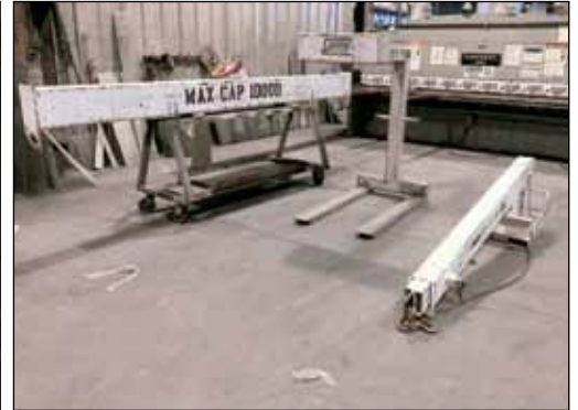
Hydroscale Weigh-Master-05-LED 10,000 lb Cap Crane Scale