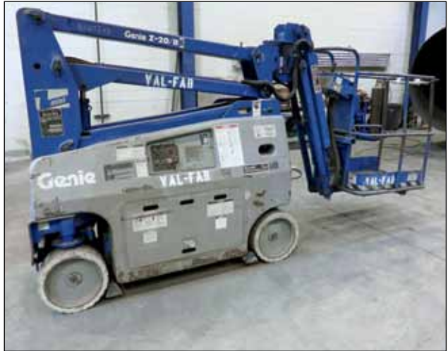
Genie Mdl. Z-20/8 Man/Boom Lift