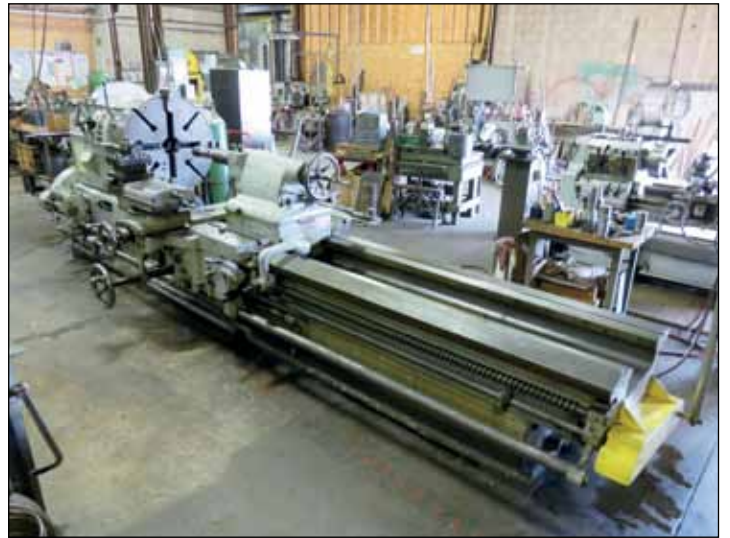
Leblond 36" Heavy Duty Engine Lathe