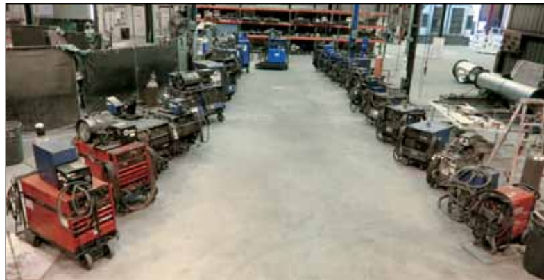
Over (60) Assorted Welders