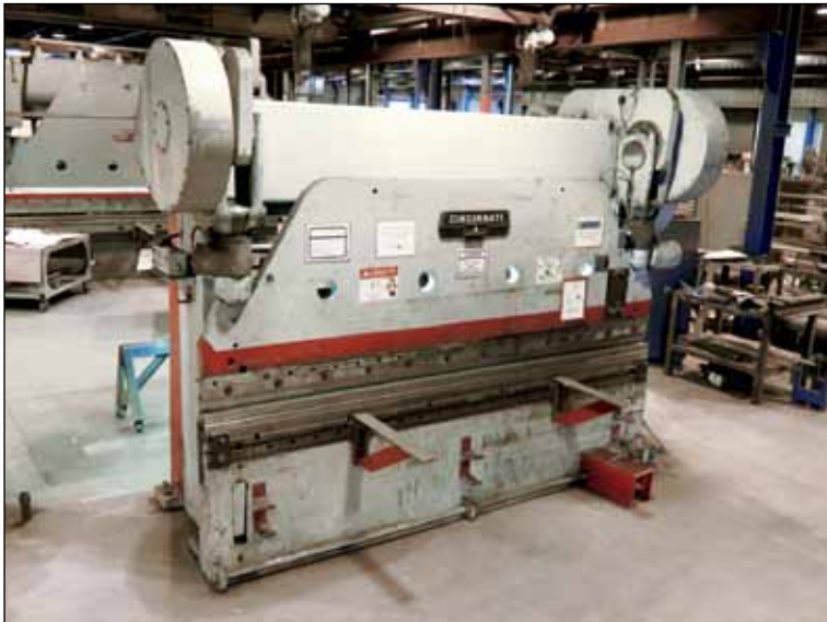
Cincinnati Series 9 10' x 225 ton Press Brake