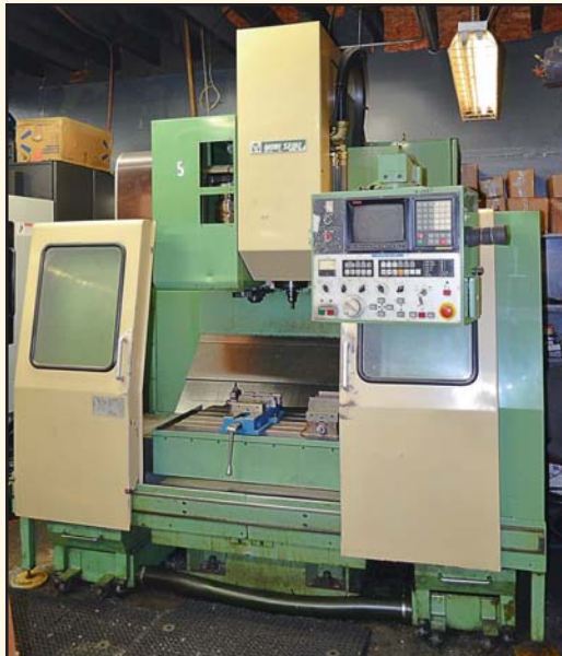
Mori Seiki Mdl. MV-40 CNC Vertical Machining Center