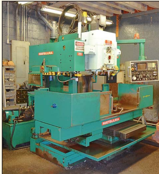
Matsuura Mdl. MC-760V-DC 4-Axis CNC Twin Spindle Vertical Machining Center