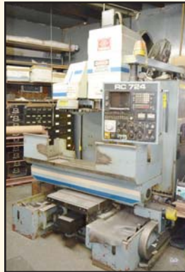
Technics Mdl. RC724 CNC Vertical Machining Center

1985 Matsuura Mdl. MC-500V-DC CNC Vertical Machining Center , travels: X-20", Y-14", Z-17", twin spindle 20-position automatic tool changer, BT-35 taper spindle, 15" x 34" slotted table, coolant pump, Oilmatic oil cooler, Matsuura System M5X, Yasnac CNC controls, S/N: 85014300