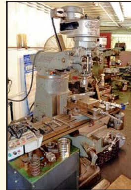
Bridgeport Series J Vertical Milling Machine