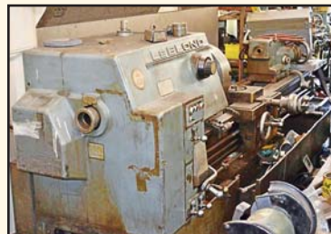
LeBlond 20" x 52" Lathe

Hardinge Mdl. HC Hand Chucker , turret, vari-speed draw bar