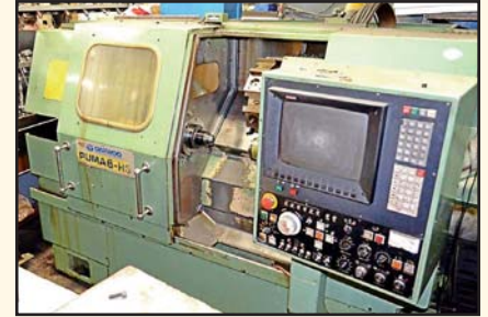
Daewoo Mdl. Puma 6-HS CNC Turning Center