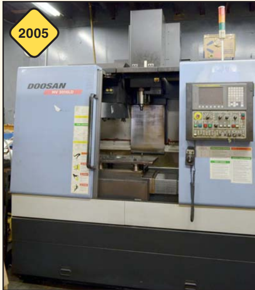
Doosan Mdl. Lynx 220L CNC Turning Center with Tool Presetter