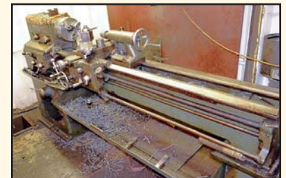
Celtic 14" x 50" Geared Head Engine Lathe