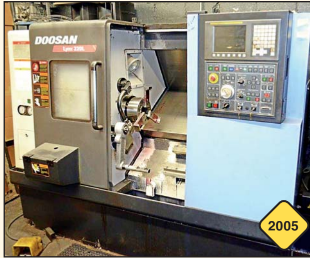
Doosan Mdl. MV-3016 LD CNC Vertical Machining Center