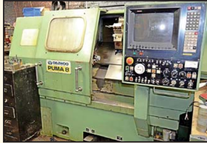
Daewoo Mdl. Puma 8 CNC Turning Center