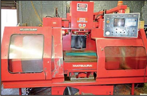
Matsuura Mdl. MC-500V-DC Twin Spindle Vertical Machining Center