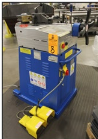
ERCOLINA TB60 "TOP BENDER" TUBE & PIPE BENDER

ERCOLINA TB60 "Top Bender" Tube & Pipe Bender, S/N. 6008042, (2008) 2-1/2" Tube, 2" Sch 40 Pipe, Touch Screen PLC Control, 15" Max CLR, Digital Bend Angle Display, Dual Foot Switch