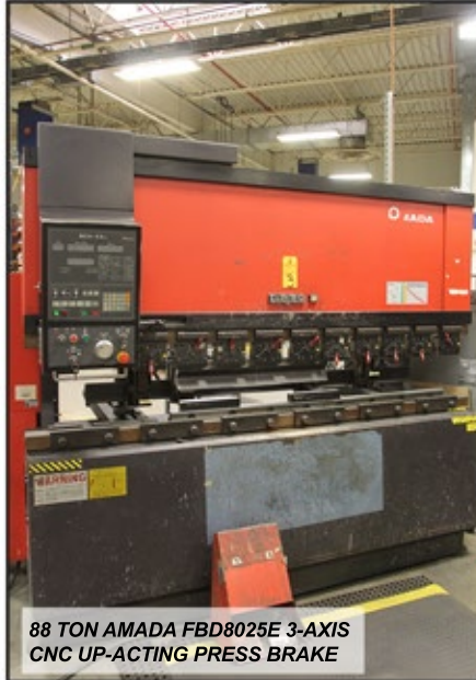
88 TON AMADA FBD8025E 3-AXIS CNC UP-ACTING PRESS BRAKE