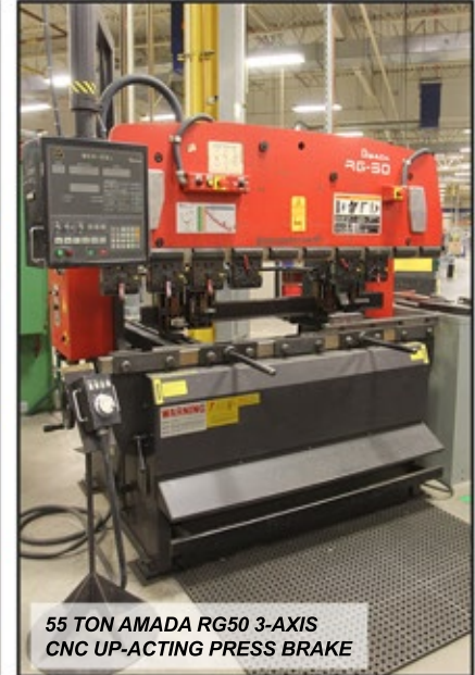
55 TON AMADA RG50 3-AXIS CNC UP-ACTING PRESS BRAKE

View our current auction schedule at www.perfectionindustrial.com