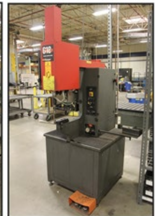
6 TON HAEGER 618 PLUS L INSERTION PRESS