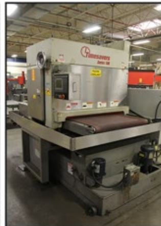
TIMESAVERS 137-HDMW SHEET METAL FINISHING MACHINE