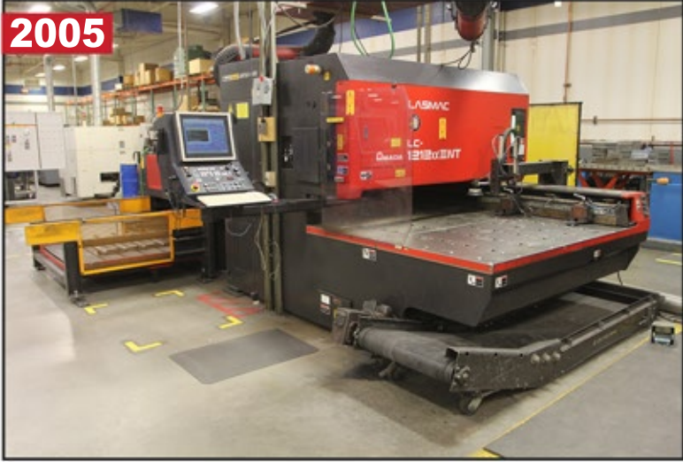
AMADA PULSAR 1212AIII-NT CNC HYBRID LASER