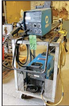
MILLER XMT 304 CC/CV MULTIPROCESS WELDER