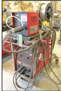
LINCOLN INVERTEC STT II ADVANCED PROCESS WELDER