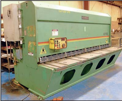
ACCUR SHEAR 837512 HYDRAULIC SHEAR