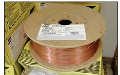
HUNDREDS OF SPOOLS OF WELDING WIRE