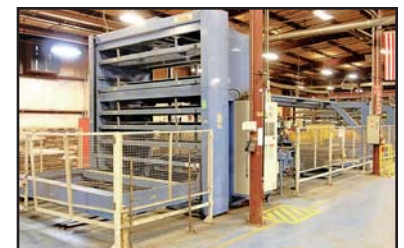
MAZAK FMS-A 510-12 TOWER LOADING SYSTEM W/UNLOADER