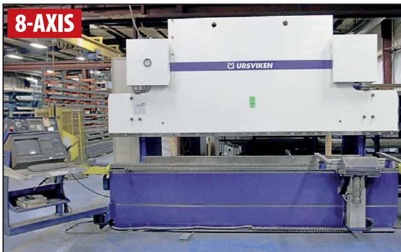
PULLMAX/URSVIKEN OPTIMA 130 4.1 3.15 8-AXIS CNC PRESS BRAKE

KYSOR JOHNSON KVH-24 VERTICAL BANDSAW , s/n 70129