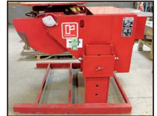
RANSOME 40P WELDING POSITIONER