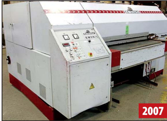
ERNST EM5N/L 1400 DEBURRER