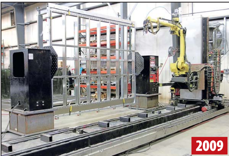
LINCOLN ROBOTIC WELDING CELL

Inspection: Tuesday, June 21, 2016 from 8:00 AM-4:00 PM EDT