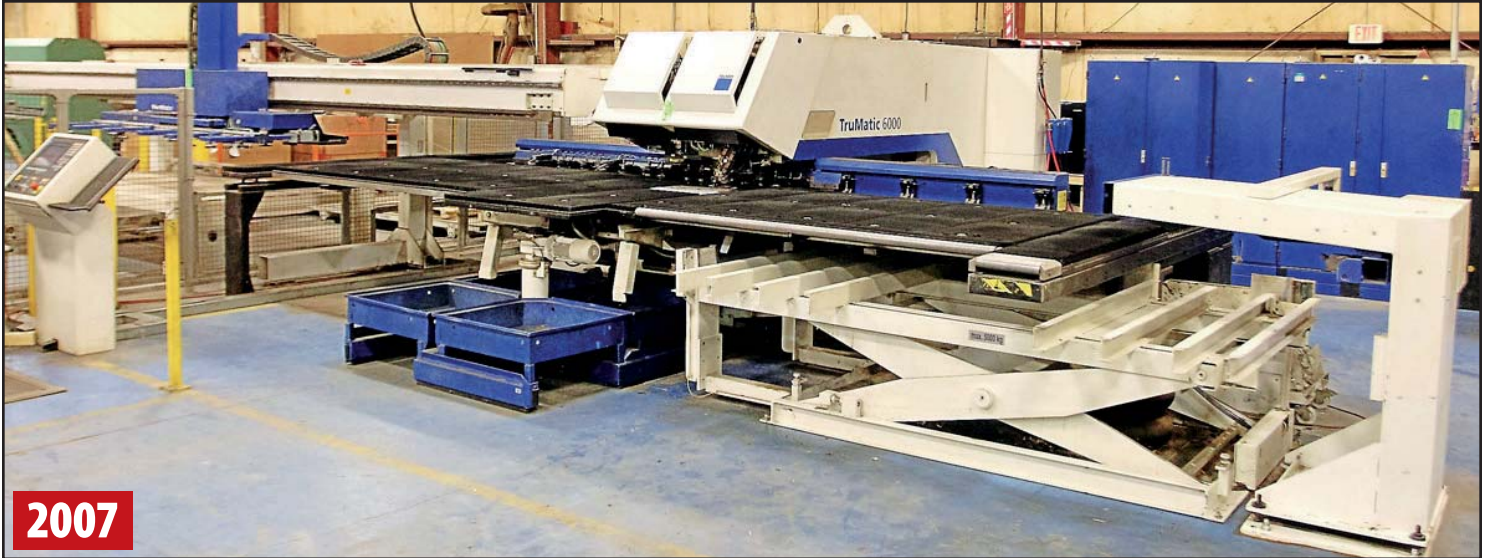
TRUMPF TRUMATIC 6000 COMBINATION CNC PUNCH/LASER

Pre-Auction Purchase Opportunities on Major Assets