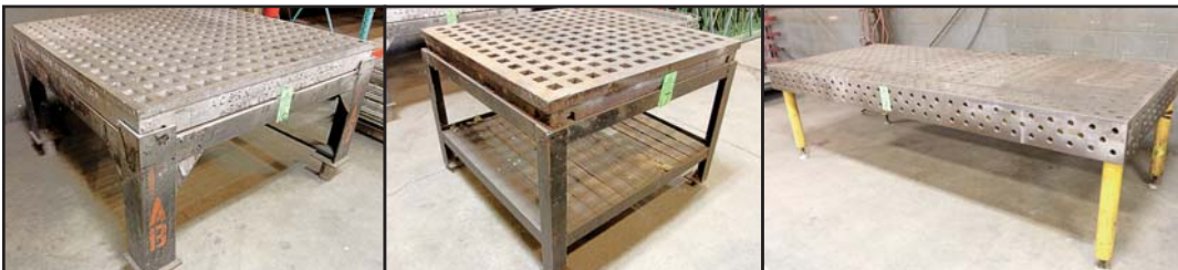
ASSORTED WELDING TABLES

To discuss your requirements for an auction, please call Perfection Industrial 847-545-6374