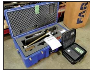
FARO G8 PORTABLE 3D MEASUREMENT ARM