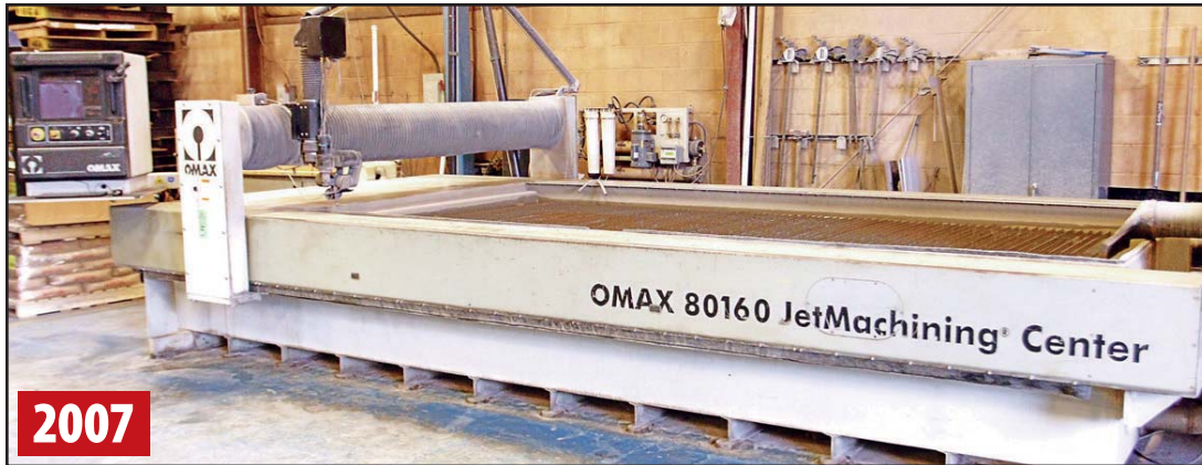
OMAX 80160 BRIDGE-TYPE CNC WATERJET CUTTING SYSTEM