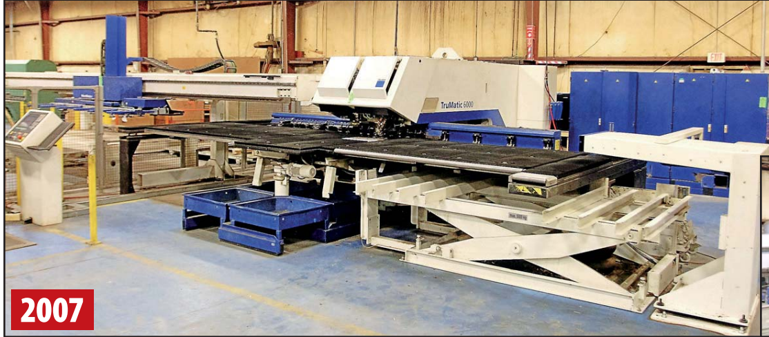
TRUMPF TRUMATIC 6000 COMBINATION CNC PUNCH/LASER

2007 TRUMPF TRUMATIC 6000 COMBINATION CNC PUNCH/LASER , s/n A0100A062, 25 Ton, 60" x 120" Travels, 18-Station Tool Changer, (3) Hydraulic Work Clamps, Programmable Rotary Ram, Trumpf TruFlow 3,200 Watt Laser, (3) Cutting Heads, Brush Tables, Siemens Sinumerik 840D Control, Wheel Technology, Chip Conveyor w/Slug Box, Trumpf SheetMaster, (2) Material Storage Cartridges, (4) Bin Parts Sorter, Loader w/Gripmaster Skeleton Unloader, Riedel Chiller, Trumpf/Handte Dust Collector, Also Large Quantity of Punches, Dies, Cartridges, "Wilson Wheel" Tool, Quick Set Tool Pre-setter