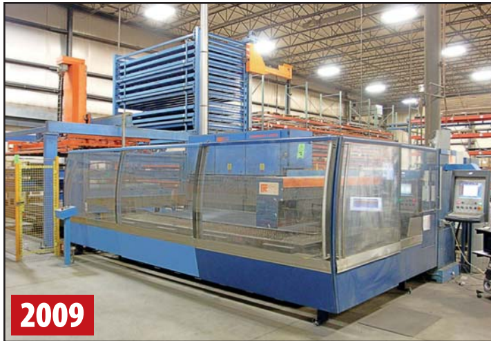
PRIMA PLATINO 2040 CO2 CNC LASER