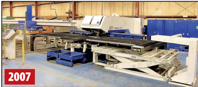
TRUMPF TRUMATIC 6000 COMBINATION CNC PUNCH/LASER

PRISTINE, LATE-MODEL STEEL FABRICATING ASSETS