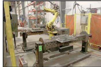
FANUC ARCIMATE 100I ROBOTIC WELDING CELL