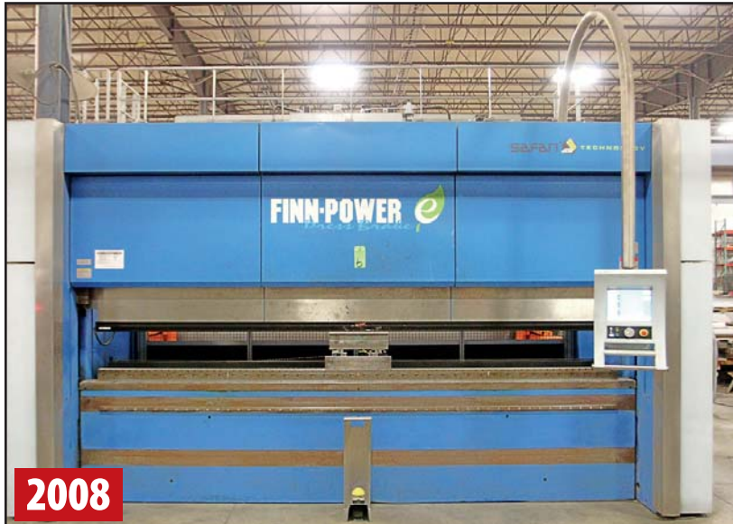
FINN-POWER E SERIES 200-4100 TS-3 SERVO-ELECTRIC 7-AXIS CNC PRESS BRAKE

2007 OMAX 80160 BRIDGE-TYPE CNC WATERJET CUTTING SYSTEM , s/n E511720, w/174" x 89" Table, 168" x 80" Travels, Equipped w/Tilt-A-Jet Head, Motor: Mdl. P4055V, s/n P722480, 40 HP, 55K PSI, Omax Control (PC Based/Windows XP Professional) w/Solids Removal System, 6 Cubic Feet Abrasive Hopper, Koolant Kooler Cooling System