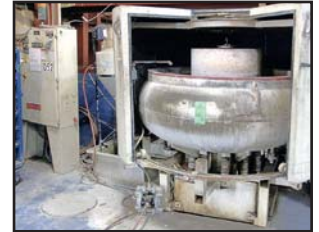
ALMCO OR-23VEE VIBRATORY BOWL FINISHING SYSTEM