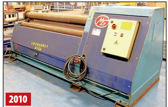
MG/HELLER EH 210B 4-ROLL PLATE BENDING ROLL

Online Bidding at www.perfectionindustrial.com