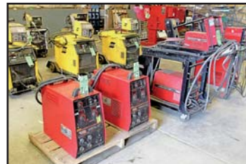
LINCOLN, MILLER, ESAB AND HOBART WELDERS

To discuss your requirements for an auction, please call Perfection Industrial 847-545-6374