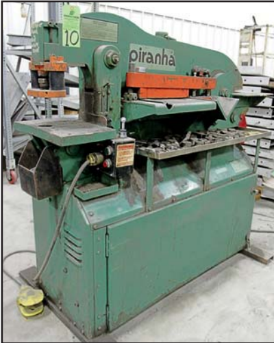
PIRANHA P3 HYDRAULIC IRONWORKER