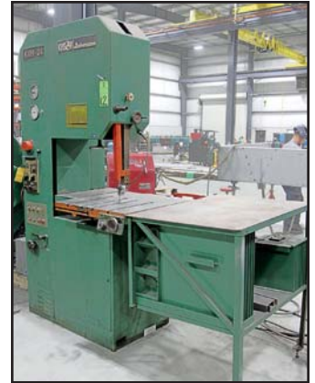
KYSOR JOHNSON KVH-24 VERTICAL BANDSAW