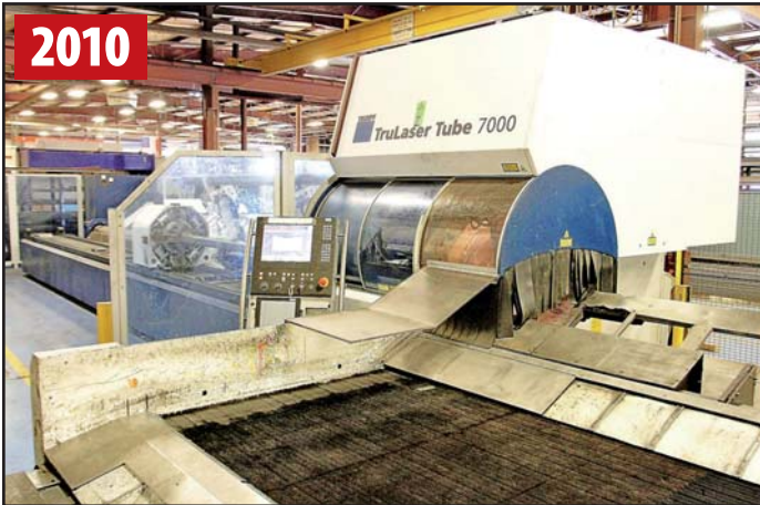
TRUMPF TRULASER 7000 CNC TUBE LASER SYSTEM