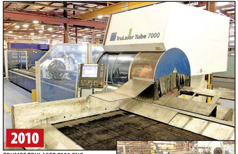
TRUMPF TRULASER 7000 CNC TUBE LASER SYSTEM