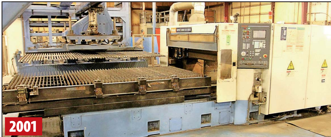
MAZAK SUPER TURBO X510 MKII CNC LASER