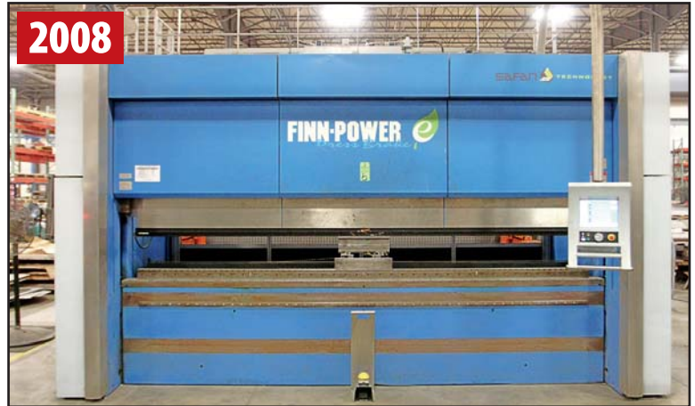
2008 FINN-POWER E SERIES 200-4100 TS-3 SERVO-ELECTRIC 7-AXIS CNC PRESS BRAKE

Sale Closing From: Wednesday, June 22, 2016 at 1:00 PM EDT Sale Location: 132 N Railroad, Oak Harbor, Ohio 43449 Inspection: Tuesday, June 21, 2016 from 8:00 AM-4:00 PM EDT