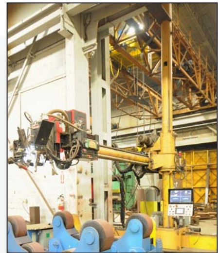
EWING rail-mounted welding manipulator