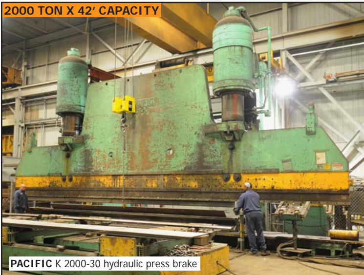
2000 TON X 42' CAPACITY