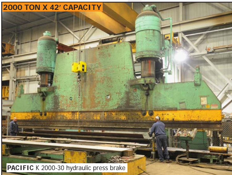
2000 TON X 42' CAPACITY