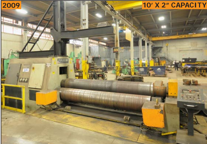
SAHINLER 3R UHS 10-500 double initial pinch hydraulic plate bending rolls