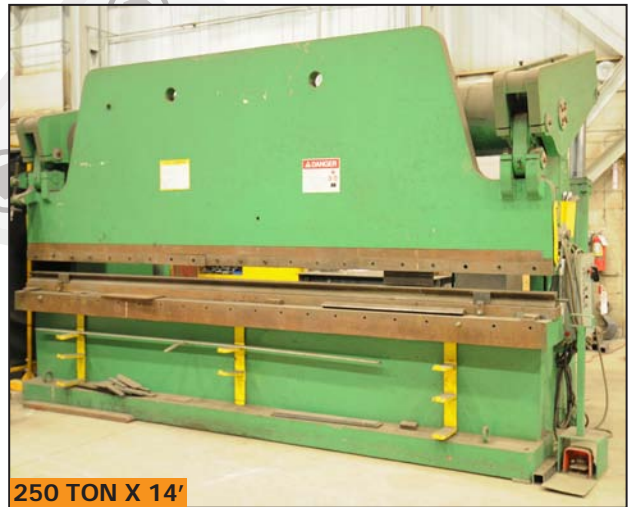
ACCURPRESS 725014 hydraulic press brake