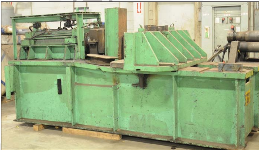
Horizontal hydraulic bulldozer