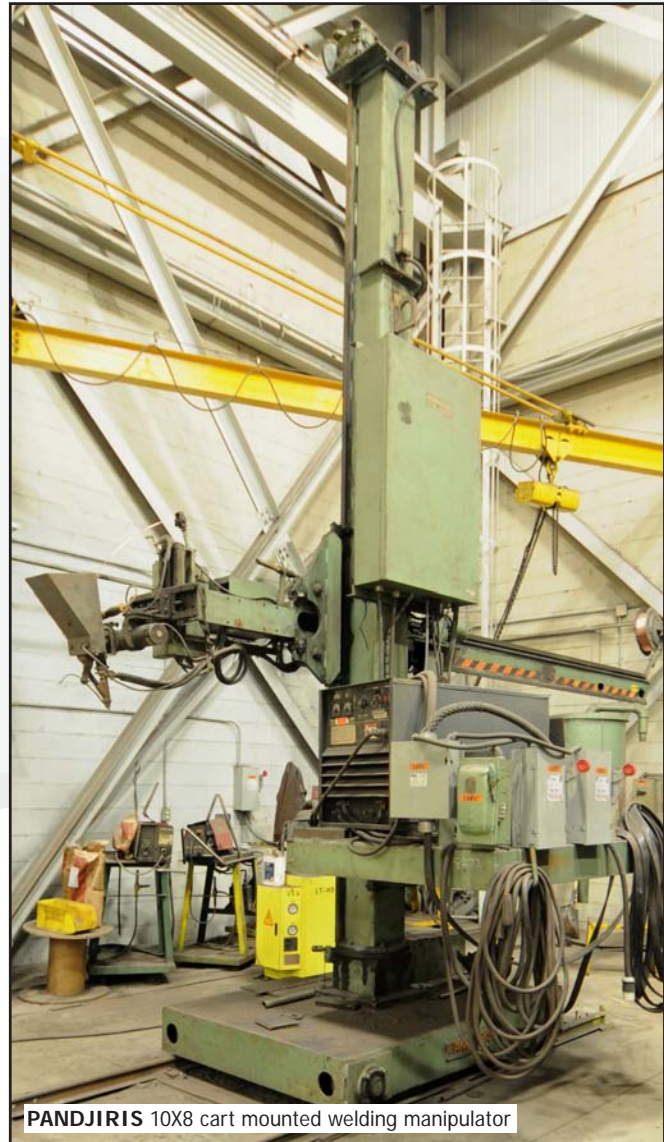
PANDJIRIS 10X8 cart mounted welding manipulator

PLEASE CONTACT RYAN HAAS AT 416.962.9600 FOR FURTHER SALE INFORMATION