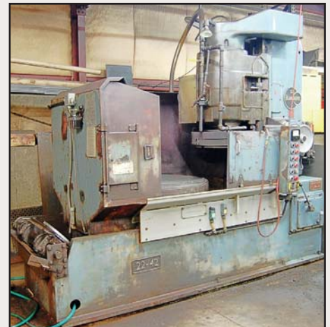
42" Blanchard Mdl. 22-42 Vertical Spindle Rotary Surface Grinder

Brown & Sharpe #2 Hand Screw , S/N: 540-2-350