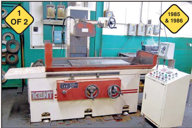
16" x 40" Kent Mdl. KGS410-410AHD Automatic Feed Surface Grinders