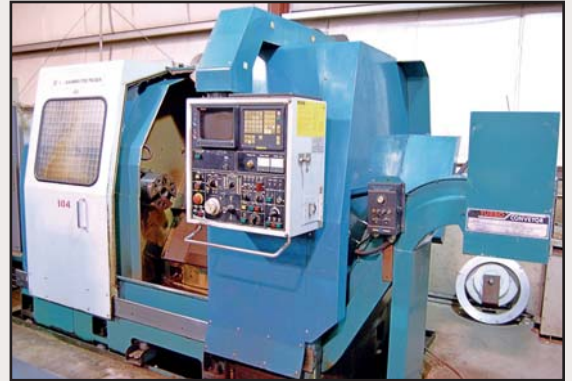
Nakamura Tome/Methods Mdl. S-3B CNC Lathe

Matsuura Mdl. MC-700H-50PC2S CNC Horizontal Machining Center , travels: X-29.52", Y-23.62", Z-24.60", with (2) 19.68" x 19.68" pallets, 800kg. max. weight, 0.001 table indexing increment, 15-4,500 RPM, #50 taper, 15HP/11HP motor, 100-position tool changer, Daikin oil cooler, chip conveyor, Fanuc 15-M control (1989)