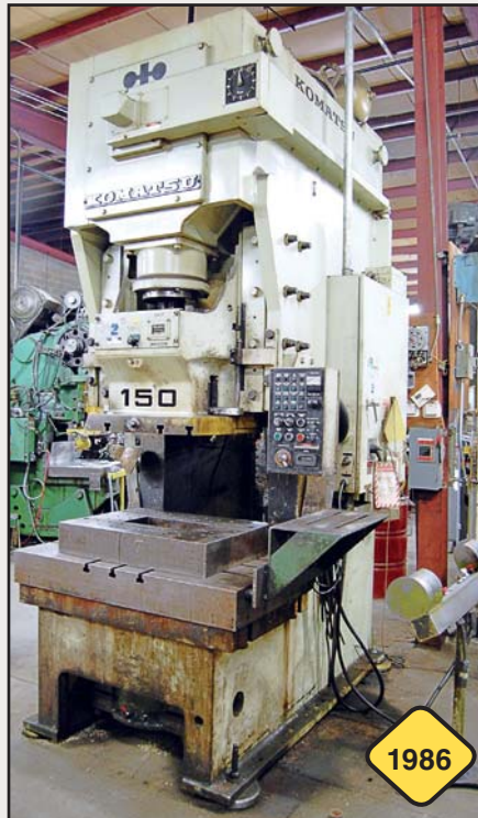
165-Ton Komatsu Mdl. OBS150-2 Gap Frame Power Press