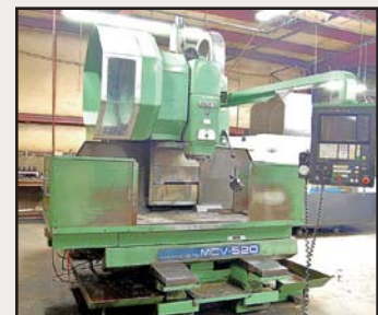
Okuma Mdl. MCV-520 Vertical Machining Center