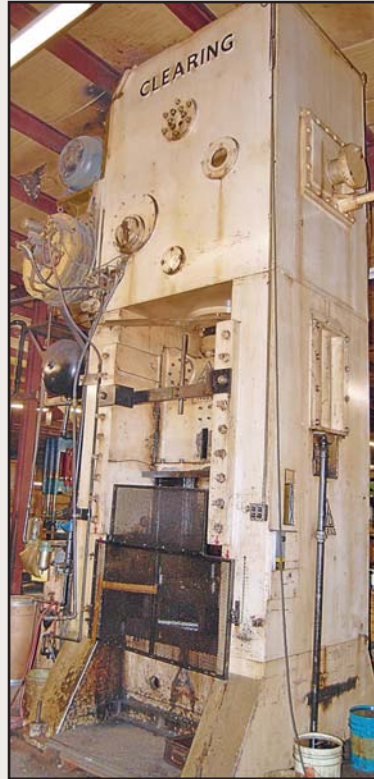
400-Ton Clearing Mdl. F1400-42 Straight Side Single-Crank Press

OKK Mdl. MCV-520 CNC Vertical Machining Center , travels: X-40-1/8", Y-20-1/2" Z-22", with 21-5/8" x 51-1/8" table, 25-3,500 RPM, 15HP/11HP motor, #50 taper spindle, 24-position tool changer, CNC-Matic-G/Meldas M2 control, S/N: 274