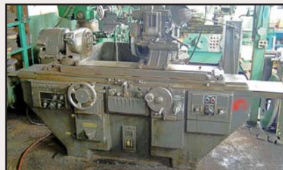
14" x 30" Brown & Sharpe #2 Universal Cylindrical Grinder

Bridgeport 1HP Vertical Knee-Type Milling Machine , with 80–2,720 RPM, 8-spindle speeds, 9" x 36" table, S/N: 12BR-92952