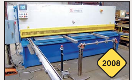
.47" X 126" Knuth Mdl. KHT3212C Hydraulic Shear with EView PLC