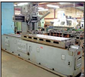
Rockford Open-Side Planer