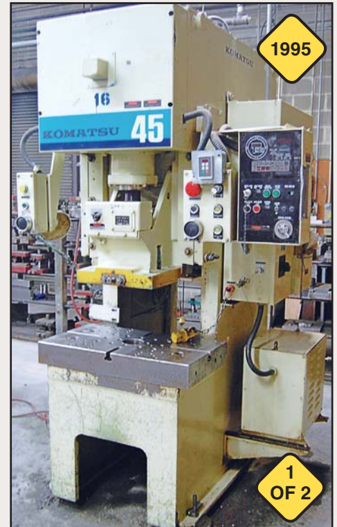
45-Ton Komatsu Mdl. OBS45-3 Gap Frame Punch Press