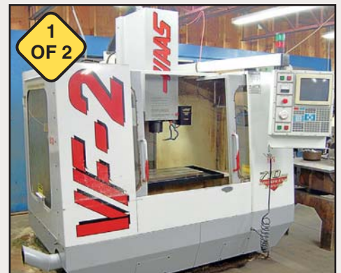
Haas Mdl. VF-2 CNC Vertical Machining Centers