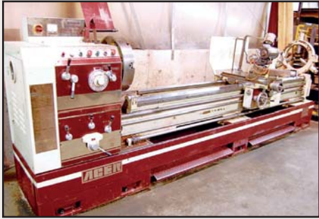
24" x 120" Acer "Dynamic" Mdl. 120G Gap Bed Lathe