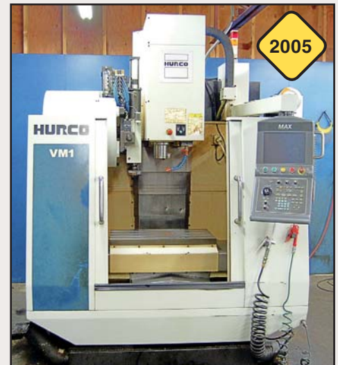
Hurco Mdl. VM-1 CNC Vertical Machining Center

375-Ton Pacific Mdl. 375M48-42 Hydraulic Straight Side Press , with 24" stroke, 39" open height, 15" shut height, 48" x 42" T-slotted bolster and ram, 53.5" between uprights, tonnage control, 3-speed hydraulics, central lube, palm button controls, 40HP main hydraulic pump, S/N: 8307