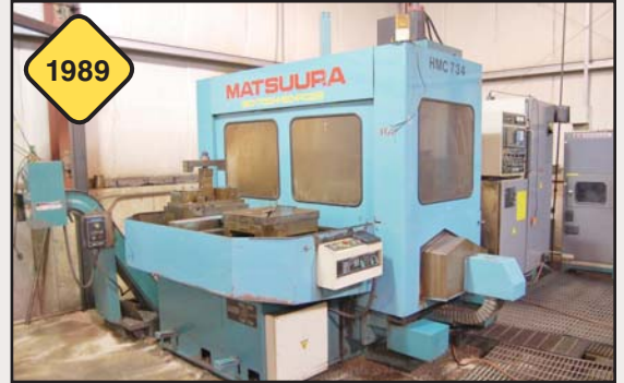
Matsuura Mdl. MC-700H-50PC2S CNC Horizontal Machining Center