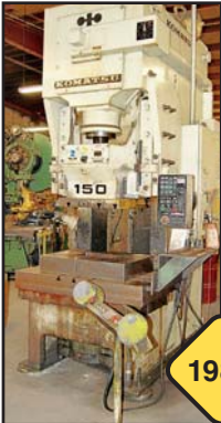
< 165-Ton Komatsu Mdl. OBS150-2 Gap Frame Power Press

Presorted First Class Mail U.S. Postage PAID Eugene, Oregon Permit No. 17