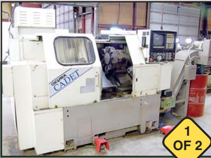
Okuma "Cadet" Mdl. LNC-8 CNC Lathe