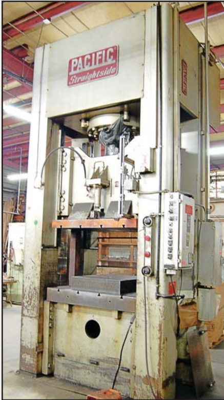
375-Ton Pacific Mdl. 375M48-42 Hydraulic Straight Side Press