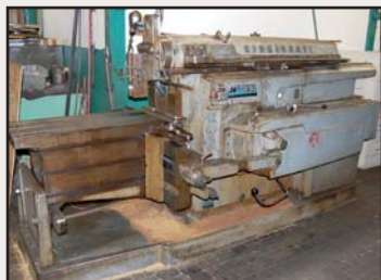
36" Cincinnati "Heavy Duty" Shaper