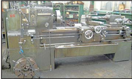
21" x 60" LeBlond "16" Heavy Duty" Lathe