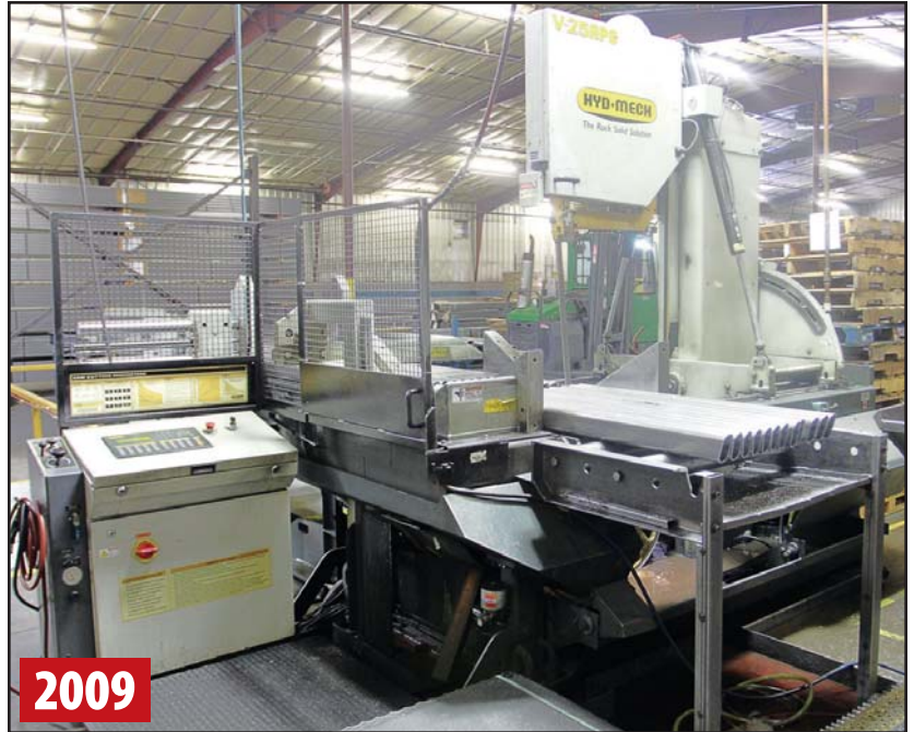
HYD-MECH V25APC CNC VERTICAL BANDSAW