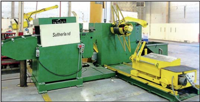
SUTHERLAND 24" X 10,000 LB FEED LINE

To discuss your requirements for an auction, please call Perfection Industrial 847.427.3333