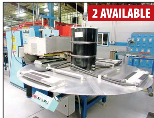
HBM FS-20A HI-FREQUENCY BELT MACHINE