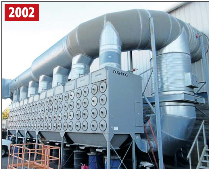
UAS DUST HOG FJH160-4-H55 FUME EXTRACTOR/FILTER