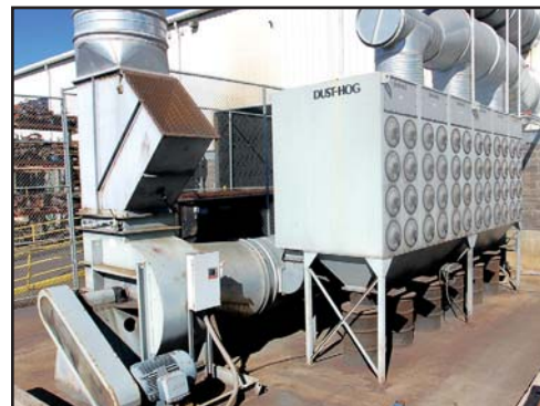
UAS DUST HOG FJH96-4-H55 FUME EXTRACTOR/FILTER

2002 UAS DUST HOG FJH160-4-H55 Fume Extractor/Filter, s/n 60053816, w/96,000 CFM, 250 HP