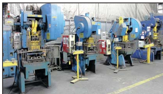
BROWN BOGGS 17LS 60 Ton A/C OBI Press, s/n 10479, w/ Wintriss Clutch/Brake Control