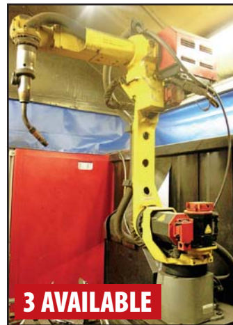
2007 FANUC 100iBE 6-AXIS ROBOT

To discuss your requirements for an auction, please call Perfection Industrial