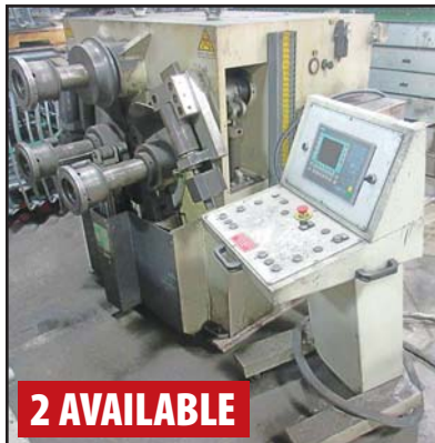
2009 CARELL IMCAR CPHV100 ANGLE BENDING ROLLS

(2) 2009 AND 2008 CARELL IMCAR CPHV100 Angle Bending Rolls, s/n B3070490, B3070484