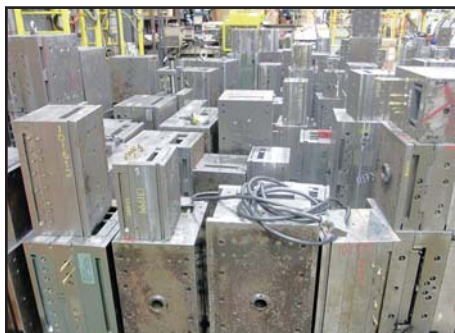
SELECTION OF MOLDS – OVER 400,000 LBS

NOTE: EXTENSIVE SELECTION OF MOLDS AVAILABLE – OVER 400,000 Lbs