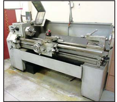
LEBLOND TOOL ROOM LATHE