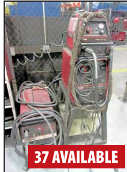
MIG AND TIG WELDERS