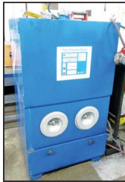
DONALDSON TORIT DUST COLLECTOR