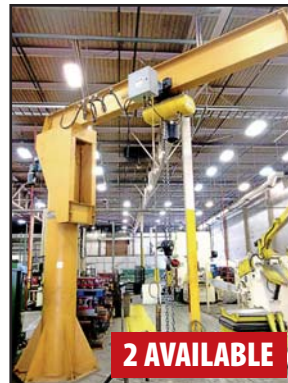
SPANCO 2 TON FREE STANDING JIB CRANE