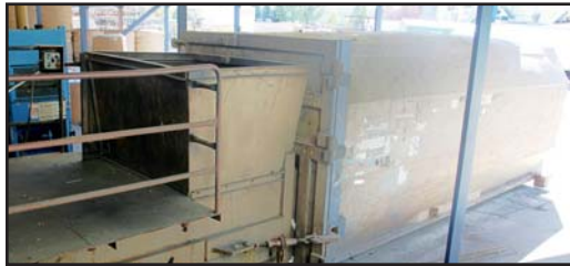
CRAM-A-LOT HYD. COMPACTOR ROLL-OFF