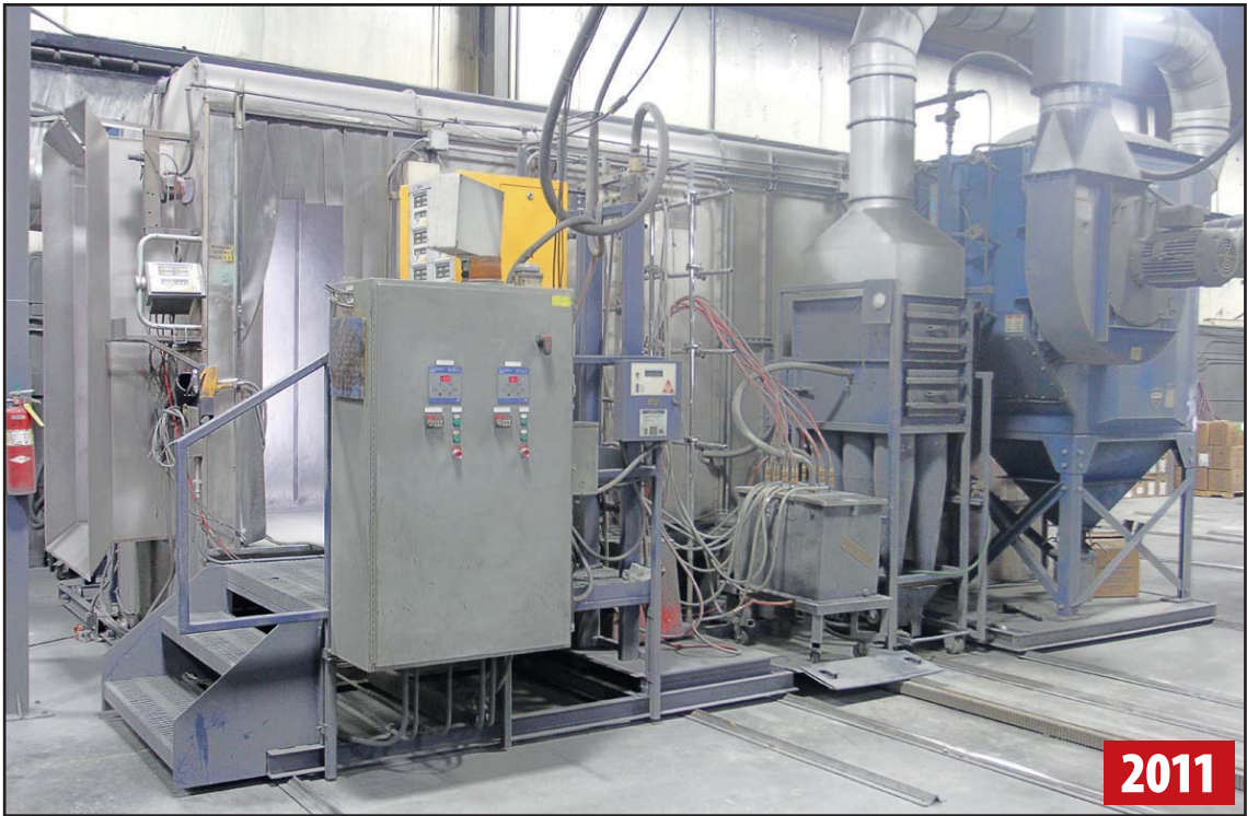
ITW GEMA PAINT SYSTEM

2012 STATE-OF-THE-ART POWDER COAT CONVEYORIZED FINISHING SYSTEM W/84" X 40" WORK OPENING, INCLUDING, (2) ITW GEMA OPTIFLEX A2 POWDER COAT PAINT BOOTHS, GAT 6-STAGE WASH, GAT DRY-OFF OVEN, GAT CURE/BAKE OVEN & 850' ENCLOSED TRACK OVERHEAD CONVEYOR, COST OVER $1,000,000