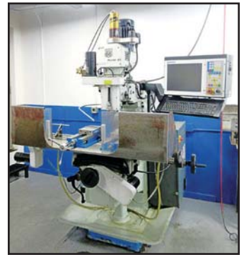
TASK MASTER #3 CNC MILL