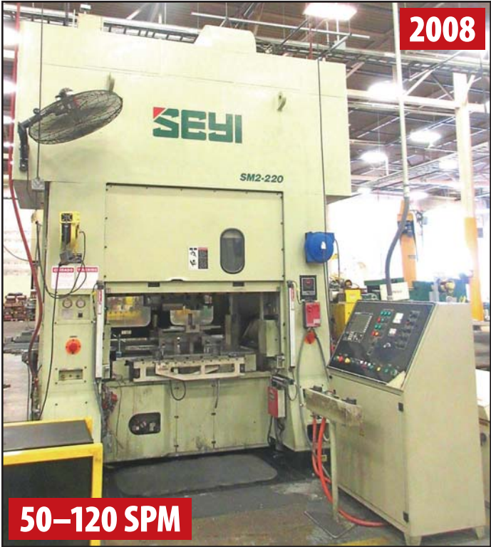
SEYI SM2-220 SS PRESS