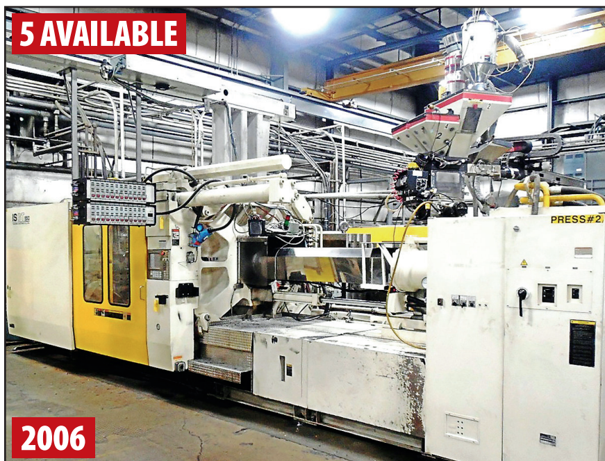
TOSHIBA ISGT950W INJECTION MOLDER