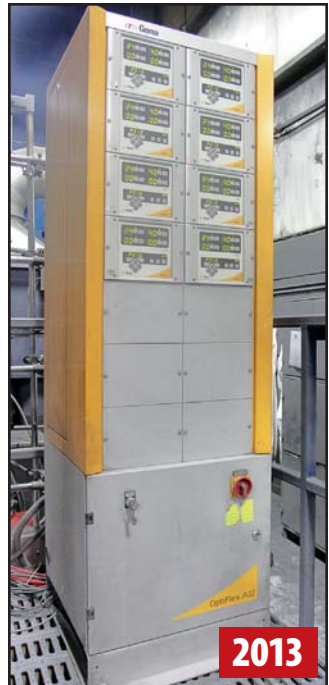
(8) OPTISTAR GUN CONTROLS