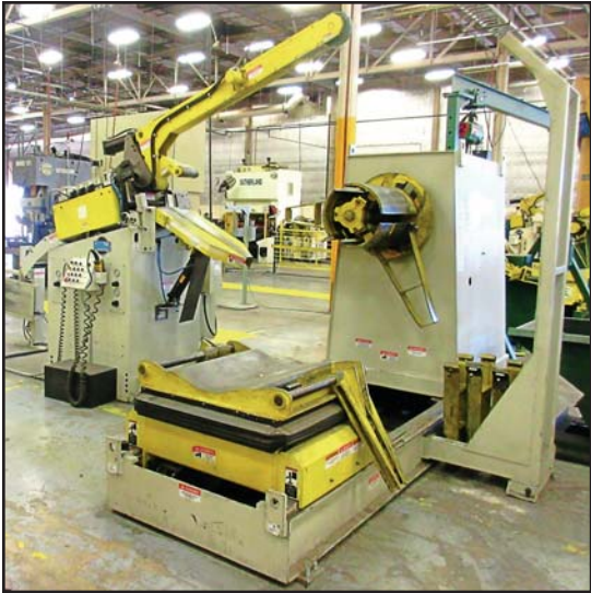
< COE 18" X 10,000 LB FEED LINE