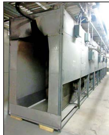
DRI-QUICK INFRARED OVEN