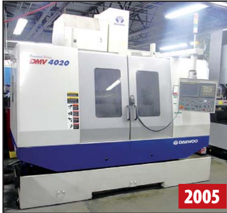
DAEWOO DMV4020 VMC

View our current auction schedule at www.perfectionindustrial.com