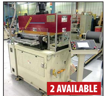
PRECO BELT SKIVER/CUT-OFF MACHINE

To discuss your requirements for an auction, please call Perfection Industrial 847.427.3333