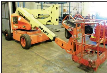
JLG 40 ELECTRIC SNORKEL BOOM

ALSO: Mezzanines, Portable Gantry Cranes, Adjustable Pallet Racking, Cantilever Racking, Crane Scales, Electric Chain Hoists – up to 2 Ton Cap., Spreader Bars, Rigging Equipment, Machinery Skates, Die Trucks, Shop Trucks, Etc.