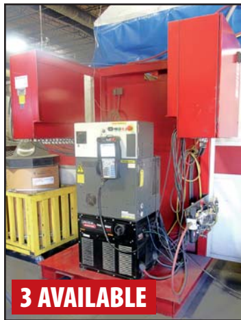
2007 FANUC RJ3iC CONTROL