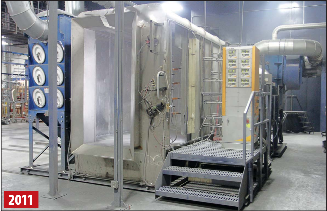
ITW GEMA PAINT SYSTEM