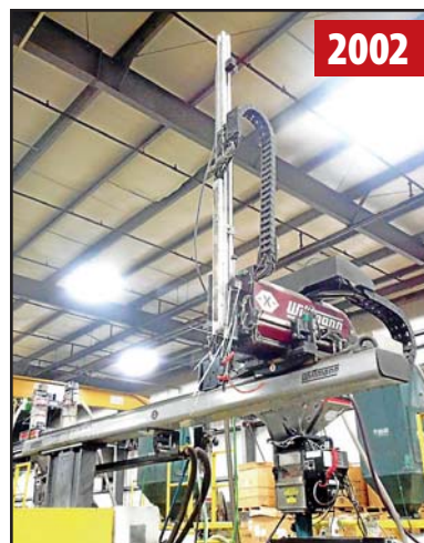
< WITTMANN W641 ROBOT