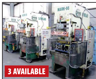
< OBI PRESSES