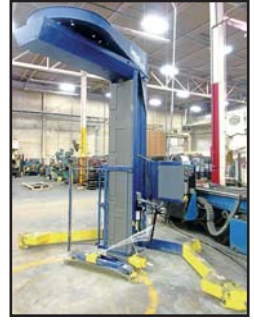
LANTECH STRETCH WRAPPER

Including Compressors, Air Dryers, Compactors w/Roll-Off Containers, Horizontal and Vertical Balers, Dumping Scrap Hoppers, Security Cage, Rolling Shop Carts, Motors, Drives, Scissor Tables, (2) Wheel Dollies, Parts Bins, Strapping Caddies and Tools, Job Boxes, Shop and Step Ladders, Personnel Lockers, Storage Racks, Pneumatic and Elec. Hose Reels, Conveyors, Shop Fans, Shop Vacs, Janitorial Equip. and Supplies, Large Quantity of Hand Tools, Bolt Cutters, Crimpers, All Sizes of Pipe Wrenches, Hand Files, Electric Drills, Cordless Drills, Ridgid Pipe Benders and Cutters, C Clamps, Pry Bars, Bessey Clamps, Tool Adapters Sets, Greenlee Cable Cutters, Vise Grips, Hammers, Screw Drivers, Mitre Saws, Enerpac Hyd. Jacks, Electric and Pneumatic Grinders, Nibblers, Saws, Sanders, Sledge Hammers, Routers, Cut-Off Saws, Staplers, Nailers, Levels, Pneumatic Hammer and Impact Guns, BUX DH50RP Mag. Base Drills, Grinder Wheels, Discs, Brushes, Drills, Reamers, Hole Saws, Toolboxes, Steel Banding and Auto. Strapping Tools, Large Assortment of Pipe Bending Dies, Perishable Tooling including Drills, Reamers, Cutters, Carbide Inserts, Taps, V Flange Tools Holders, Boring Bars