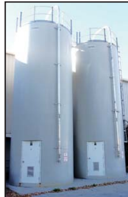
(2) COLUMBIAN TECTANK 12' X 30' SILOS