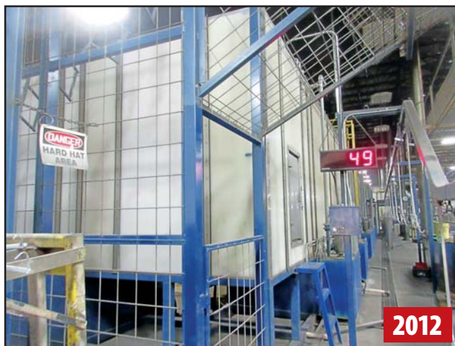
GAT 6-STAGE WASH SYSTEM