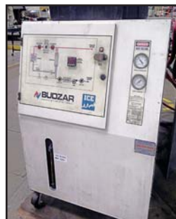
BUDZAR ICE PORTABLE CHILLERS