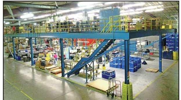
FREE STANDING MEZZANINE

ALSO: Van Trailers, Electric Personnel Trucks, Electric Shop Trucks, Scissor Lifts