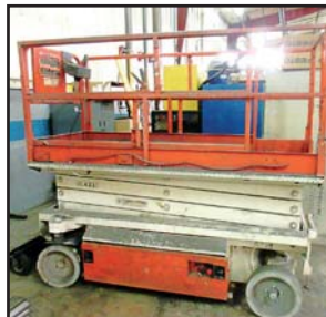
JLG SCISSOR LIFT