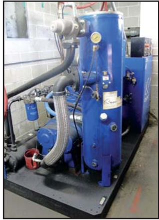
2009 QUINCY 100 AIR COMPRESSOR