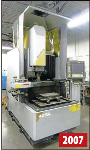
SODICK AQ55L 3-AXIS CNC SINKER EDM