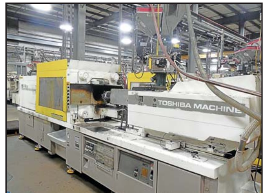
1993 TOSHIBA ISFA310A INJECTION MOLDER

PLEASE NOTE: Robots will be offered separate of Injection Molders. Please Visit Our Web Page at www.PerfectionIndustrial.com for Detailed Specifications.