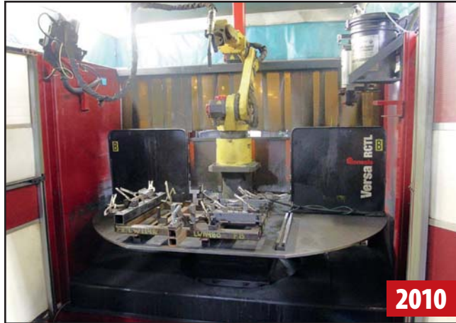
GENESIS SYSTEMS WELDING CELL