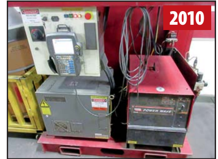
FANUC R-30iA CONTROL AND LINCOLN i400 WELDER