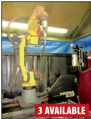
2009 FANUC 100IC 6-AXIS ROBOT

(2) MILLER OTC 6-Axis Welding Robots, w/Miller Deltaweld 451 Welder, Miller Computer Interface, Fiber Optic Weld Controller