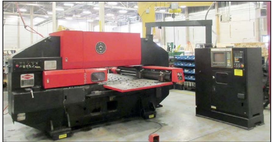
AMADA PEGA 345 QUEEN TURRET PUNCH