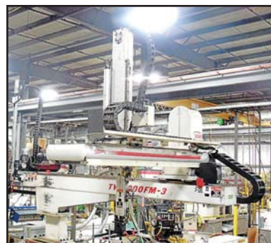
< STAR TW-1000FM-3 ROBOT

To discuss your requirements for an auction, please call Perfection Industrial 847.427.3333