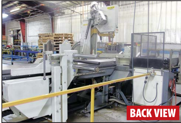
HYD-MECH V25APC CNC VERTICAL BANDSAW