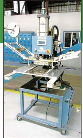
HASTINGS P-3-HT HOT STAMP PRESS