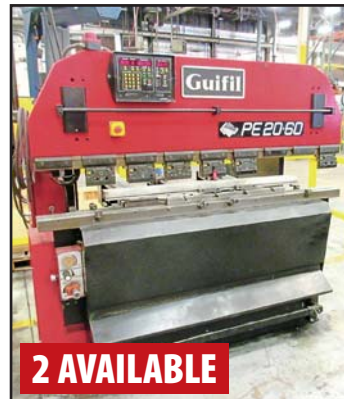
GUIFIL PE20-60 HYD. CNC PRESSES