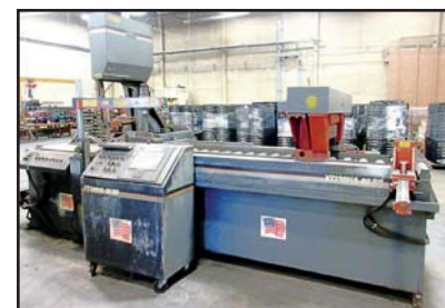
HEM VT130HA-60SS AUTO. VERTICAL BANDSAW