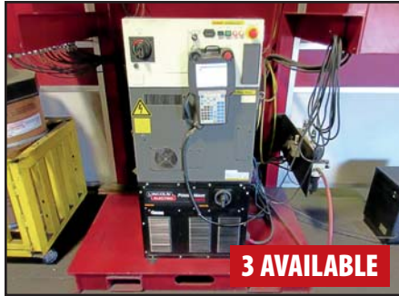
2009 FANUC R-30IA CONTROL AND LINCOLN I400 WELDER