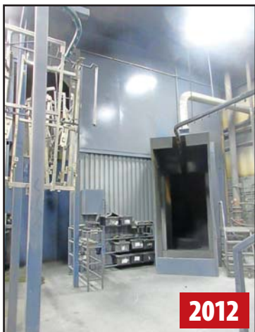
GAT DRY-OFF OVEN AND BAKE OVEN