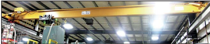
ICM 10 TON X 60' OVERHEAD BRIDGE CRANE