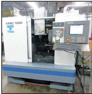
TREE VMC 500 GRAPHITE VMC

ALSO: TESA CMM, Micrometers, Verniers, Inspection/QA Equipment, KURT Vises, Rotary Tables, Angle Plates, Perishable Tooling, Mag. Base Drills, Machining Tables, LISTA Cabinets, Stronghold Cabinets, MIG and TIG Welders, Plasma Cutters, Drill Presses, Carbide and Double End Grinders, DAKE Hyd. Shop Presses, ELECTRO-ARC Tap Disintegrators, Shot Blast Cabinet, Etc.