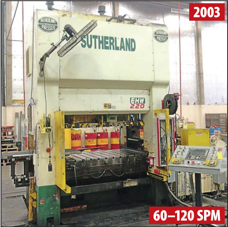
SUTHERLAND EHW220 SS PRESS