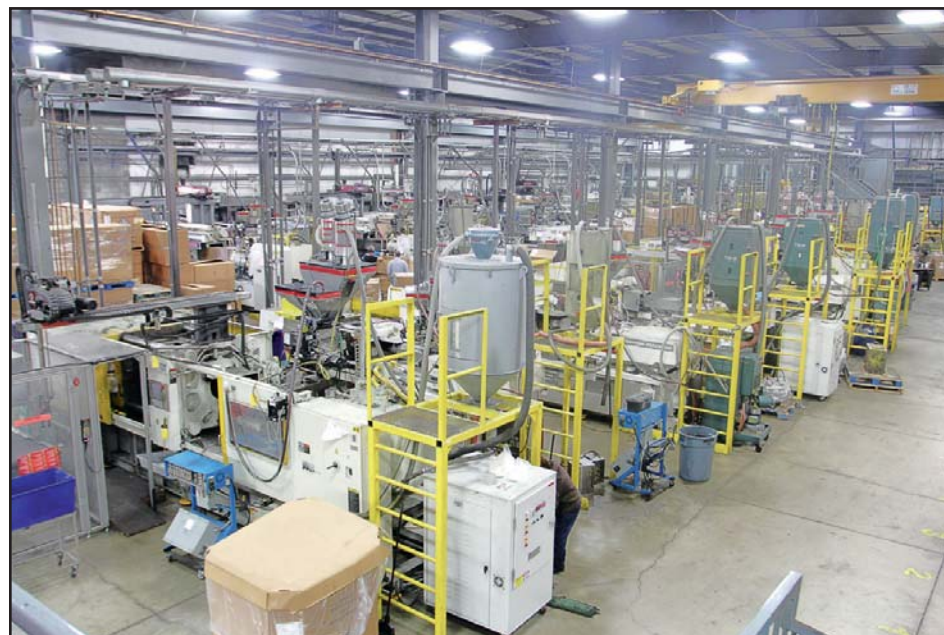
VIEW OF INJECTION MOLDER DEPT.