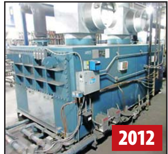
RITE ENG. BOILER