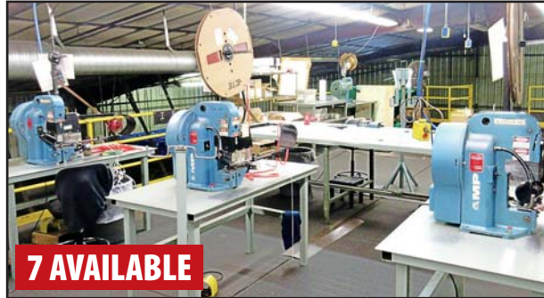
VIEW OF AMP PRESSES