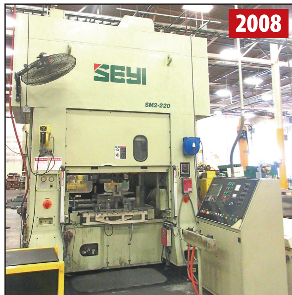
SEYI SM2-220 SS PRESS