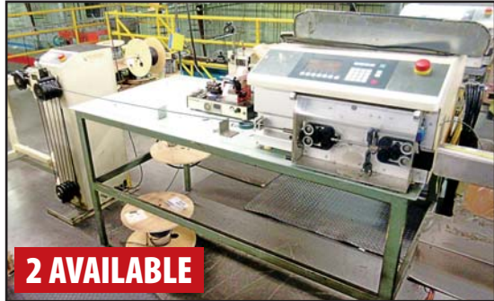
SCHLEUNIGER PS 9500 WIRE CUT AND STRIP

Inspection: Monday & Tuesday, December 7 & 8, 2015 from 9:00 AM–4:30 PM MT