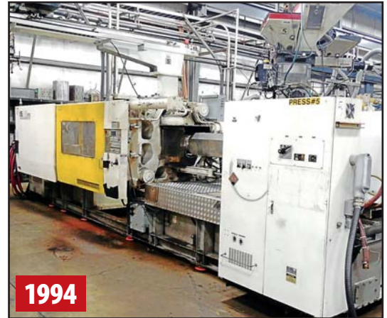
TOSHIBA ISGS610 INJECTION MOLDER

1993 TOSHIBA ISF390 Injection Molder , s/n 320303