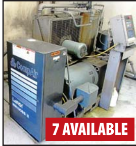
COMPAIR AIR COMPRESSOR