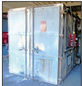
CONTROLLED PYROLYSIS BURN-OFF OVEN