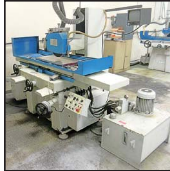
AMW GS-1632CH SURFACE GRINDER

ALSO: Engine Lathes, Shop Lathes, Shop Presses, Hyd. Surface Grinders, Hand Feed Surface Grinders, Drill Point Grinders, Drill Presses