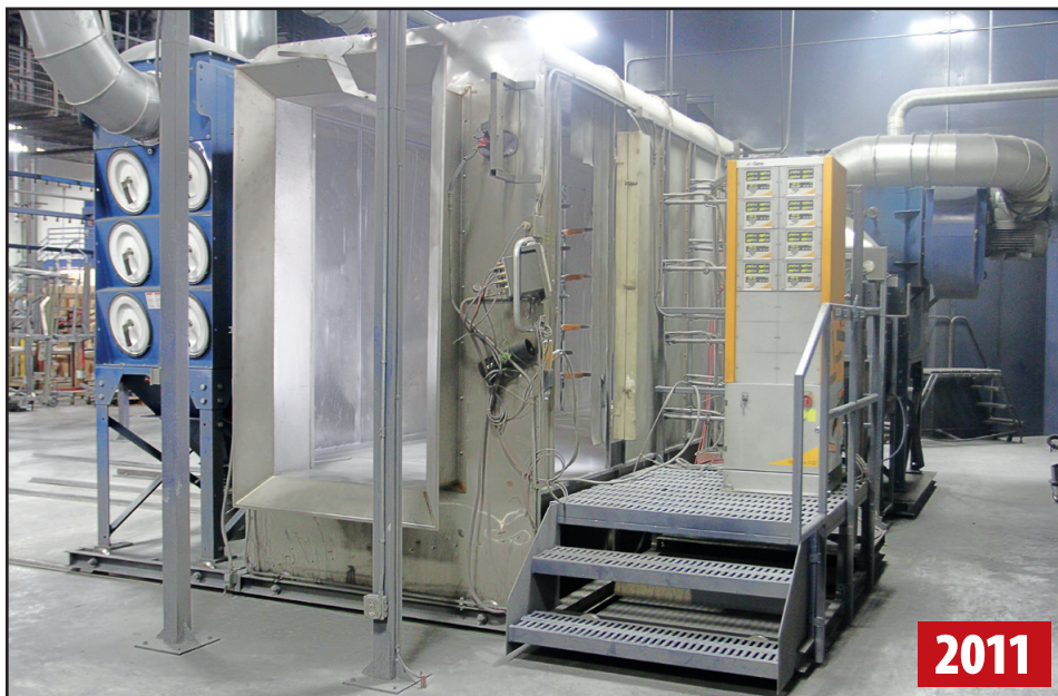
ITW GEMA PAINT SYSTEM

Sale Closes: Tues., Dec. 15, 2015 at 10:00 AM MT Location: 1500 S 1000 W, Logan, Utah 84321 Additional Assets Located at Ogden, UT Facility: 221 N 1070 W, Bldg. 15B, Ogden, UT 84404 Inspection: Monday & Tuesday, Dec. 7 & 8, 2015 from 9:00 AM–4:30 PM MT