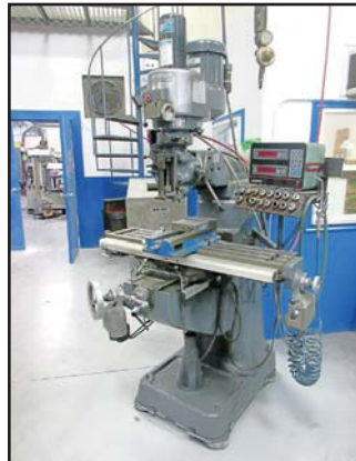
BRIDGEPORT 2 HP MILL