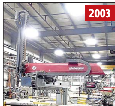
< WITTMANN W643 ROBOT