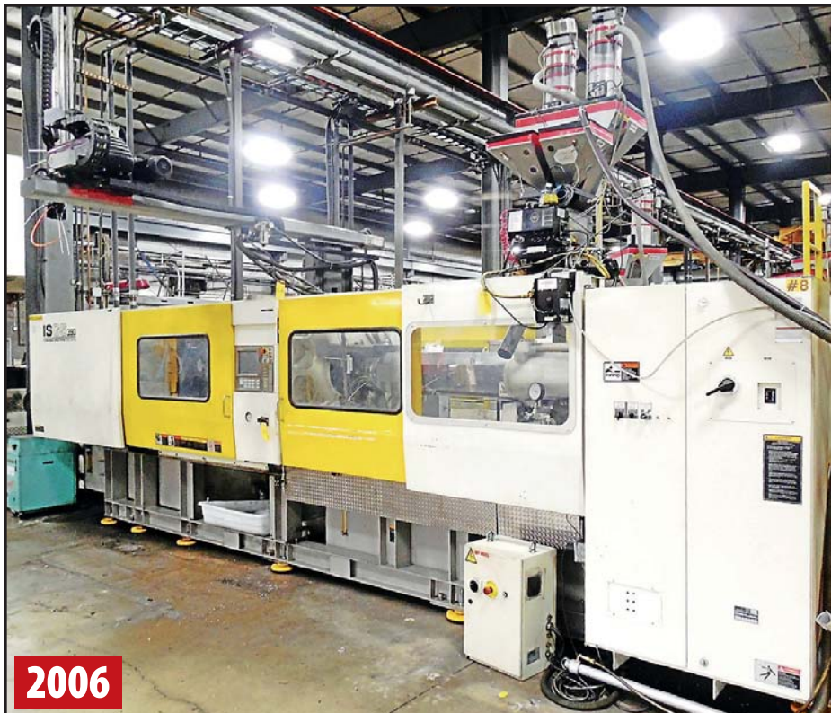
TOSHIBA ISGS390W INJECTION MOLDER

2006 TOSHIBA ISGS390W Injection Molder , s/n 633411, w/2006 Wittmann W620M Robot