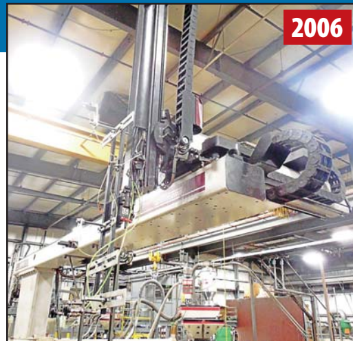
WITTMANN W743C ROBOT