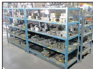
TUBE BENDER TOOLING