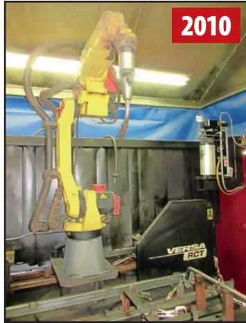
FANUC 100IC 6-AXIS ROBOT