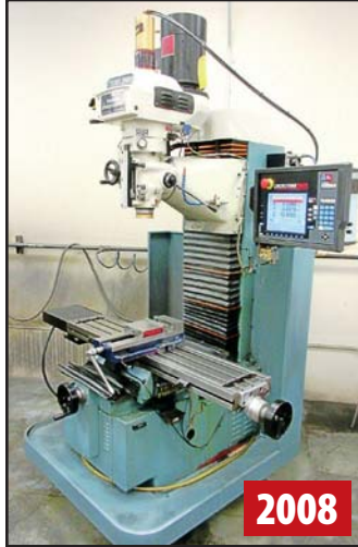
SWI TRAK DPMSX3 5 HP CNC MILL