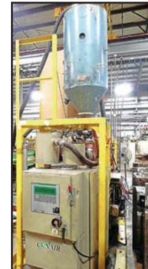
CONAIR COMPU-DRY 200 DRYER/HOPPER