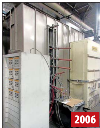
ITW GEMA POWDER COAT FINISHING SYSTEM