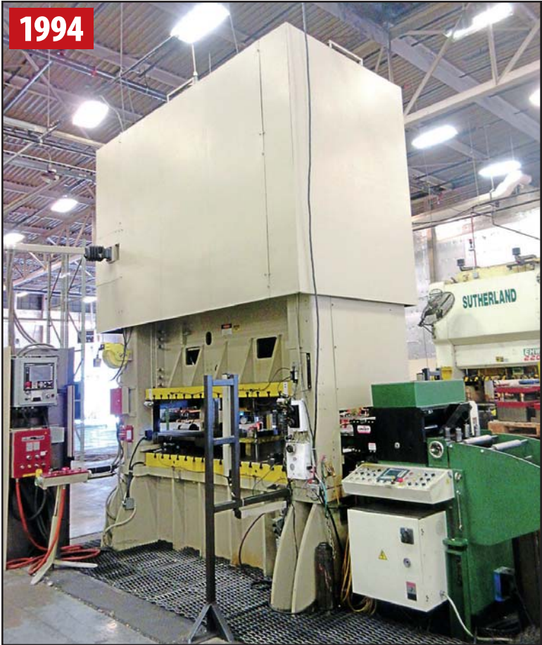
HEIM S2-300MS SS PRESS