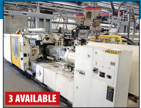
2000 TOSHIBA ISGT950 INJECTION MOLDER