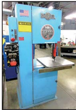
DOALL VERTICAL BANDSAW