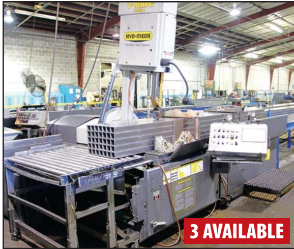
HYD-MECH V18APC CNC VERT. BANDSAW, NEW AS 2011