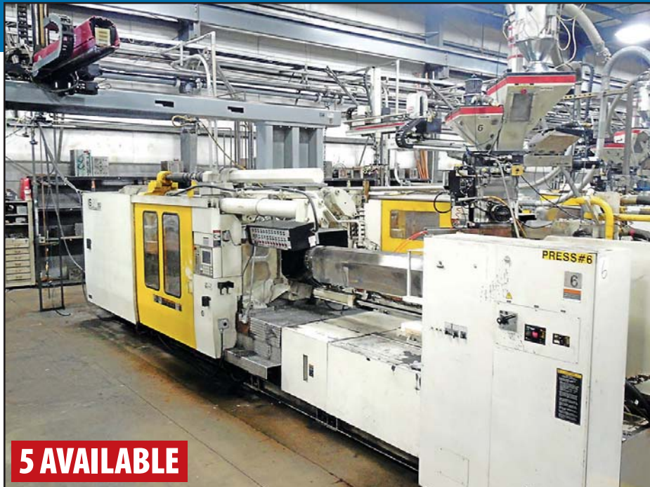
2002 TOSHIBA ISGT950 INJECTION MOLDER