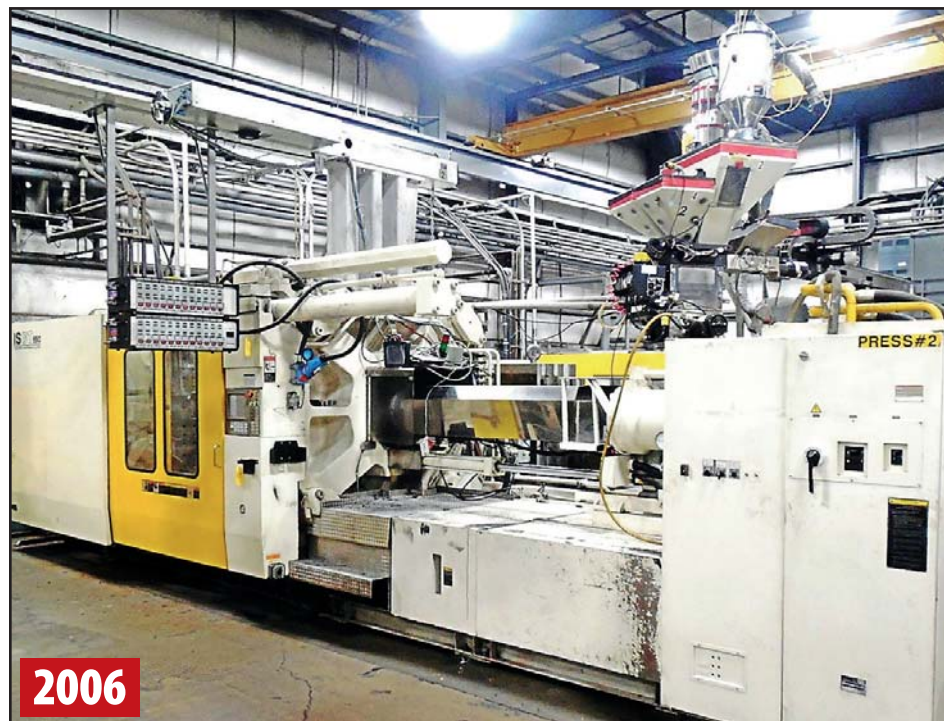
TOSHIBA ISGT950W INJECTION MOLDER

Inspection: Monday & Tuesday, December 7 & 8, 2015 from 9:00 AM–4:30 PM MT