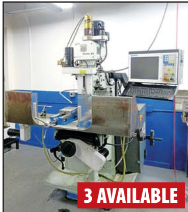
TASK MASTER NO. 3 CNC MILL