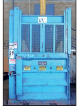
TL IND HYD. BALER