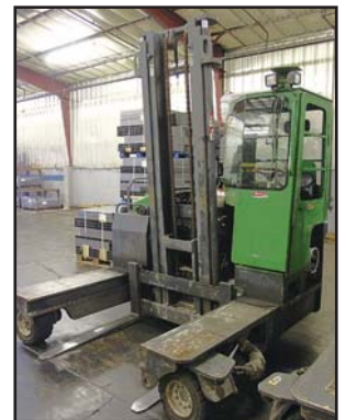
COMBI 2404-IN SF SIDE LOADER