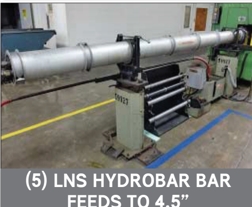
(5) LNS HYDROBAR BAR FEEDS TO 4.5"