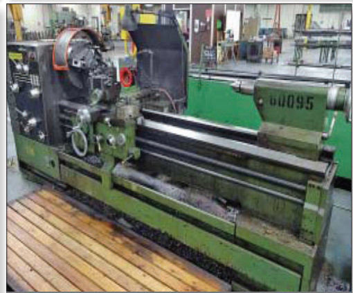
26"/36" X 78" SOUTH BEND MODEL NORDIC GAP BED ENGINE LATHE