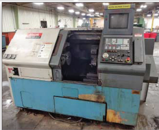
MAZAK MODEL QUICKTURN 20 HP CNC TURNING CENTERING CENTER