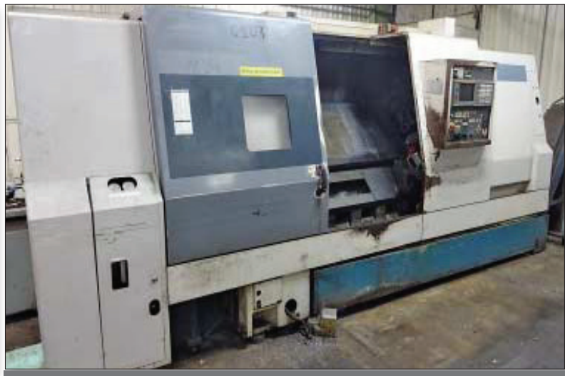
MORI SEIKI MODEL SL-35 CNC TURNING CENTER