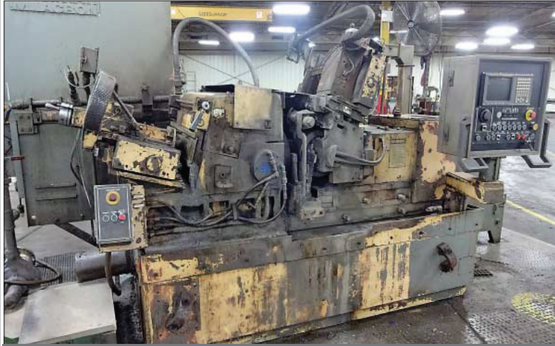
CINCINNATI MODEL 350-20 CNC CENTERLESS GRINDER