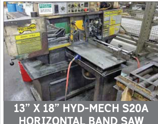
13" X 18" HYD-MECH S20A HORIZONTAL BAND SAW