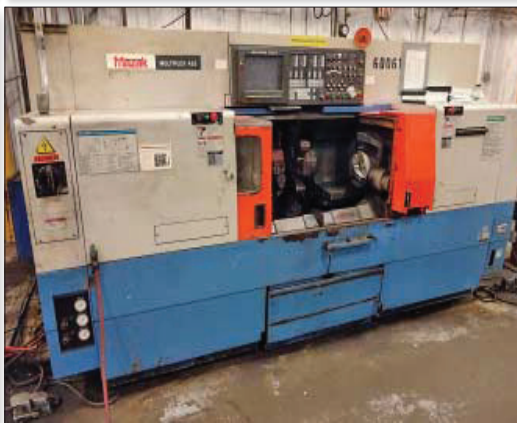
MAZAK MODEL MULTIPLEX 425 TWIN-SPINDLE CNC TURNING CENTER