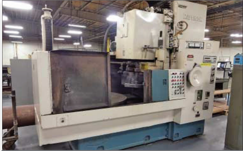
42" MATTISON NO. 24 ROTARY SURFACE GRINDER