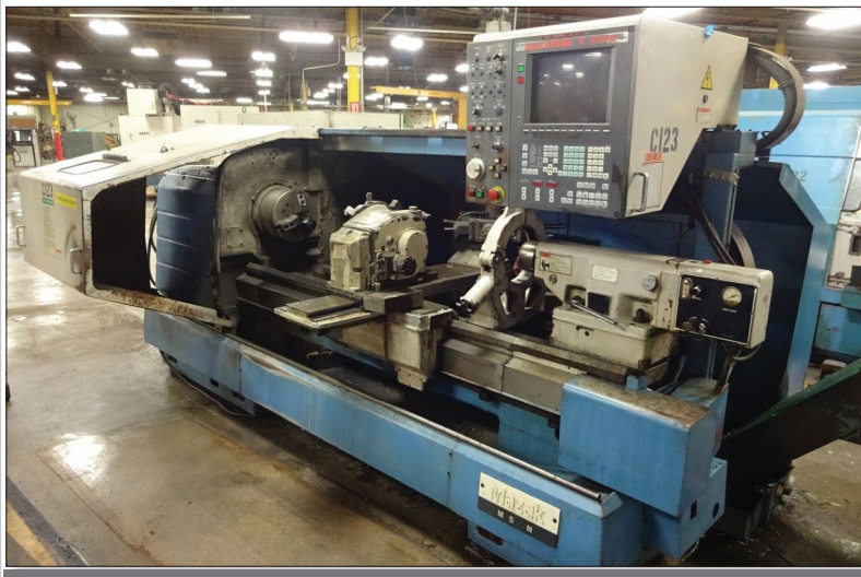
MAZAK MODEL M5NX-1500 FLAT BED CNC LATHE

Centerless Grinders, CNC Turning Centers, CNC Machining Centers, Engine Lathes, ID & OD Grinders, Toolroom Machinery, Air Compressors & Support Equipment