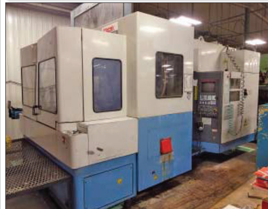
MAZAK ULTRA 650 TWO PALLET CNC HORIZONTAL MACHINING CENTER