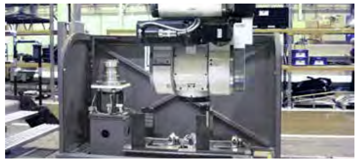
Automatic head changing