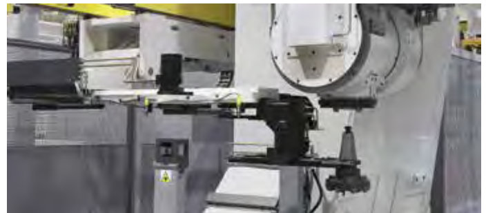
Automatic tool changing