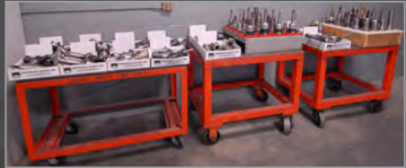
Partial view of CAT 50 tool holders available

FEATURING: SCHUNK (2005) PC2000 bench type shrink fit machine with HSK 63, HSK 50 and SK 50 attachments s/n: 7001748; GLASS MFL-0-D-24-00-161 24 station digital heat controller with (23) digital hot runner temperature control stations; MITUTOYO B251 bridge type CMM with 80"x41" granite table; 60"x36"x8" granite surface plate with stand; (15+) LISTA tool cabinets, LARGE QUANTITY OF HEAT SHRINK tool holders with HSK A63, HSK A100, HSK E50 & CAT 50, angle plates, set up blocks, (4) hydraulic die lift carts, TECHNOMAGNETE magnetic tombstones & chucks, eye bolts, lifting magnets, lifting chains, outside micrometers, vernier calipers, pin gauge sets, 3R EDM tooling, MITSUISEIKI 31.5" rotary table, machine vises, HUGE ASSORTMENT OF CARBIDE & HSS tooling including end mills, taps, drills, CRAFTSMAN 16 HP 42" electric lawn tractor, CANON iPF770 36" inkjet colour printer/plotter, FULL SELECTION OF OFFICE FURNITURE & BUSINESS MACHINES and MUCH MORE!