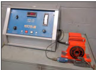
BONAL TECHNOLOGIES META-LAX stress relief machine