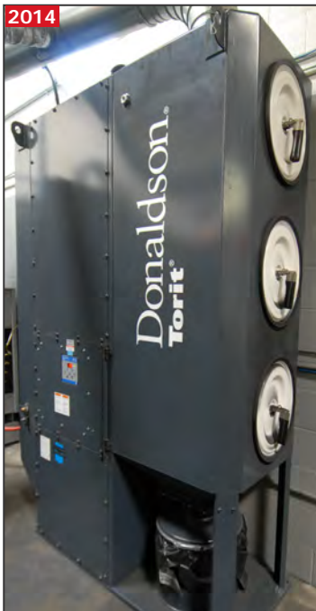
DONALDSON TORIT DOWNFLO OVAL DF03-3 cartridge type dust collector