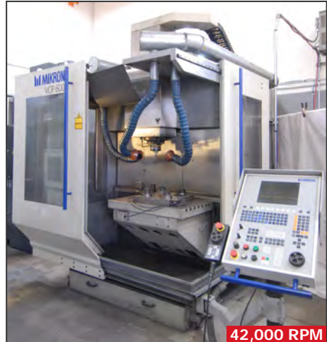
MIKRON VCP600-HS high speed CNC vertical machining center