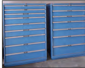
Partial view of LISTA cabinets available