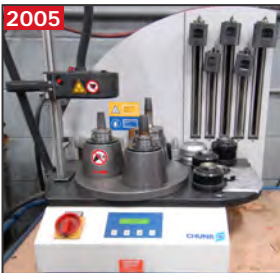
SCHUNK PC2000 bench type shrink fit machine