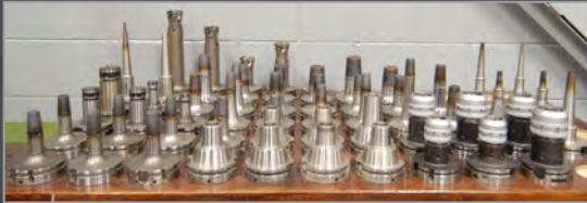
Partial view of HSK tool holders available