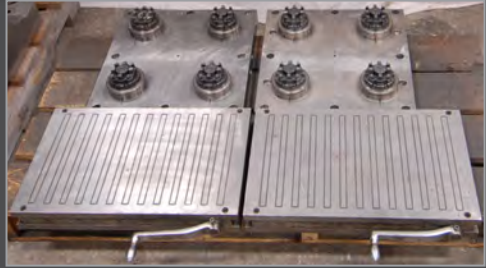
3R SYSTEM chucks & magnetic chucks