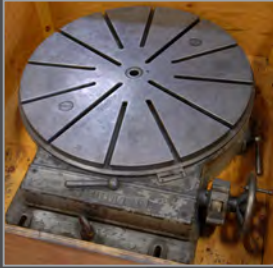
MITSUISEIKI 31.5" rotary table