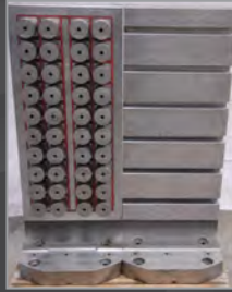
TECHNOMAGNETE magnetic tombstones