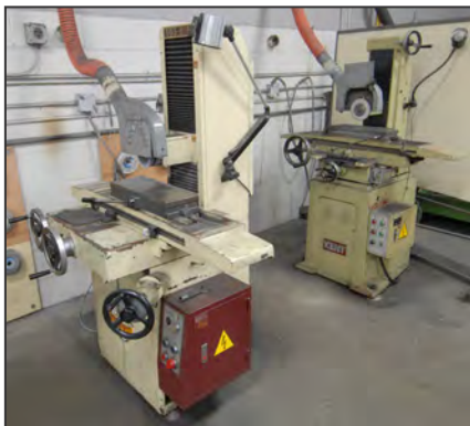
Partial view of surface grinders available