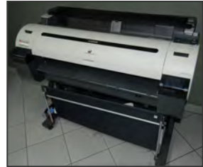
CANON iP6770 36" inkjet colour printer/plotter