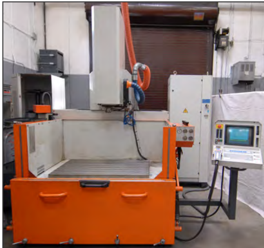
CHARMILLES ROBOFORM 84 CNC ram type EDM