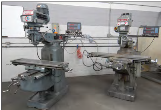
Partial view of vertical mills available