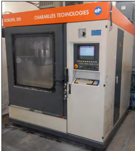
CHARMILLES ROBOFIL 510 CNC wire EDM