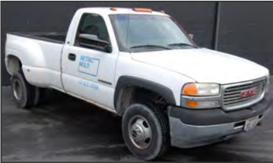
GMC 3500 SL dually pickup truck