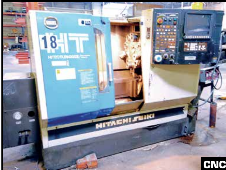
SAMPLE VIEW OF HITACHI SEIKI LATHES AND CELLS

THESE LATHES AND ROBOTS ARE CURRENTLY CONFIGURED IN MANUFACTURING CELLS AND WILL BE OFFERED INDIVIDUALLY AND AS COMPLETE CELLS.