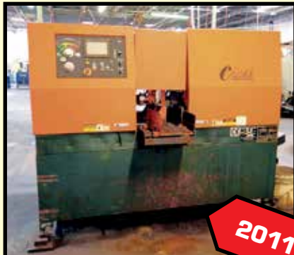
COSEN MDL. C-TECH C2 AUTOMATIC HORIZONTAL BANDSAW