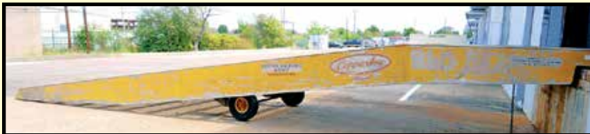
COPPERLOY ALUMINUM TRUCK RAMP

LIFT-RITE 5,000-LB. CAP. HYDRAULIC PALLET JACK; 60"W. X 60"L. ALUMINUM DOCK PLATE; COPPERLOY ALUMINUM TRUCK RAMP w/wheels.