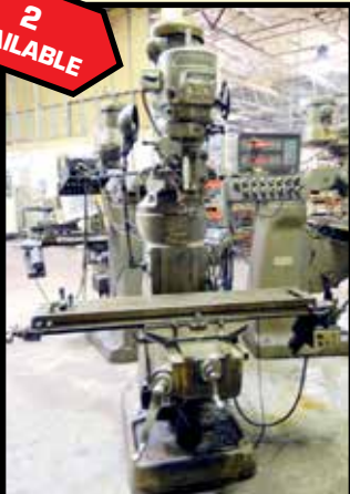
BRIDGEPORT SERIES 1 VERTICAL TURRET MILLING MACHINE