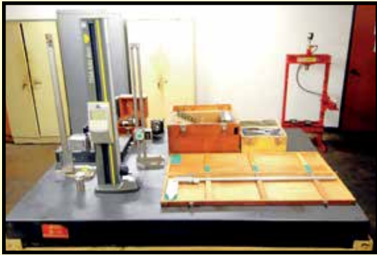
VIEW OF PRECISION INSTRUMENTS