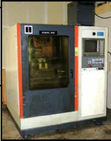
CHARMILLES MDL. ROBOFIL 290F WIRE EDM MACHINE