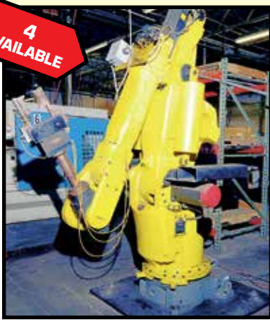
FANUC S-420iW 6-AXIS ROBOTS