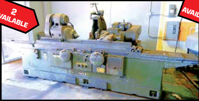
CINCINNATI 10" X 48" UNIVERSAL PLAIN CYLINDRICAL GRINDERS