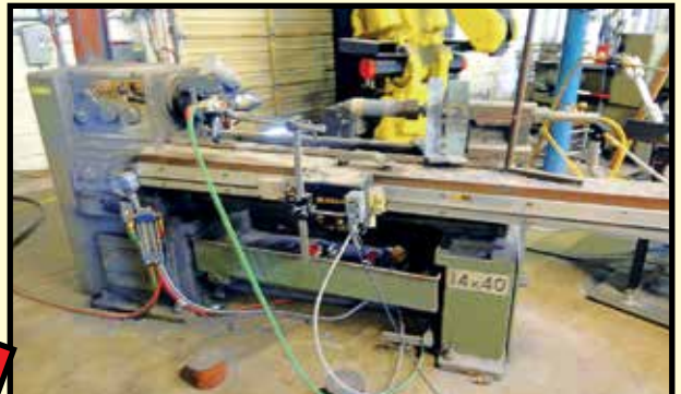
CHINESE MFG. 14" X 40" METALLIZING ENGINE LATHE