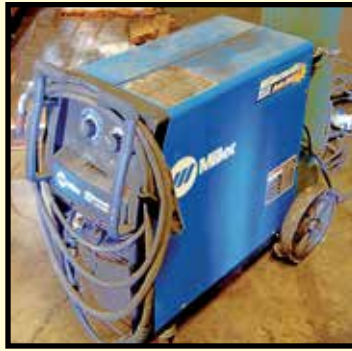
MILLER MILLERMATIC AUTOSET INTEGRATED MIG WELDER