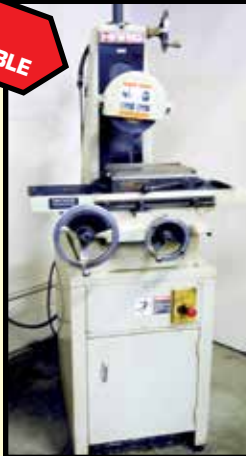
HARIG MDL. 612 HAND FEED SURFACE GRINDERS