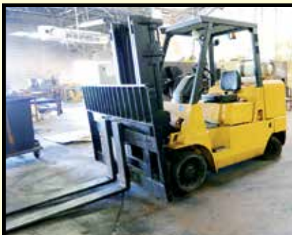
CATERPILLAR 10,000-LB. FORKLIFT

See Machine Demonstrations Online & at Inspection. Don't Miss This Sale!