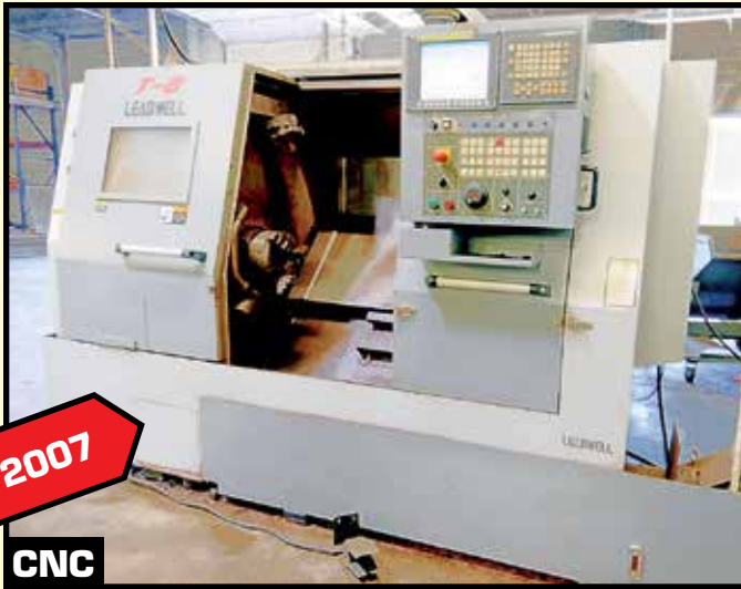
LEADWELL MDL. T-8 CNC LATHE