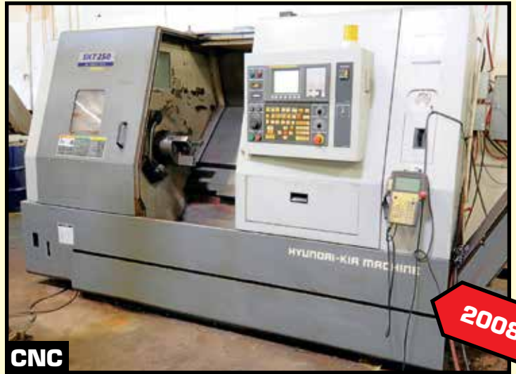
HYUNDAI KIA MDL. SKT-250 CNC LATHE