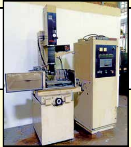
ELTEE PULSATON MDL. TRM-21 EDM MACHINE

INSPECTION: Monday, October 19 9:00 A.M. to 4:00 P.M. & Morning of Sale