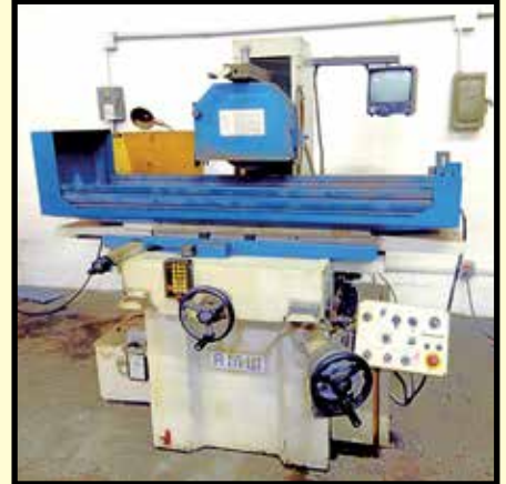
AMW 10" X 20" AUTOMATIC SURFACE GRINDER