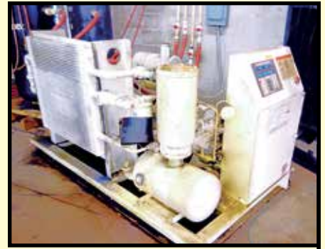
GARDNER DENVER 50 HP ROTARY SCREW AIR COMPRESSOR