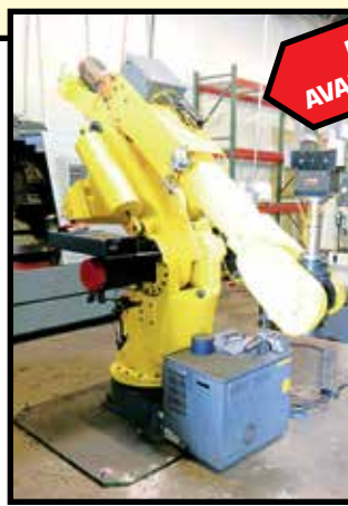
FANUC S-420iF 6-AXIS ROBOTS