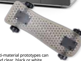
Multi-material prototypes can blend clear, black or white to communicate ideas and simulate finished products