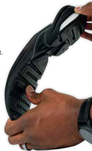
Shoe sole printed at one time in a combination of flexible black elastomer and rigid white plastic

Accurate prototypes improve communication with technicians and suppliers, reducing expensive rework. MJP is also used to make rapid tooling at a lower cost than traditional tools, jigs and fixtures.