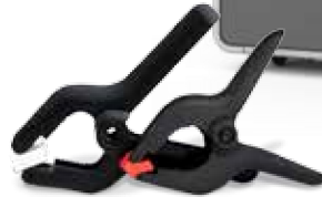
Accurate models let you check fit on complex shapes