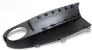
New rigid black plastic Visijet® CR-BK enables even more composite mechanical performances