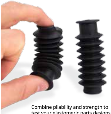
Combine pliability and strength to test your elastomeric parts designs