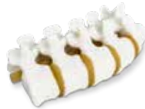
Print realistic medical models in rigid and elastomeric materials