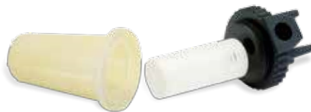
Functional filter prototype printed in clear, white and black rigid plastics