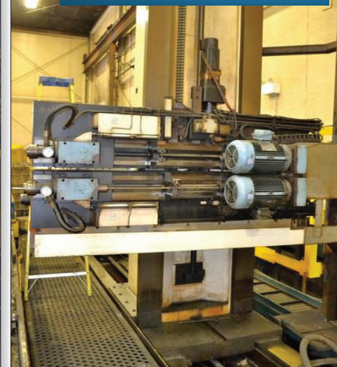
DADSON DS-1242-HD-BTA 2-SPINDLE TRAVELLING COLUMN GUN DRILLING MACHINE #28057