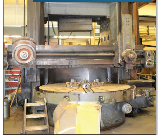
MORANDO VK25 98" VERTICAL TURRET LATHE #28060