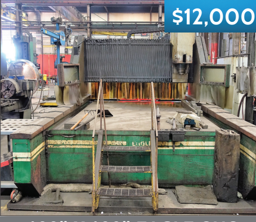
100" X 100" EAGLE CNC GANTRY-TYPE VERTICAL MACHINING CENTER #28074