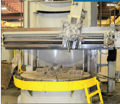
BULLARD 74" CUTMASTER VERTICAL TURRET LATHE #28072