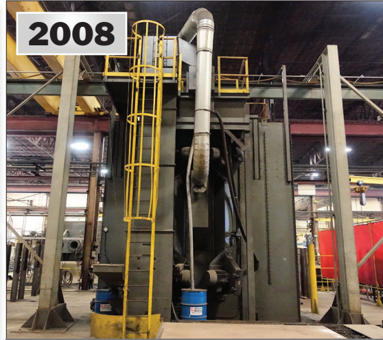
PANGBORN ES-1848 VERTICAL PLATE & STRUCTURAL STEEL BLAST CLEANING MACHINE #27976