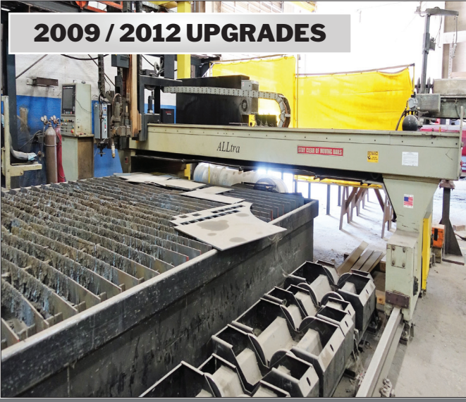
ALLTRA PG30-14 11' X 47' CNC PLASMA PLATE & PIPE CUTTING SYSTEM WITH TORIT DUST COLLECTOR #27977