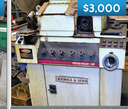
GIDDINGS & LEWIS WINSLOMATIC HR DRILL POINT GRINDER #28059