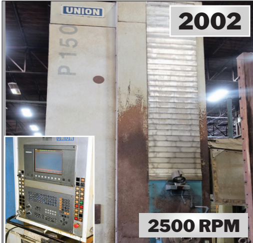
5.9" UNION PC150 CNC FLOOR TYPE HORIZONTAL BORING MILL #28075