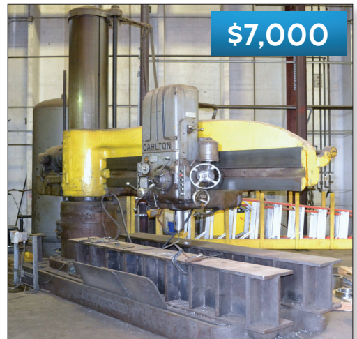
CARLTON 4A 8' X 19" RADIAL ARM DRILL #28061