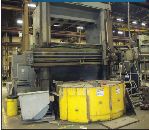
SUMMIT 120" VERTICAL TURRET LATHE #23809